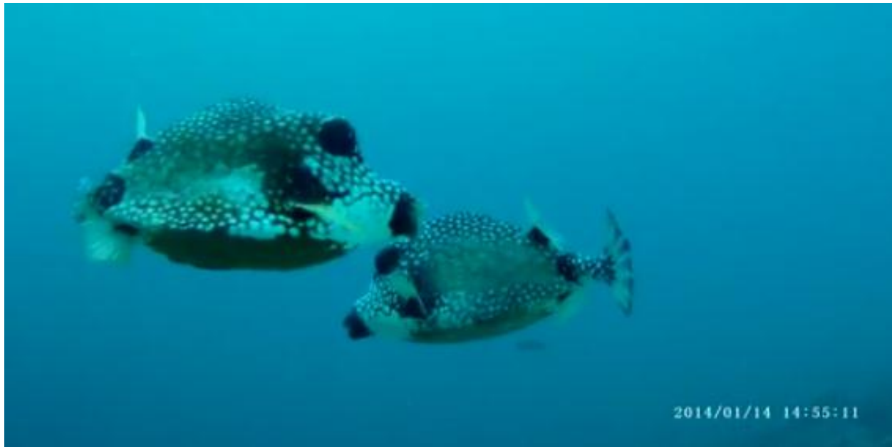
Fig. 5. Mating dance of a male and female honeycomb cowfish.

[ http://speciesidentification.org/species.php?species_group=caribbean_diving_guide&menueentry=soorten&id=174&tab=refs , downloaded 21 March 2015]