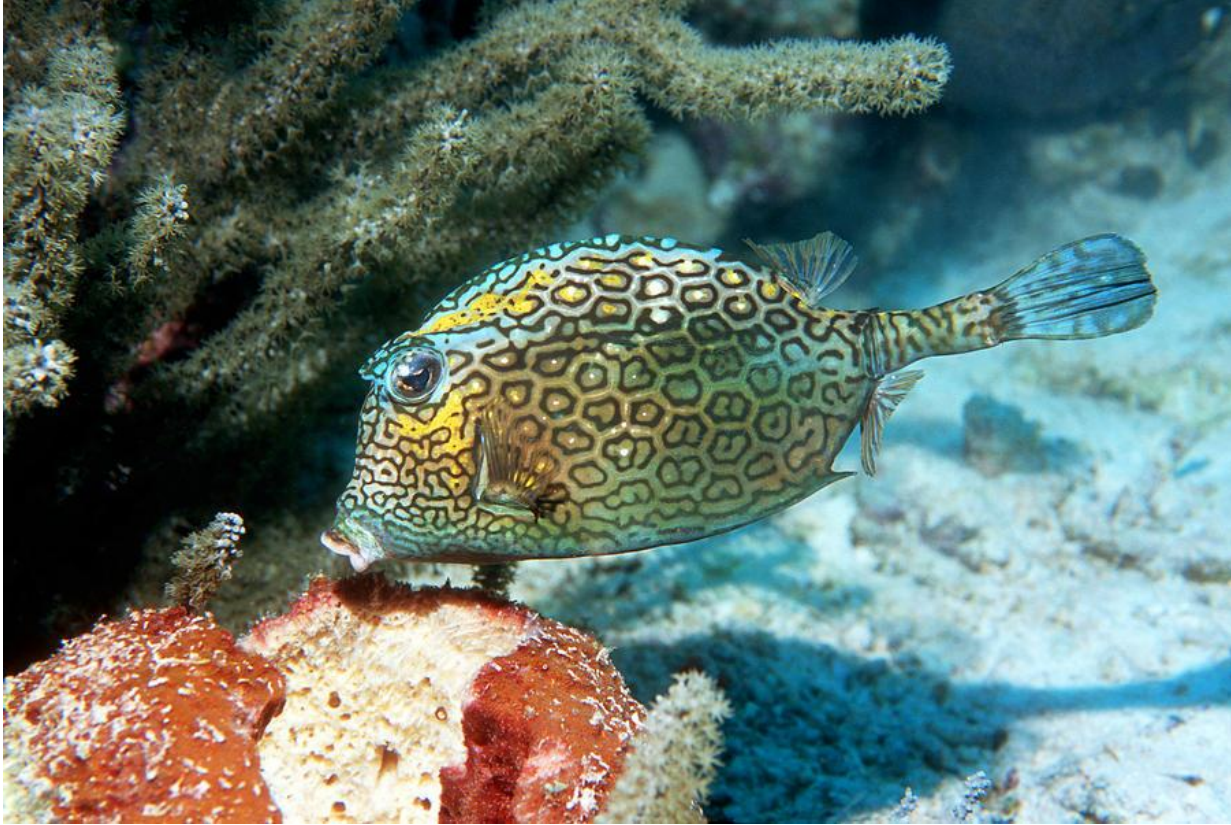
Fig. 1. Honeycomb cowfish, Acanthostracion polygonius .

[ http://www.whatsthatfish.com/fish/honeycomb-cowfish/1524#2 , downloaded 28 February 2015]