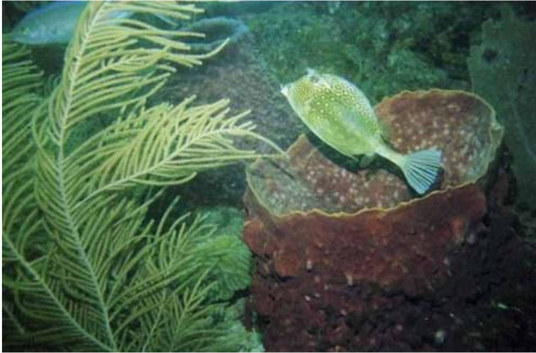
Fig. 3. A honeycomb cowfish over a barrel sponge on a reef.

[ http://www.scubadiver.cc/forums/showthread.php?445-Cowfish _downloaded 15 March 2015]