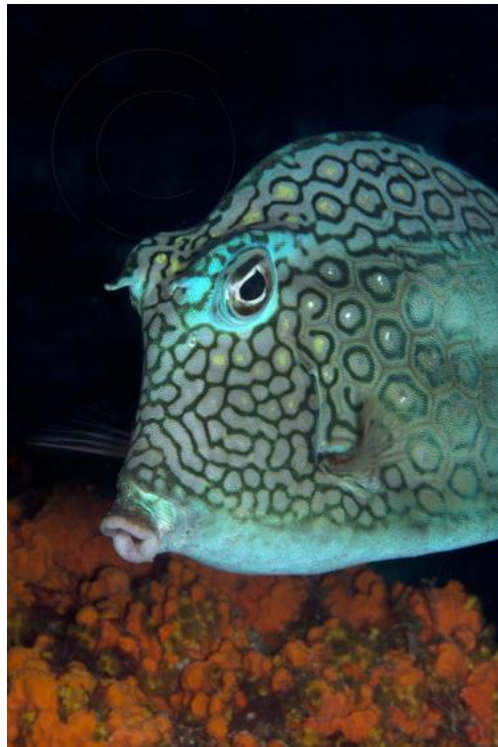
Fig. 6. The two spines over the eyes of the honeycomb cowfish.

[ http://speciesidentification.org/species.php?species_group=caribbean_diving_guide&menueentry=soorten&id=174&tab=refs , downloaded 21 March 2015]