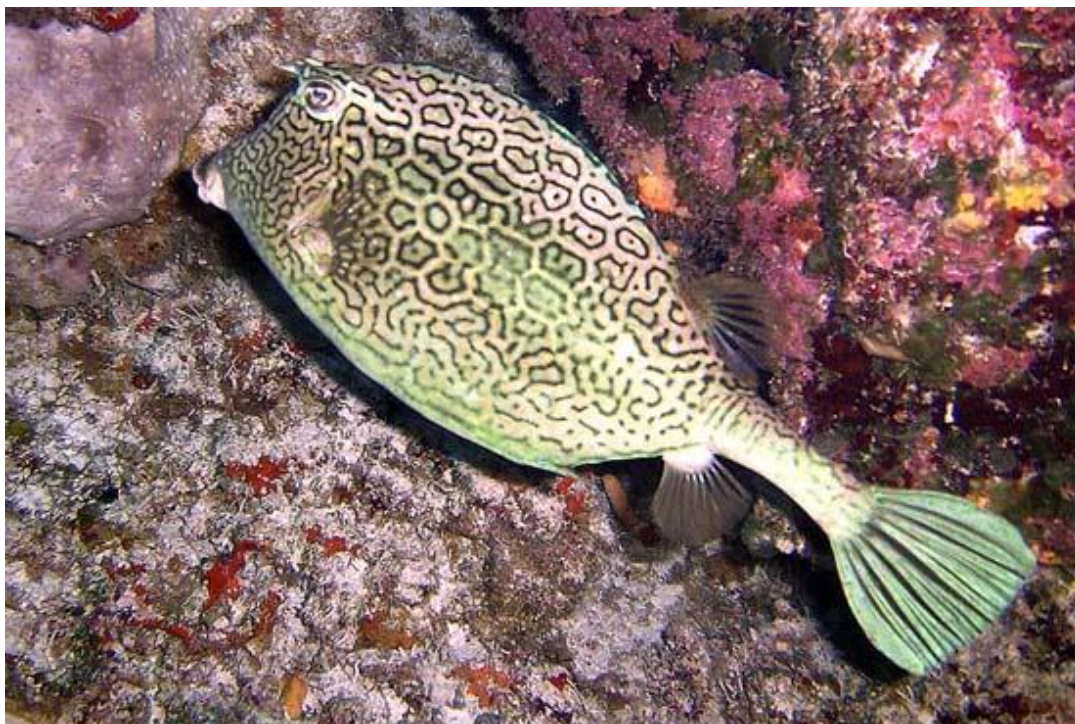
Fig. 4. A honeycomb cowfish feeding.

[ http://www.scubadiver.cc/forums/showthread.php?445-Cowfish _downloaded 15 March 2015]