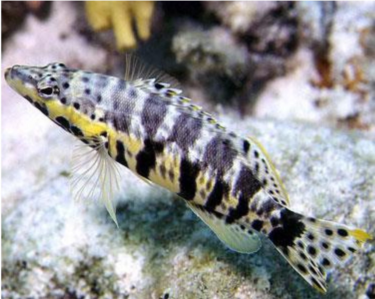
Fig. 1. Harlequin bass, Serranus tigrinus .

[ http://www.aquariumdomain.com/viewSpeciesMarine.php?id=108 , downloaded 23 October 2016]