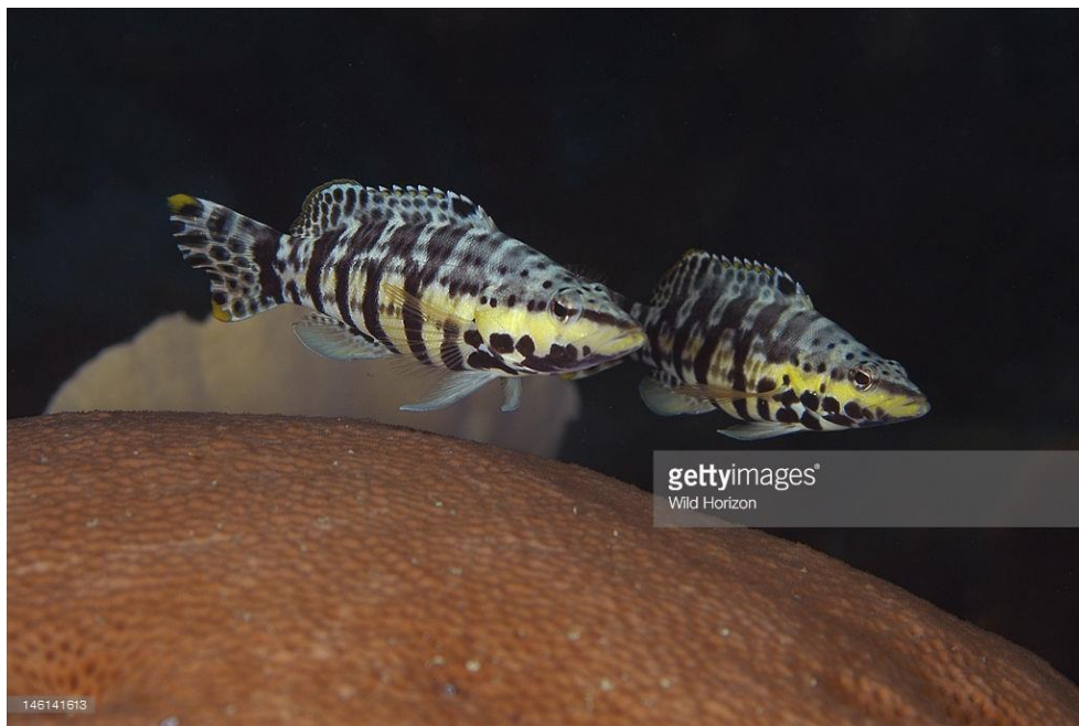
Fig. 3. Harlequin bass moving around in a pair.

[ http://www.fishbase.de/Country/CountryList.php?ID=3350&GenusName=Serranus&SpeciesName=tigrinus , downloaded 23 October 2016]