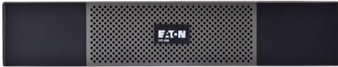
Eaton 5PX version pictured

The Eaton® 3G Enterprise Extended Battery Module (EBM) is designed as an optional integrated backup power source to the 3G Enterprise Power Systems, providing secure power during AC grid failure for anything from orderly shutdowns through to extended runtimes for continuity of service.