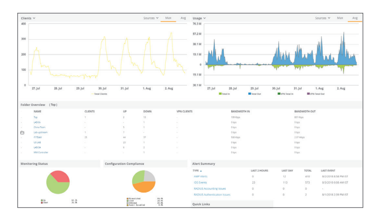
Figure 1: Aruba AirWave Dashboard