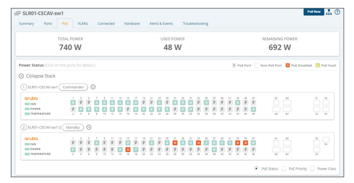
Figure 2: Aruba AirWave Switch Faceplate View

When looking at switch information, additional visibility into key values of individual and stacked switches is provided. This includes port status, PoE consumption, VLAN assignment, device and neighbor connections, power status and trends, alerts and events and which troubleshooting actions can be performed.