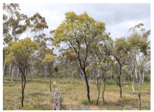
Figure 3. Quandong trees up to 3 m in height and are still relatively young of age, growing in an open clearing surrounded by Wandoo ( Eucalyptus ) woodland

growing on a quandong, an example of hyperparasitism (Fig. 4).