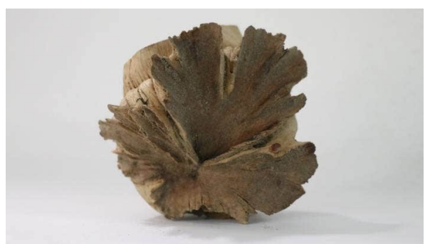
Wood rose, caused by the parasitic plant Pua o te Rēinga, meaning 'flower of the underworld'.

In nearby locations like Pureora Forest Park, they tended to flower around March. Mudge estimated a group of 30 or so flowers, each with a lifespan of only 7-10 days, would produce collectively 0.5mL of nectar in that time. But flowers were something that wouldn't be seen for at least five years, as the plant was slow to germinate and start growing – if they grew at all.