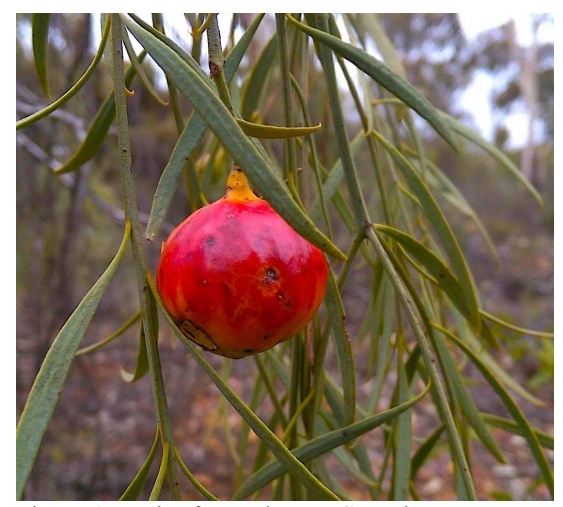
Figure 1. Fruit of quandong – Santalum acuminatum

Most studies on the genus Santalum have focused on the sandalwood species and how to increase their yield either through suitable host trials or other environmental field experiments. Though looking at host preferences for Santalum in an ecological context has been lacking.