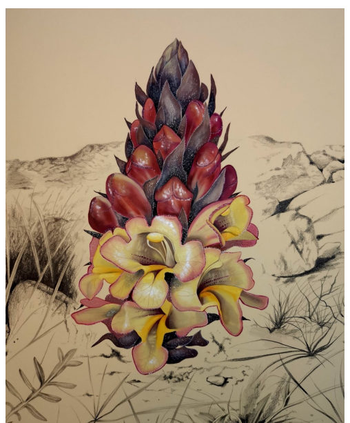
Painting by Chris Thorogood of Cistanche fissa in Israel.

https://www.oxfordsparks.ox.ac.uk/content/faceb ook-live-worlds-largest-flower