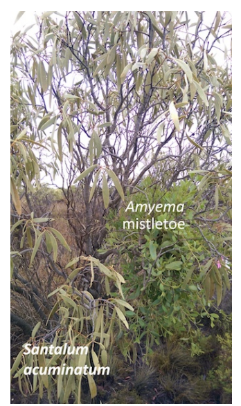
Figure 4. Quandong being parasitised by another plant parasite – an Australian mistletoe species ( Amyema )

Figure 3. Quandong trees up to 3 m in height and are still relatively young of age, growing in an open clearing surrounded by Wandoo ( Eucalyptus ) woodland