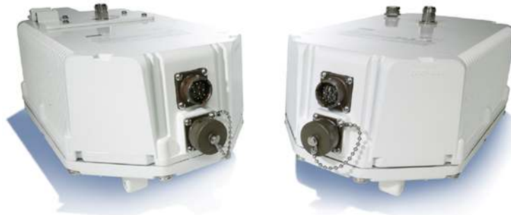
Figure 1. Cisco Aironet 1500 Series

The Cisco Aironet 1500 Series supports options for dual-band, simultaneous support for IEEE 802.11a and 802.11b/g standards with the 1510* model or single-band support for IEEE 802.11b/g with the 1505 model. Both models employ Cisco's patent-pending Adaptive Wireless Path Protocol (AWPP) to form a dynamic wireless mesh network between remote access points, while delivering secure, high-capacity wireless access to any Wi-Fi-compliant client device (Figure 2).