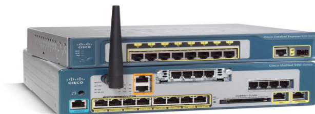
Figure 2. Cisco Unified Communications 500 Series: 24- and 32-User Configuration