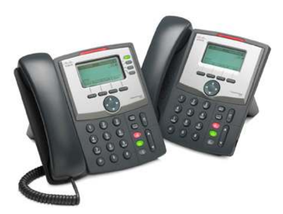
Figure 5. Cisco Unified IP Phone 500 Series

The phones in the Cisco Unified IP Phone 500 Series work exclusively with the Cisco Unified Communications 500 Series for Small Business and cannot be used with other Cisco call processing platforms.