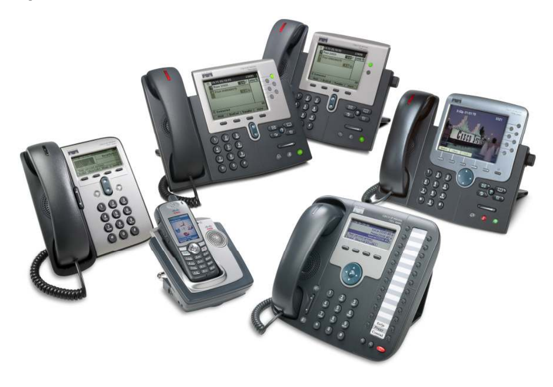
Figure 4. Cisco Unified IP Phone Portfolio

The Cisco Unified IP Phone portfolio includes options for use from wherever you are: the company lobby, the manufacturing floor, the executive suite, at home, on the road, or in a branch office (Figure 4).