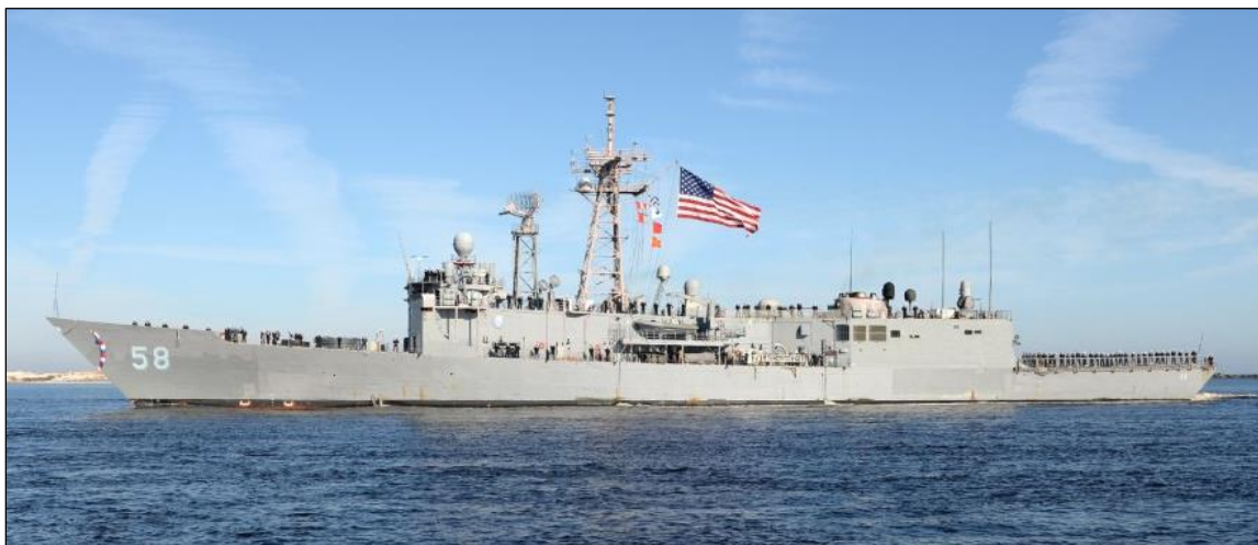
Figure 1. Oliver Hazard Perry (FFG-7) Class Frigate