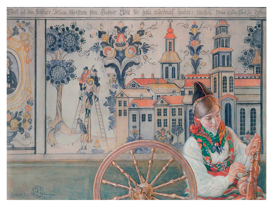
Image 8: In 1917, Carl Larsson completed The Spinner on a visit to Bingsjö. The painting was immediately sold to a buyer abroad and was not rediscovered until 2007. In the background we see Carl Larsson's copy of Winter Carl's Descent from the Cross showing the lower left corner before it was damaged.

As can be seen, the painting has been damaged. This damage must have occurred sometime after 1917. For decades it was impossible to know what the artist might have painted in the lower left corner. In 2007, however, a previously unknown watercolour by Carl Larsson surfaced at an auction sale. It shows a woman sitting at a spinning-wheel against the background of Winter Carl's Descent from the Cross (Image 8). It is one in a series of watercolours that Carl Larsson completed in 1917 during a visit to Bingsjö. Soon after painting it, he sold the work to a buyer from Austria, where it remained until 2007.<sup>29</sup> Carl Larsson's painting reveals that originally one additional person supported the central ladder on which Christ is being carried down. With this addition the composition is much firmer than in the damaged version. The Carl Larsson painting also indicates that Winter Carl included two female figures, presumably the two Marys.