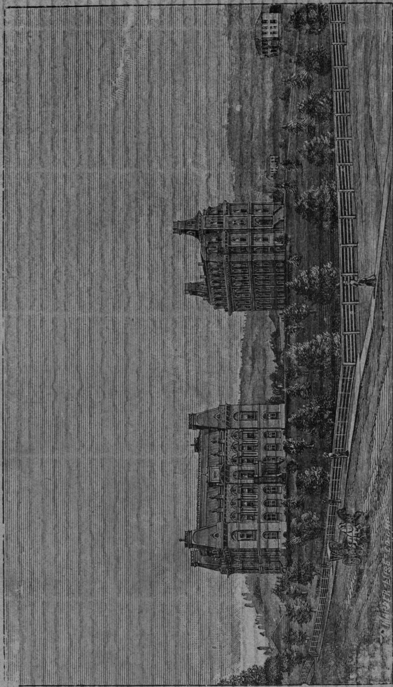
UNIVERSITY OF OREGON, EUGENE.