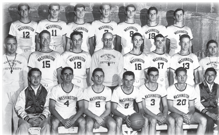
The 1949-50 Bears won a then-school record 17 games, against just six losses.