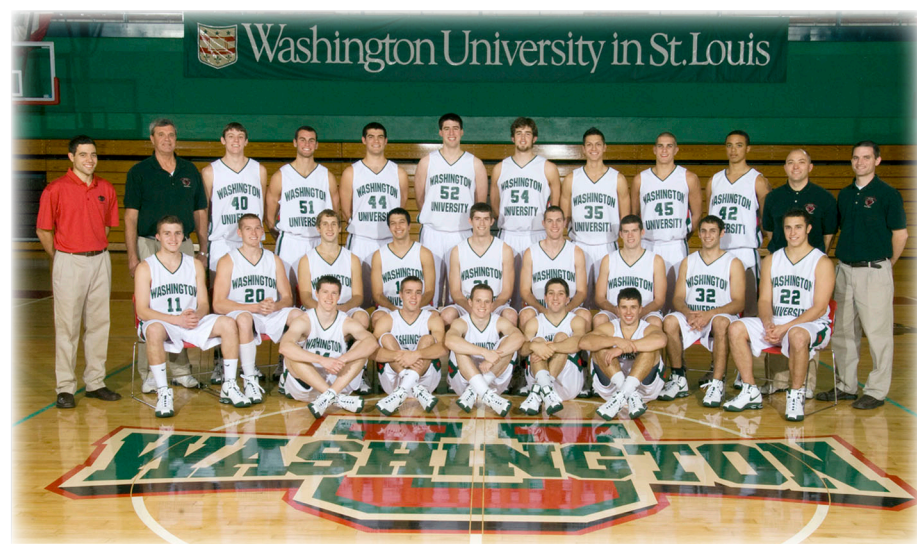
The 2008-09 team made it back-to-back national championships for the Bears by posting a school-record 29-2 overall mark.