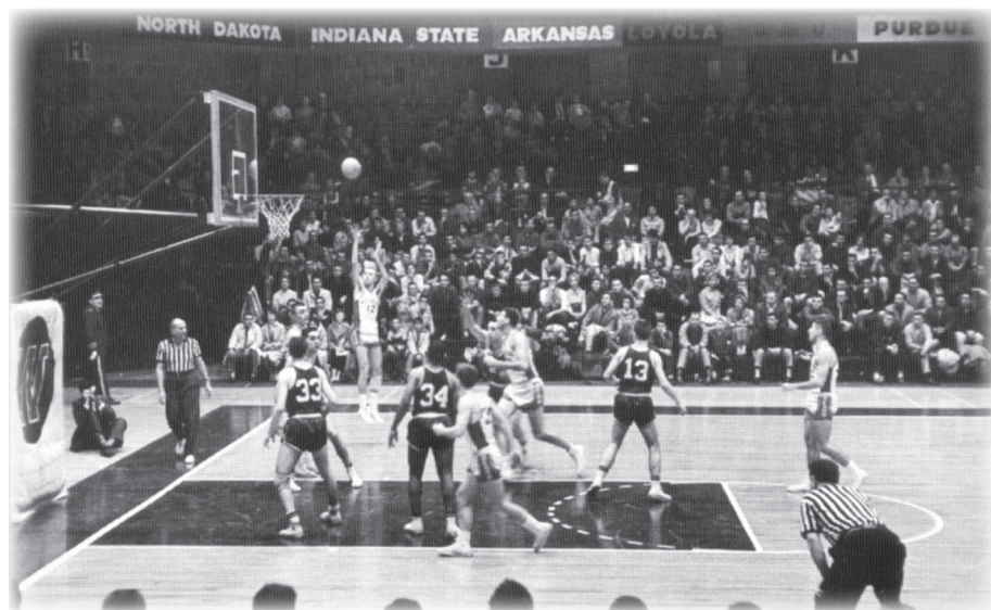
Basketball action in the old Washington University Field House.