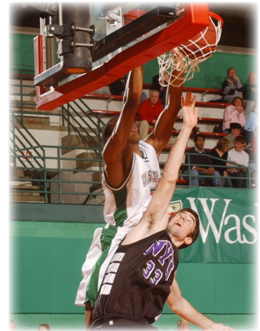
The Bears have recorded 36-consecutive winning seasons dating back to the 1984-85 season.