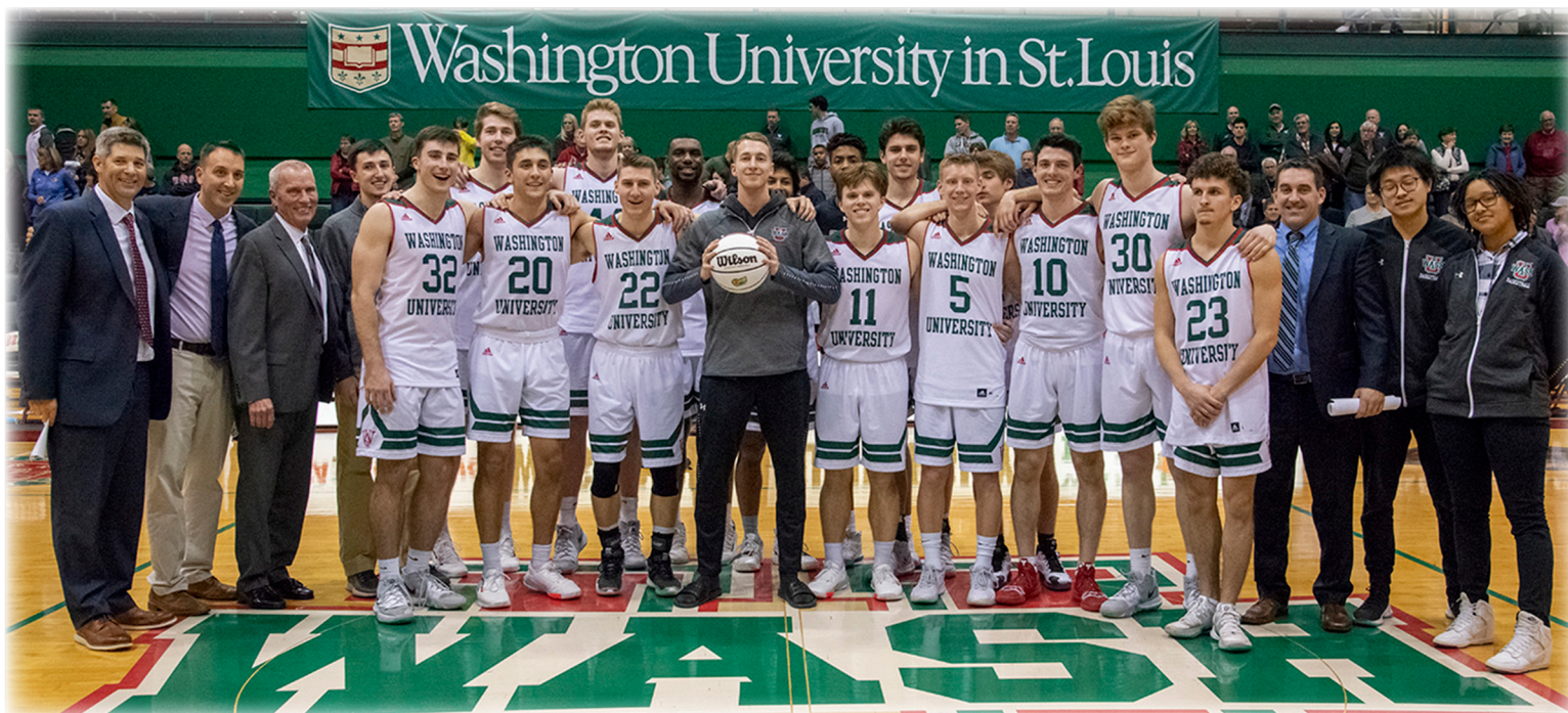
36th Annual Lopata Classic Champions, Washington University in St. Louis