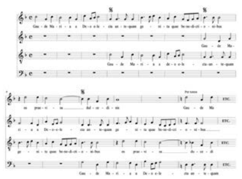
Fig. 2: First 12 bars of Gaude Maria a Deo Electa. Transcribed by J. Stoessel.