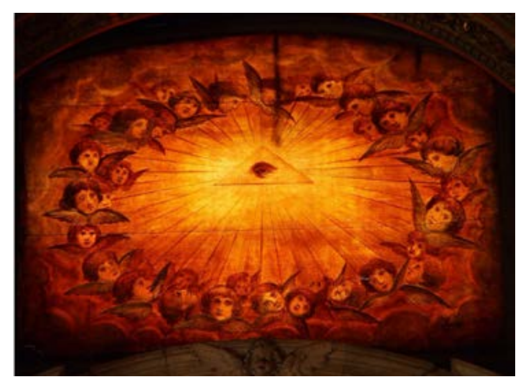
Fig. 3: Domenico Cresti "Il Passignano" (1559–1638) and assistants, The Divine Eye , 1608–1610, fresco. Rome: Sacristy of S. Maria Maggiore.