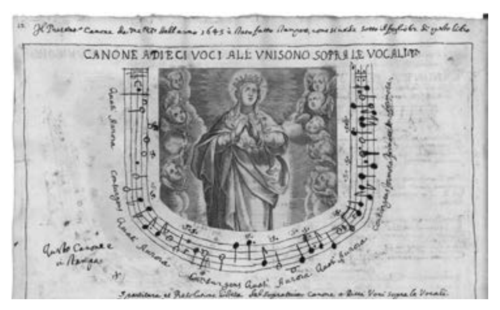
Fig. 6: Pier Francesco Valentini with anonymous artist and engraver, Canone a dieci voci all'unison sopra le vocali Quasi aurora consurgens, published 1645, copied c.1650, manuscript and pasted-in line art print on paper. Rome, Biblioteca Apostolica Vaticana, Barb. Lat. 4428, p. 12.

Valentini's collection of canons and religious prints in his Canoni di diversi studi belongs to a culture of collecting in early modern Europe. The term 'culture of collecting' refers not only to the collection, organisation and display of artworks, artefacts, and natural specimens in early galleries and museums, as was abundantly on display in seventeenth-century Rome.<sup>40</sup> It also encompasses the conspicuous amassing and exchange of household and personal goods from the middle of the sixteenth century. This phenomenon is amply demonstrated by the notary records and private account books from seventeenth-century Rome.<sup>41</sup> This wealth of documentation, which includes a broad segment of the Roman middle class, forms the basis of Renata Ago's account of seventeenth-century material culture in the eternal city. Rather than representing a simple emulation of the noble classes, Ago illustrates how social and gendered behaviours reveal various attitudes to the keeping of objects, which are valued more for their aesthetic, pleasure-giving worth