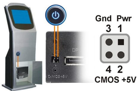
Location of Jumper J9