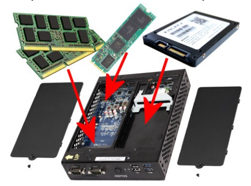
2,5" SSD oder Festplatte