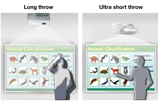
Significant reduction in shadow interference

BrightLink's ultra-short-throw projector design eliminates many of the common problems of interactive systems, such as shadowing and eye glare. With an incredibly efficient 0.27" throw ratio, BrightLink 475Wi and 485Wi allow you to project extra-large interactive images up to 100" with the projector less than 10" away from the image surface. This greatly reduces shadows that often appear when using a traditional projector.