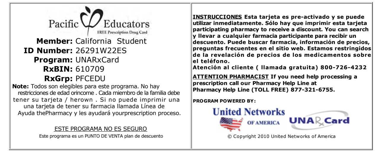
IMPORTANTE: TARJETA DE IMPRESIÓN . USTED NECESITA PARA LLEVAR ESTA TARJETA A LA FARMACIA CON SU RECETA.

Estamos orgullosos de anunciar que el Pacíÿco Educadores ahora está haciendo disponible una GRATIS con receta Programa de la tarjeta de drogæs a ayudar a alguien a reducir sus costos de medicamentos recetados.