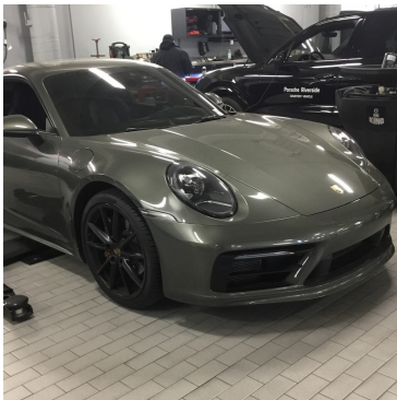
Exterior RF Corner