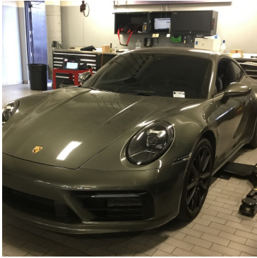
Exterior LF Corner