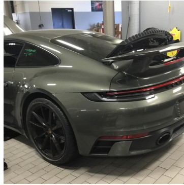
Exterior LR Corner