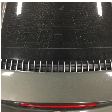
Exterior Deck Lid (or misc if not equipped)