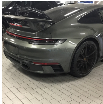
Exterior RR Corner