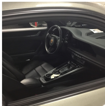
Miscellaneous (Keys/Manual,Tires, etc.)