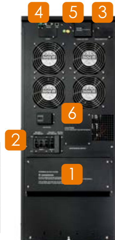
* Image shown is reverse of C500E-200