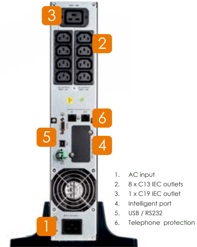
* Image shown is reverse of CRT300R-030-B