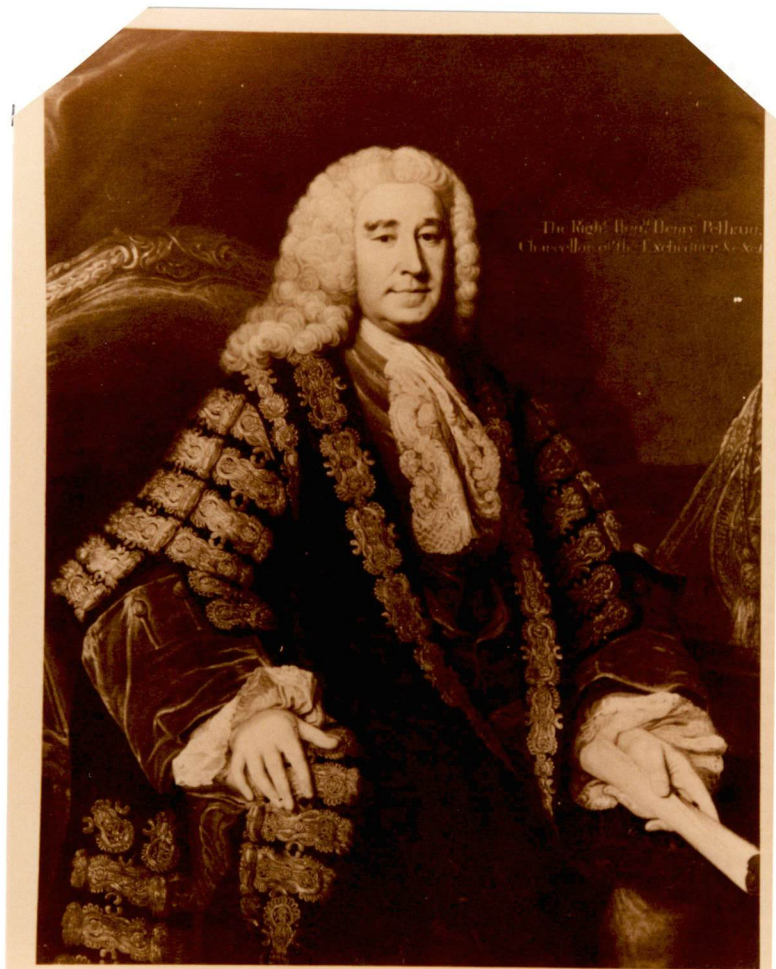
4 Henry Pelham, by William Hoare.