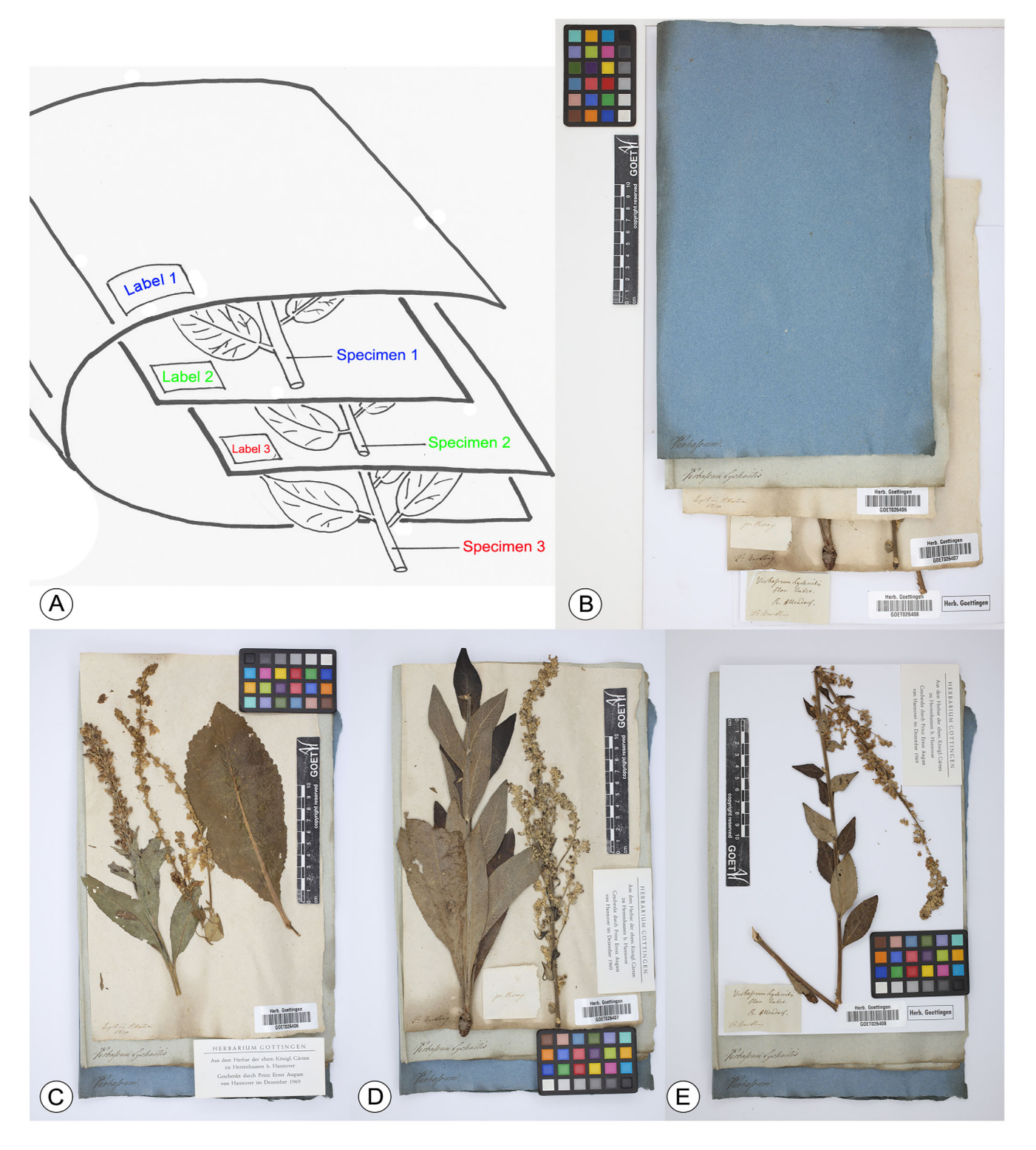
Fig. 1. An example of a species folder with more than one specimen in the Herrenhausen Herbarium ordered according to the Linnaean System. A , Pictogram showing the relation of label information with the specimens included in the folder; B , Blue genus folder " Verbascum " with the species folder " Verbascum lychnitis " and three collections included in it. For the digitization ( C – E ), specimens were positioned over the genus and species folders, in a way so that the information on these folders was visible. C , GOET026406: " Verbascum " (genus folder), " Verbascum lychnitis " (species folder), "Legit in Helvetia 1820" (written on sheet, bottom left); D , GOET026407: " Verbascum " (genus folder), " Verbascum lychnitis " (species folder), "Dr. Bartling" (written on sheet, bottom left), "p. Vevay" (written on loose label); E , GOET026408: " Verbascum " (genus folder), " Verbascum lychnitis " (species folder), " Verbascum Lychnitis flor. lutea pr. Allendorf Dr. Bartling" (written on loose label). Collection data for the specimens are: GOET026406: no locality and collector on sheet; GOET026407: Legit in Helvetia 1820, prope Vevay, HLW; GOET026408: prope Allendorf, Bartling.