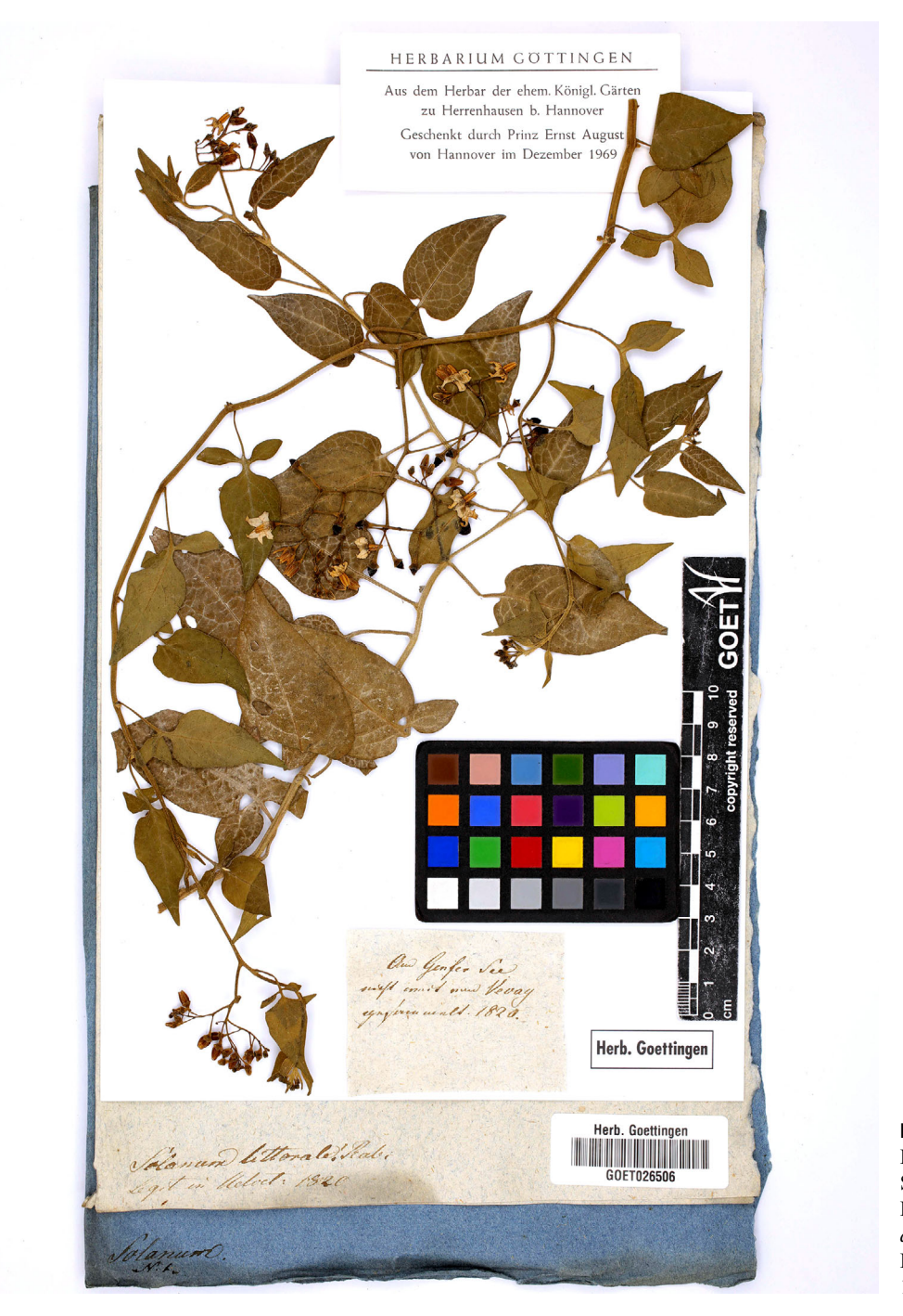
Fig. 6. Specimen collected by Heinrich Ludolph Wendland in Switzerland. Solanum littorale Raab (synonym of Solanum dulcamara L.) near Vevey, Lac Léman (= Lake Geneva), 23 July 1820; GOET026506.

According to Wagenitz (2016) there is no indication of collectors or dates in the herbarium "Flora alpina du Lac des