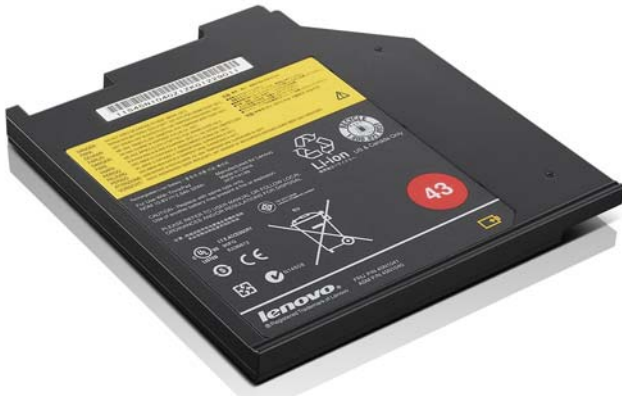
ThinkPad Battery 43 (3-cell, bay) 0A36310