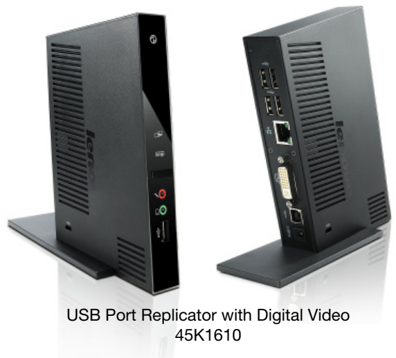
USB Port Replicator with Digital Video 45K1610