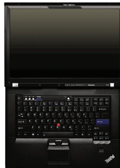
Lenovo ThinkPad T500