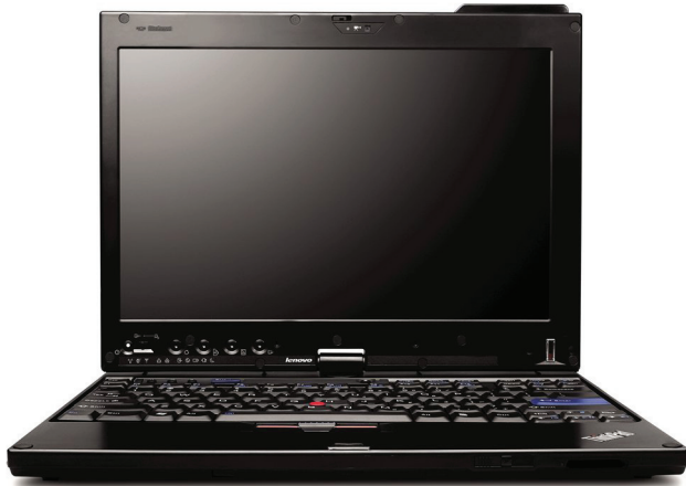
Lenovo® ThinkPad X200 Tablet