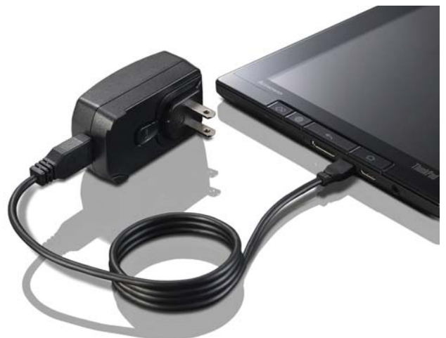
Lenovo ThinkPad Tablet with ThinkPad Tablet AC Charger 0A36248