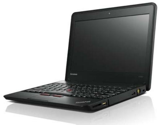
Lenovo ThinkPad X130e