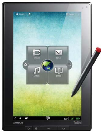
Lenovo ThinkPad Tablet with ThinkPad Tablet Pen 0A33887