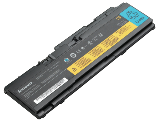
ThinkPad Battery 59+ (6-cell) 51J0497