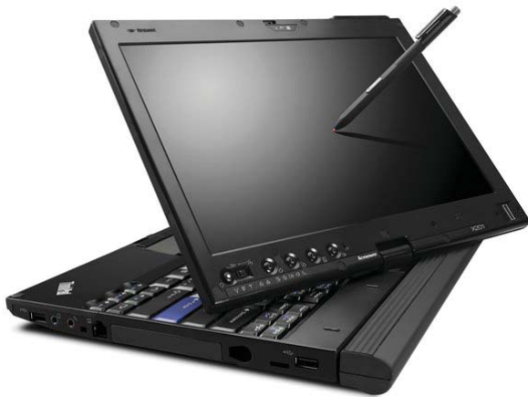
Lenovo ThinkPad X201 Tablet