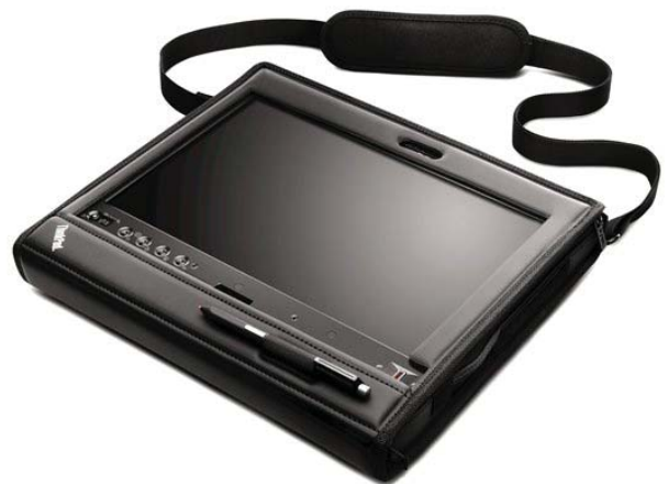
Lenovo ThinkPad X201 Tablet with ThinkPad X200 Tablet Sleeve 43R9115