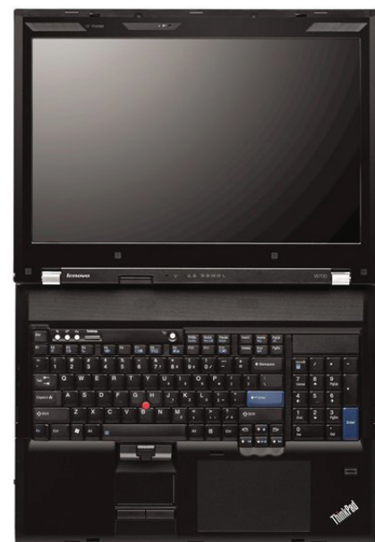
Lenovo ThinkPad W700