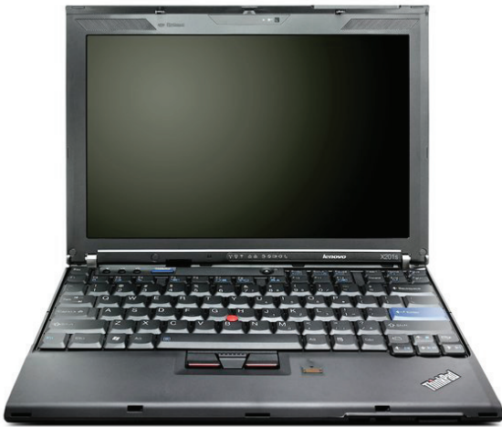
Lenovo® ThinkPad X201s (TrackPoint model)