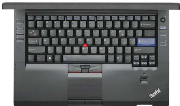
Lenovo ThinkPad L412