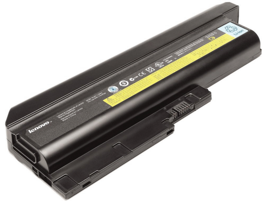
ThinkPad Battery 41++ (9-cell) 40Y6797