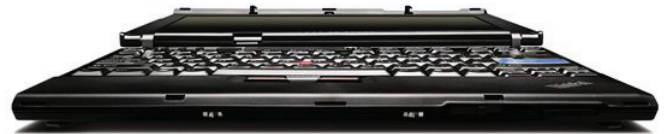
Lenovo ThinkPad X200s