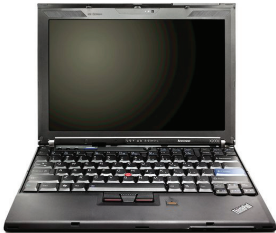
Lenovo® ThinkPad X200s