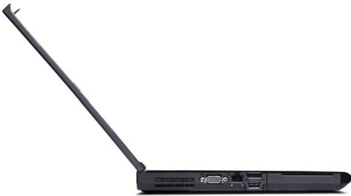
Lenovo ThinkPad T420