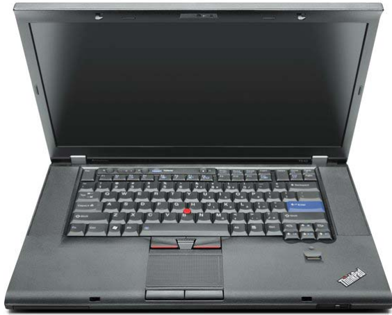
Lenovo® ThinkPad T510