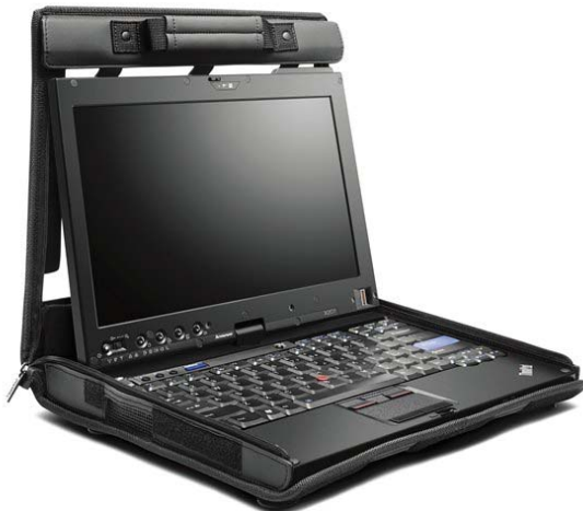
Lenovo ThinkPad X201 Tablet with ThinkPad X200 Tablet Sleeve 43R9115