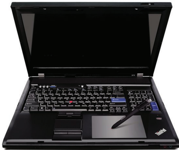
Lenovo® ThinkPad W700