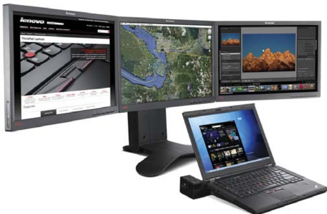
ThinkPad triple external monitor configuration using NVIDIA's Optimus technology