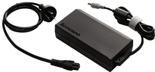
ThinkPad 170W AC Adapter 41R4421