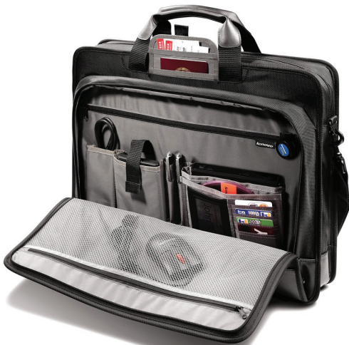
ThinkPad 17W Business Topload Case 43R9117