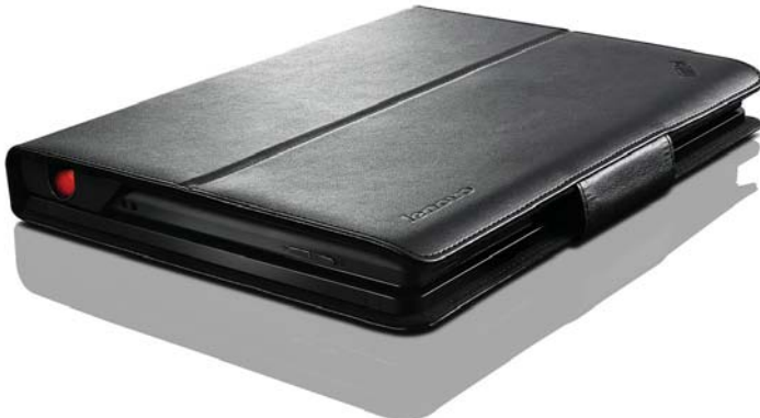
Lenovo ThinkPad Tablet with ThinkPad Tablet Keyboard Folio Case 0A36370