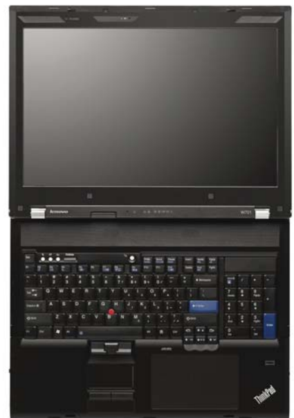
Lenovo ThinkPad W701