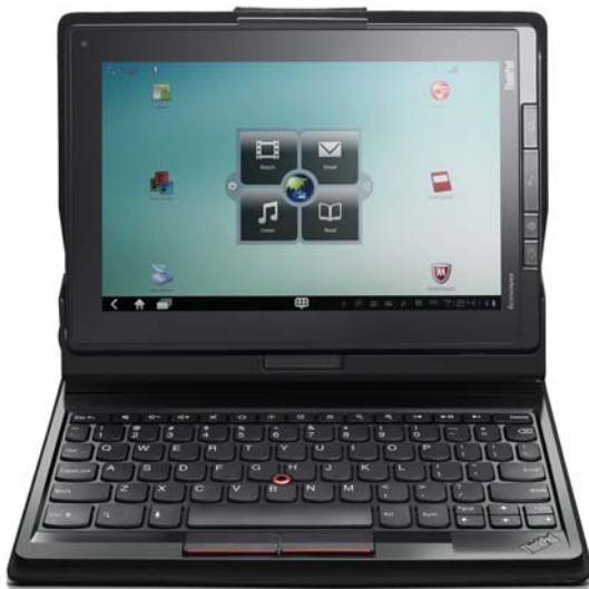
Lenovo ThinkPad Tablet with ThinkPad Tablet Keyboard Folio Case 0A36370