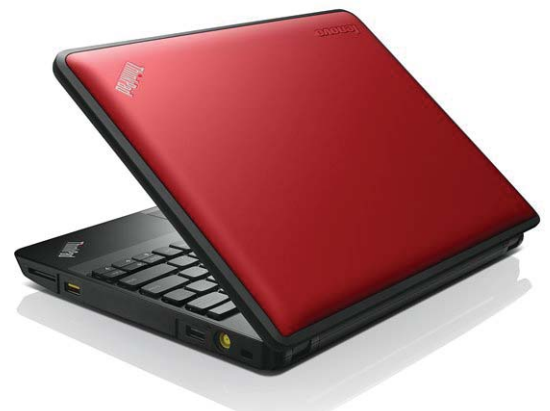
Lenovo ThinkPad X130e