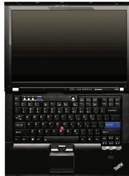
Lenovo ThinkPad R400