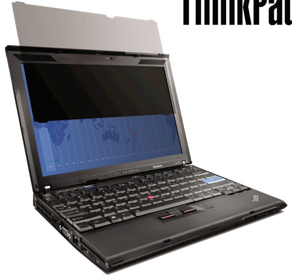
Lenovo ThinkPad X200 with X200/X200s (WXGA), X201 12W Privacy Filter 55Y9264