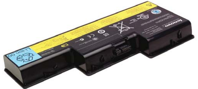
ThinkPad Battery 37++ (9-cell) 45J7914