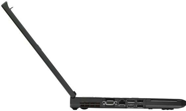
Lenovo ThinkPad T410