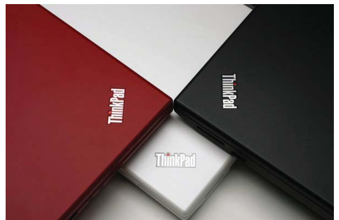
Lenovo ThinkPad X100e family