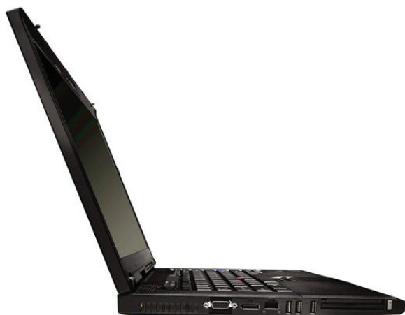
Lenovo ThinkPad T500