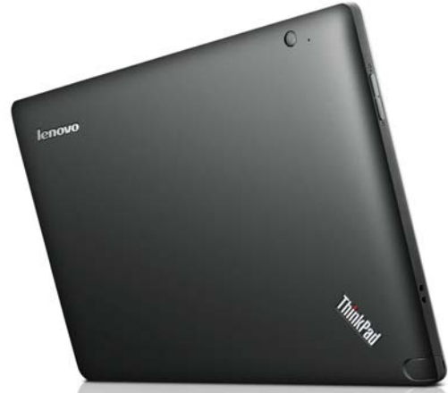
Lenovo ThinkPad Tablet