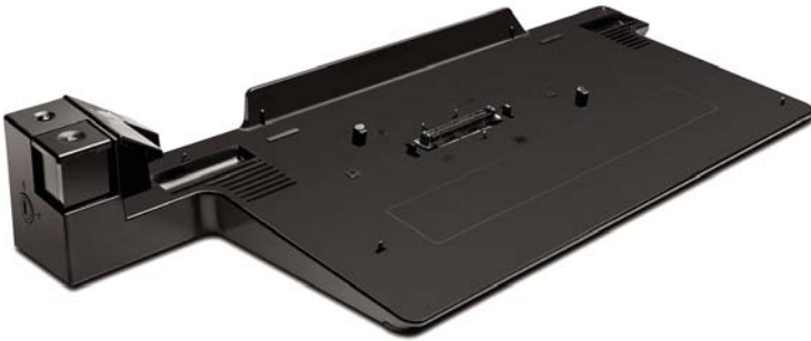
ThinkPad W700 Mini Dock 2.0 57Y4345