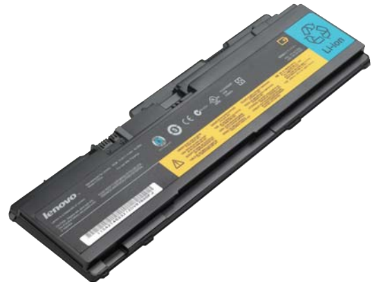
ThinkPad Battery 59+ (6-cell) 51J0497