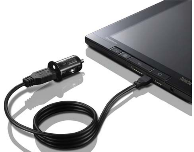
Lenovo ThinkPad Tablet with ThinkPad Tablet DC Charger 0A36247