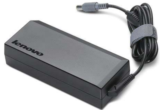
ThinkPad 135W AC Adapter 55Y9317