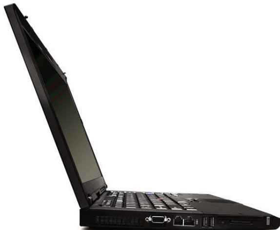
Lenovo ThinkPad T400