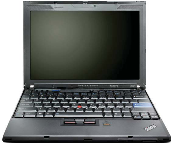
Lenovo® ThinkPad X201 (TrackPoint model)