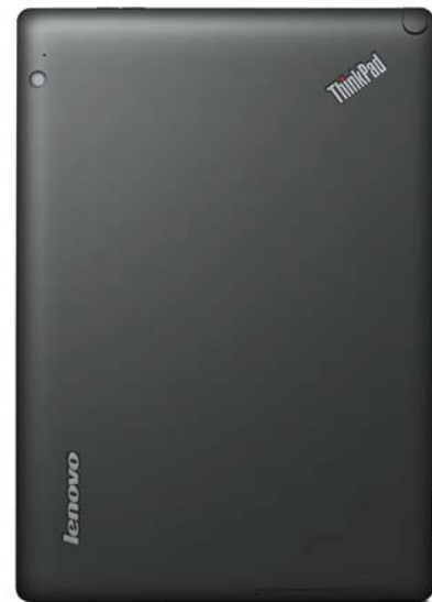
Lenovo ThinkPad Tablet