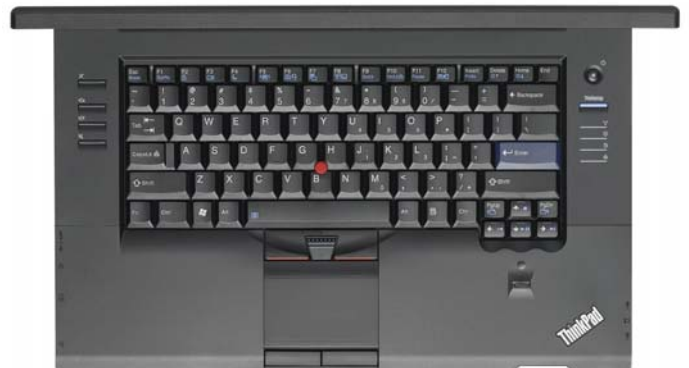
Lenovo ThinkPad L520