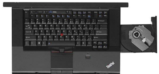
Lenovo ThinkPad T510