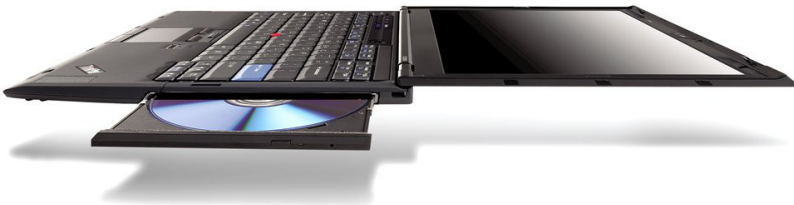
Lenovo ThinkPad X301