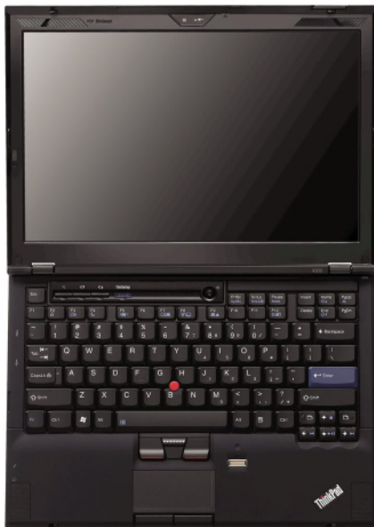
Lenovo ThinkPad X301