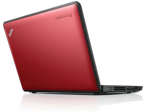
Lenovo ThinkPad X130e