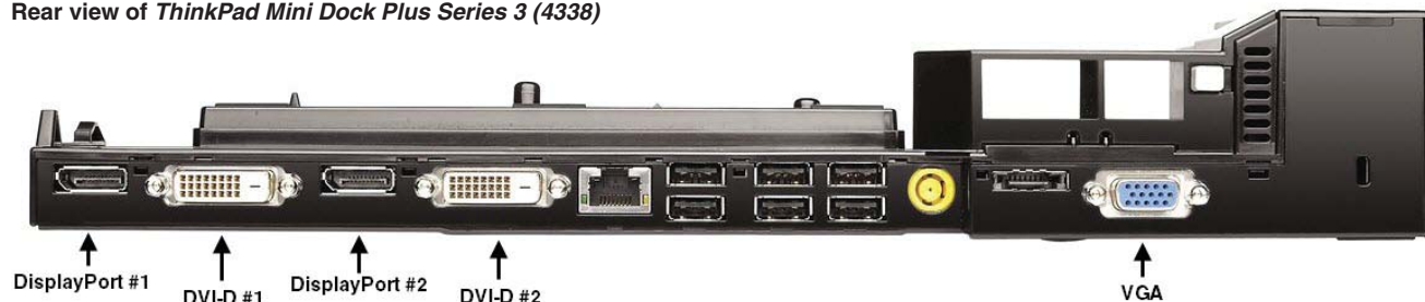
Rear view of ThinkPad Mini Dock Plus Series 3 (4338)

ThinkPad Mini Dock Plus Series 3 - 90W 433810U ThinkPad Mini Dock Plus Series 3 - 170W 433830U