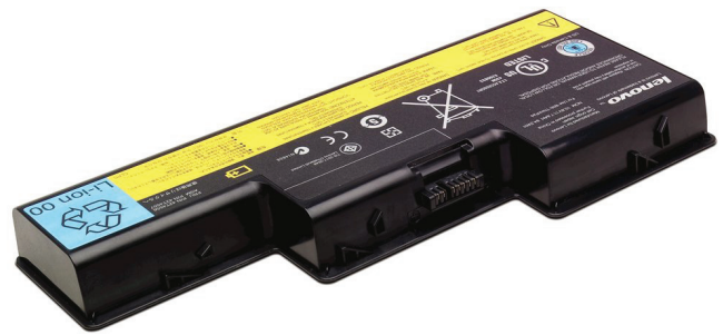
ThinkPad Battery 37++ (9-cell) 45J7914