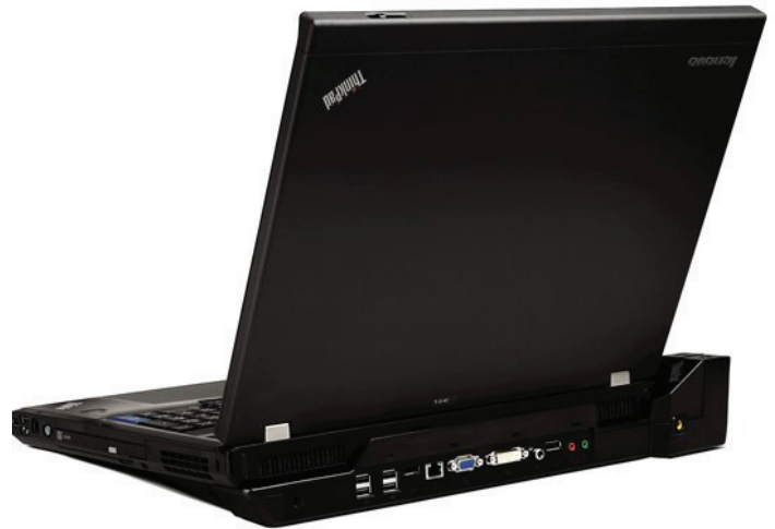
Lenovo ThinkPad W700 with ThinkPad W700 Mini Dock 2.0 57Y4345