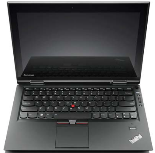
Lenovo ThinkPad X1