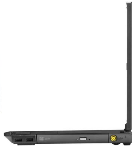
Lenovo ThinkPad L420