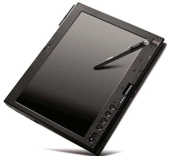
Lenovo ThinkPad X200 Tablet