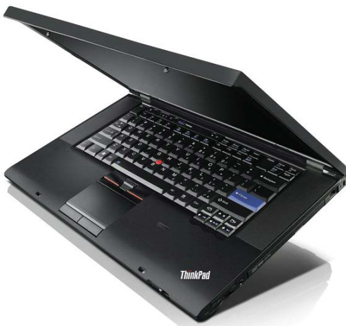
Lenovo ThinkPad W510