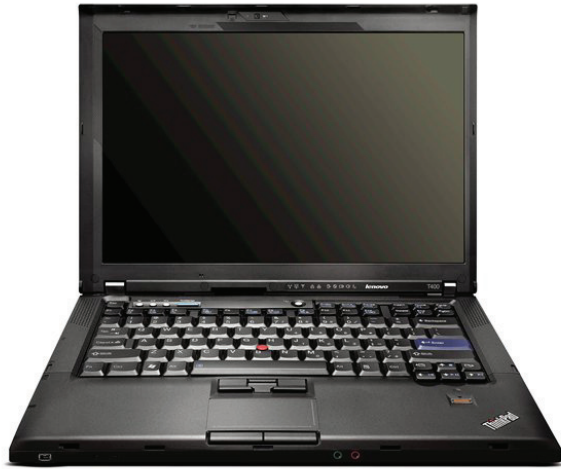
Lenovo® ThinkPad T400