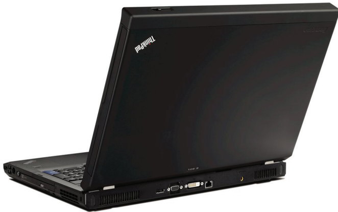
Lenovo® ThinkPad W700ds