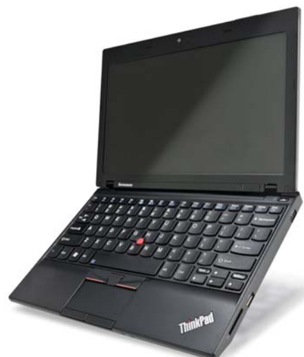
Lenovo ThinkPad X120e