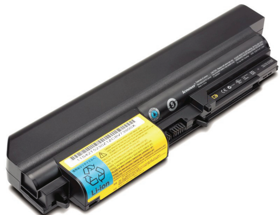
ThinkPad Battery 33++ (9-cell) 43R2499