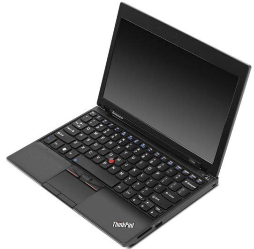
Lenovo ThinkPad X100e