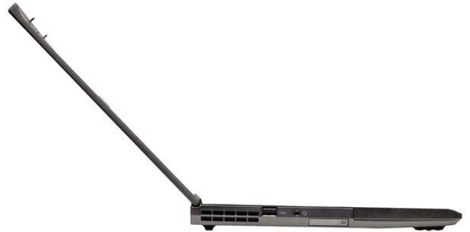
Lenovo ThinkPad T410s