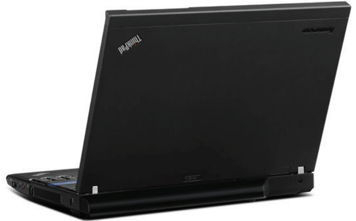
Lenovo ThinkPad X201s