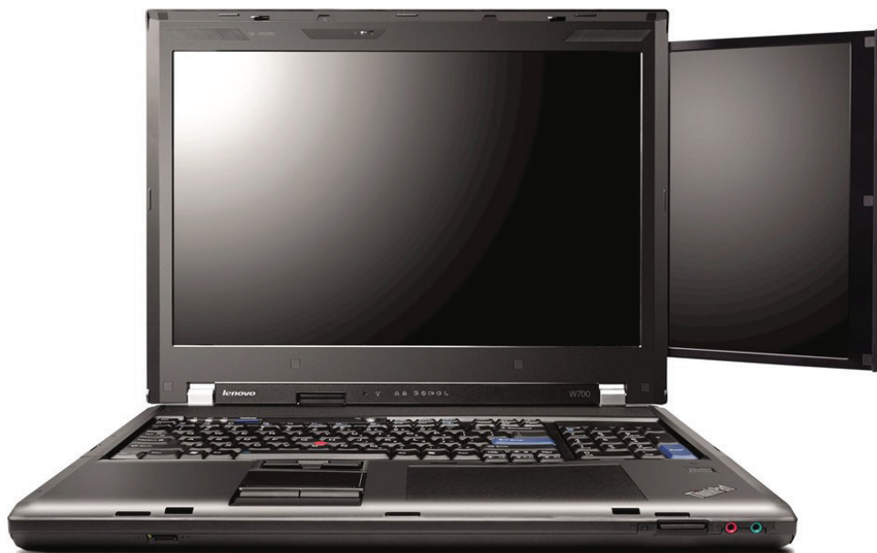
Lenovo ThinkPad W700ds