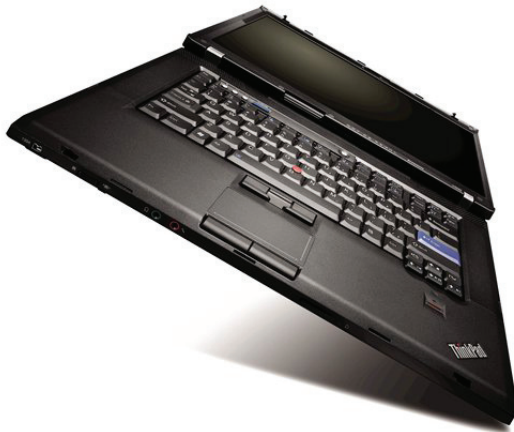
Lenovo ThinkPad W500