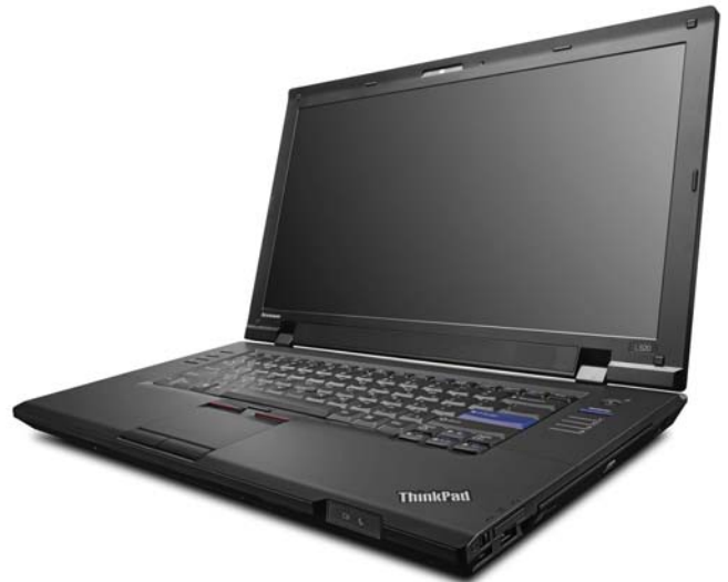
Lenovo ThinkPad L520