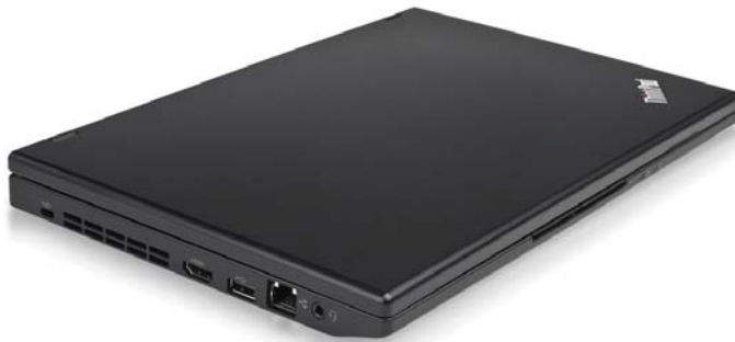
Lenovo ThinkPad X120e