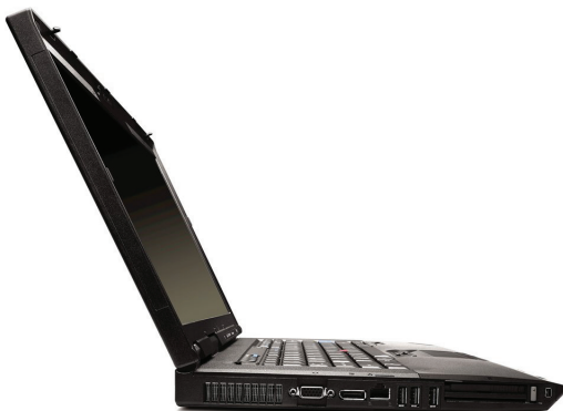
Lenovo ThinkPad R500