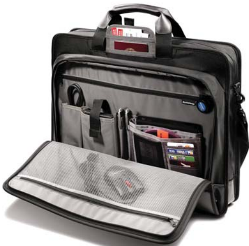
ThinkPad 17W Business Topload Case 43R9117