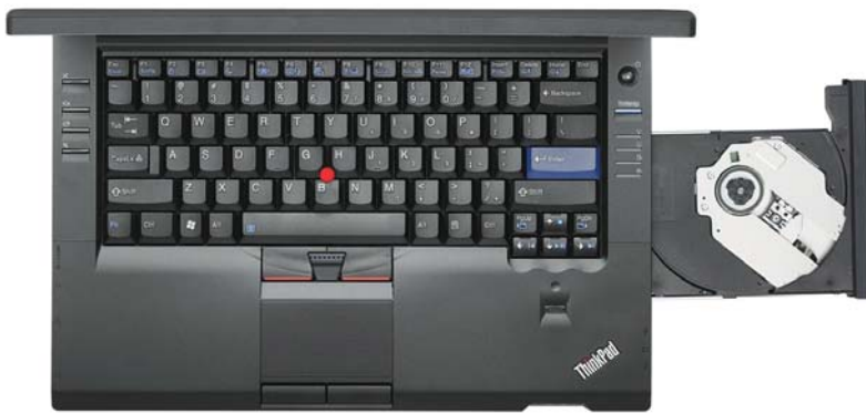
Lenovo ThinkPad L420