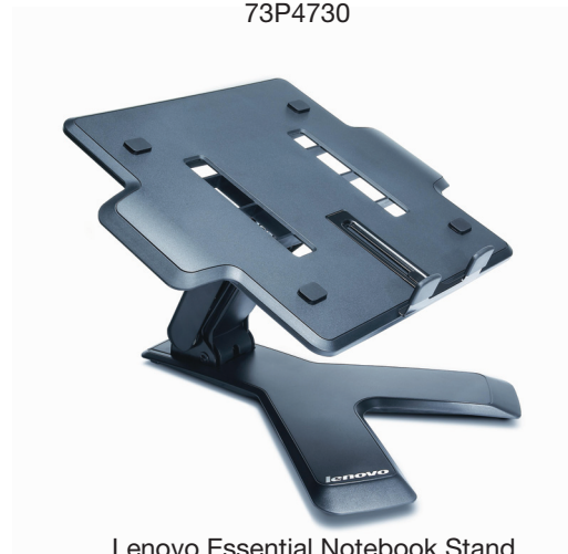
Lenovo Essential Notebook Stand 45J9292