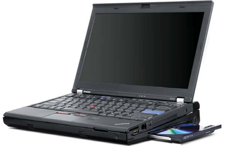
Lenovo ThinkPad X220 with ThinkPad Ultrabase Series 3 0A33932