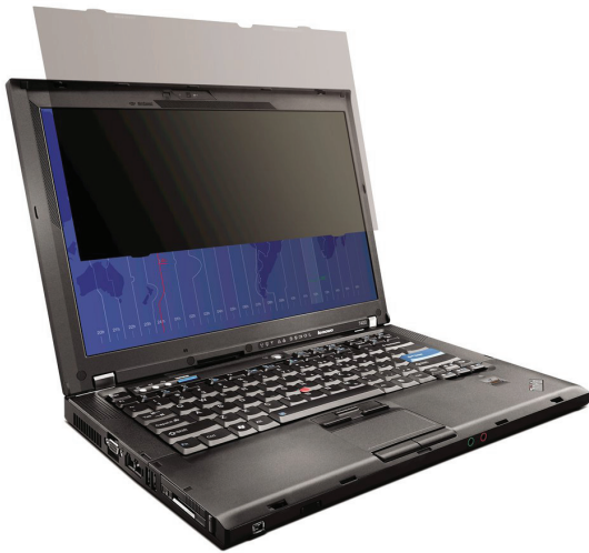
Lenovo ThinkPad T400 with ThinkPad T400/T410/R400 Privacy Filter 43R2472