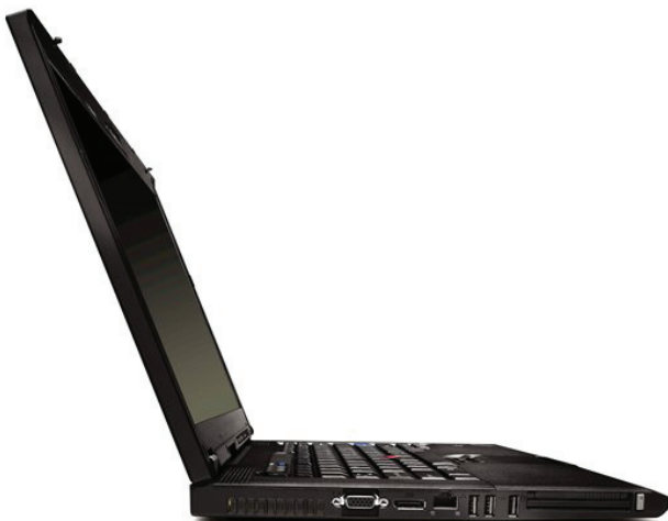
Lenovo ThinkPad W500