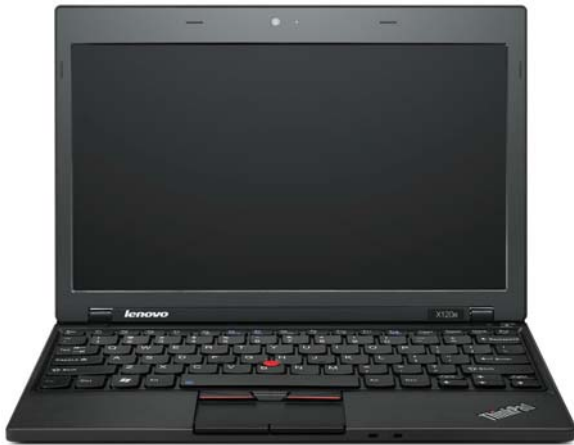
Lenovo® ThinkPad X120e