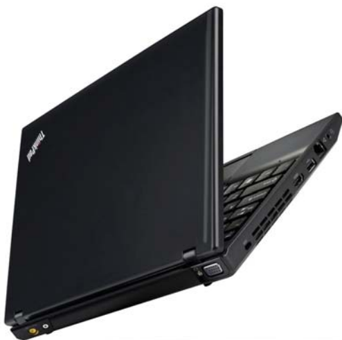
Lenovo ThinkPad X120e