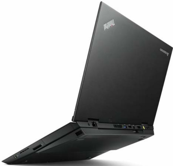
Lenovo® ThinkPad X1 with ThinkPad Battery 39+ (6-cell slice) 0A36279