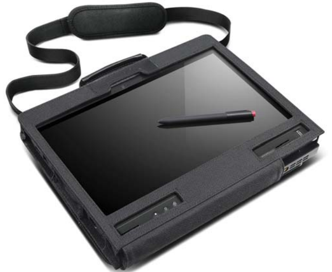
Lenovo ThinkPad X220 Tablet