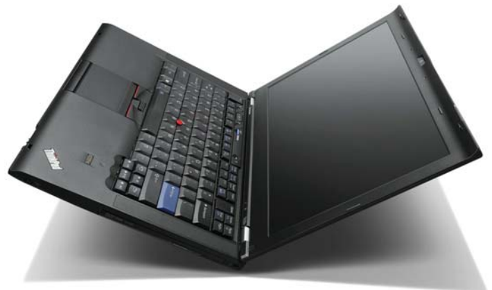
Lenovo ThinkPad T420s