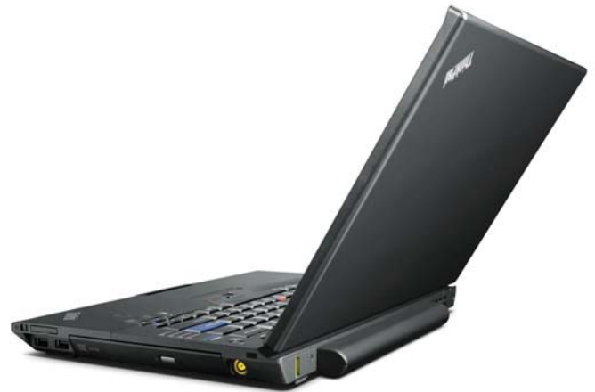
Lenovo ThinkPad L412 with ThinkPad Battery 55++ (9-cell) 57Y4186