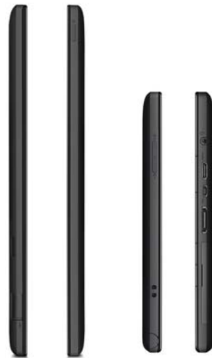
Lenovo ThinkPad Tablet