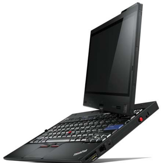
Lenovo ThinkPad X220 Tablet