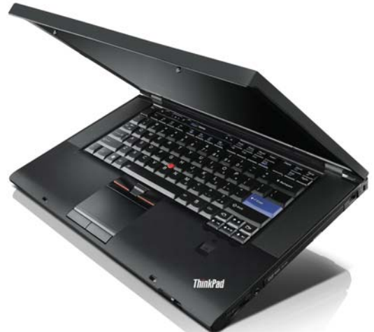
Lenovo ThinkPad T520