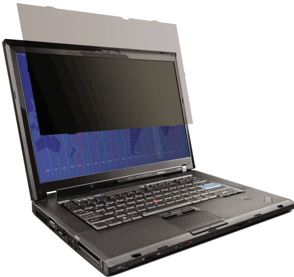
Lenovo ThinkPad T500 with T500/R500/W500 Series 15W Privacy Filter 43R2474