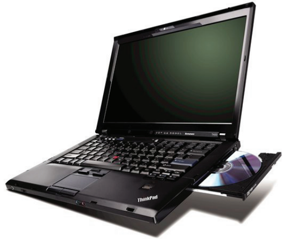
Lenovo ThinkPad T400