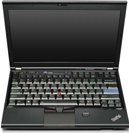
Lenovo® ThinkPad X220