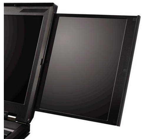
Lenovo ThinkPad W700ds