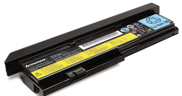
ThinkPad Battery 47++ (9-cell) 43R9255