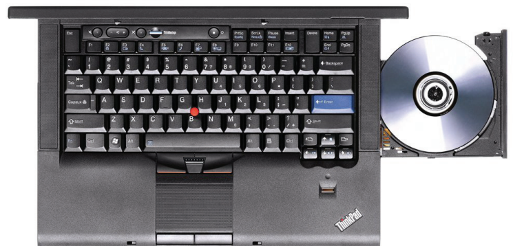
Lenovo ThinkPad T400s