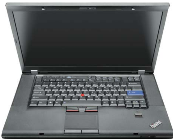
Lenovo ThinkPad W520