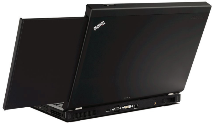
Lenovo ThinkPad W700ds