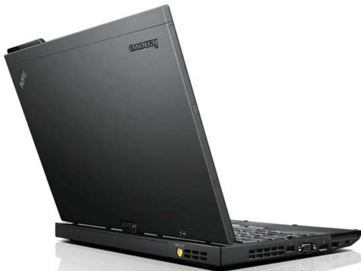
Lenovo ThinkPad X220 Tablet