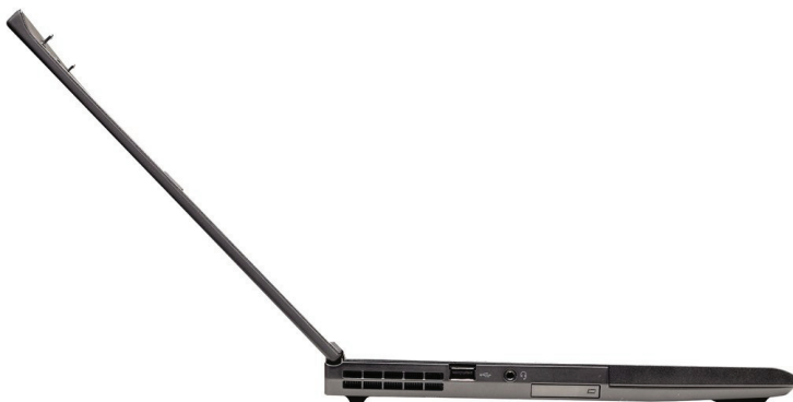
Lenovo ThinkPad T400s