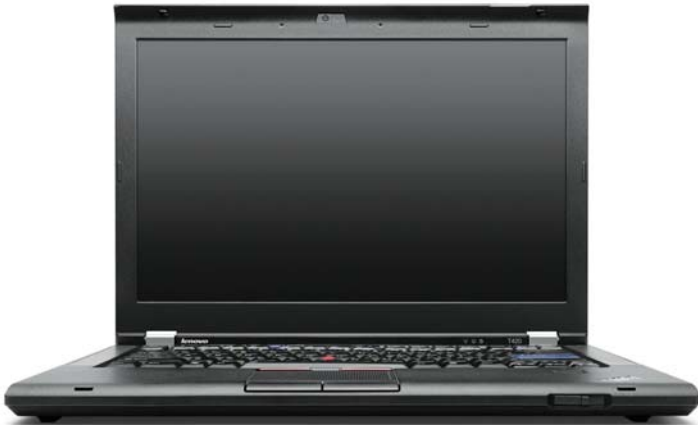
Lenovo® ThinkPad T420