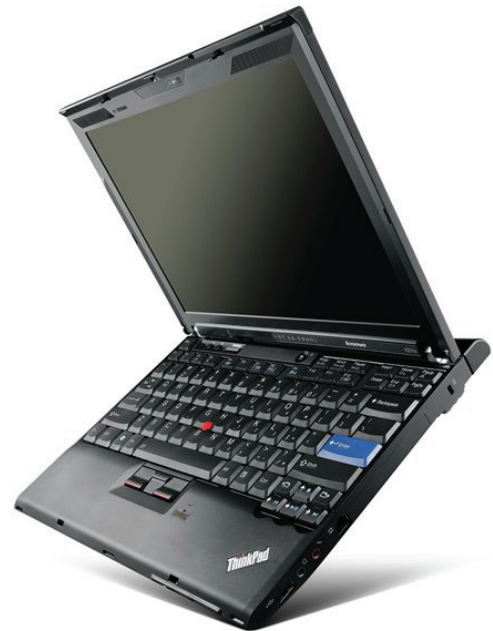
Lenovo ThinkPad X201s (TrackPoint model)