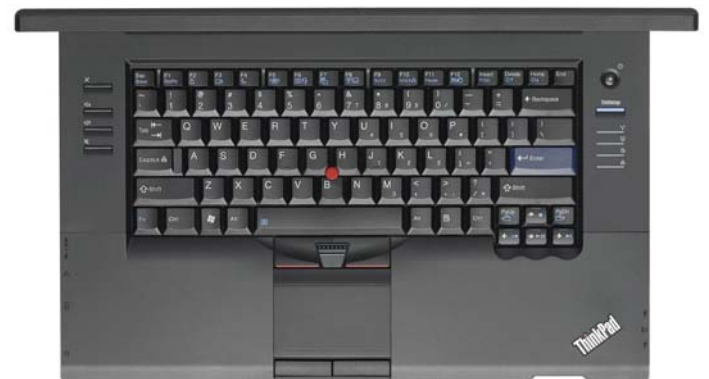
Lenovo ThinkPad L512