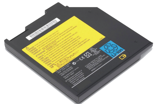
ThinkPad Battery 42 (3-cell, bay) 57Y4536