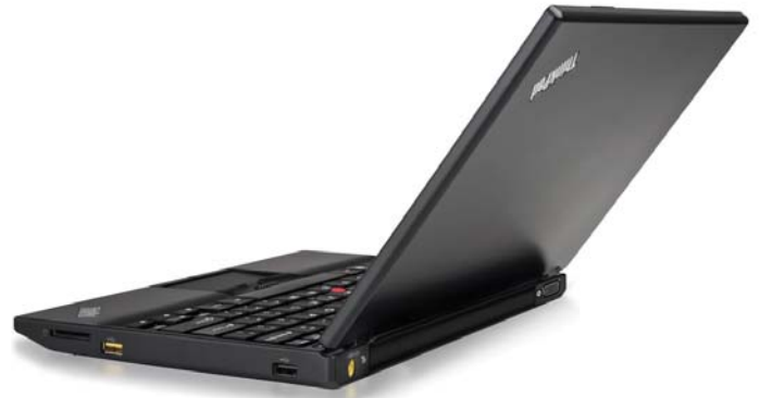
Lenovo ThinkPad X120e