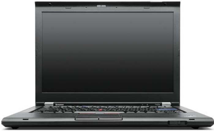
Lenovo® ThinkPad T420s