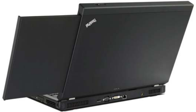
Lenovo ThinkPad W701ds