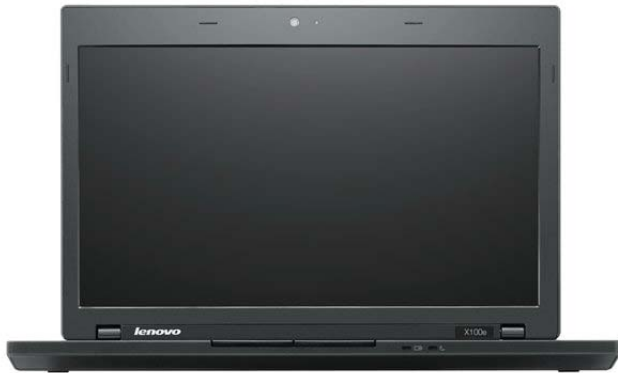
Lenovo® ThinkPad X100e