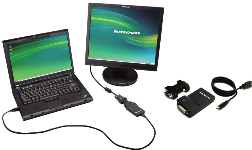
Lenovo USB-to-DVI Monitor Adapter 45K5296