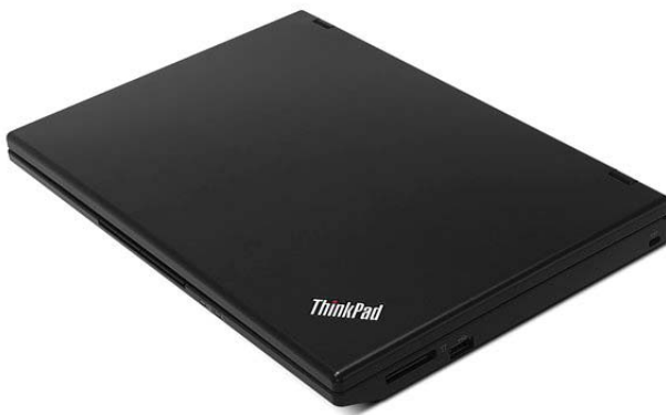
Lenovo ThinkPad X100e