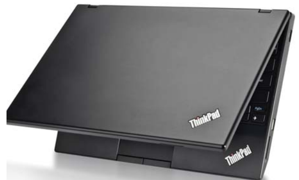
Lenovo ThinkPad X120e