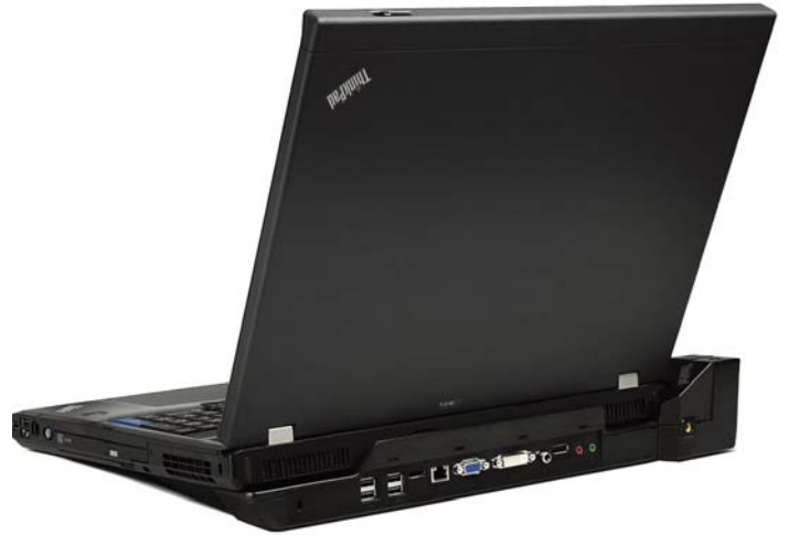
Lenovo ThinkPad W701 with ThinkPad W700 Mini Dock 2.0 57Y4345