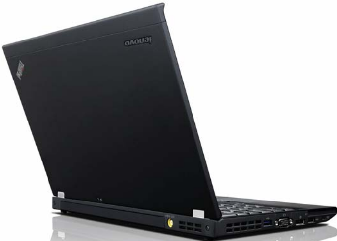
Lenovo ThinkPad X220