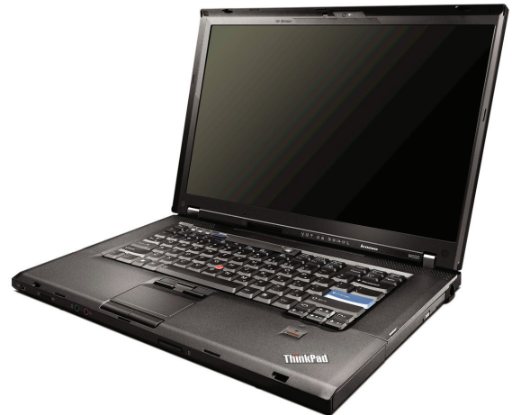
Lenovo ThinkPad W500