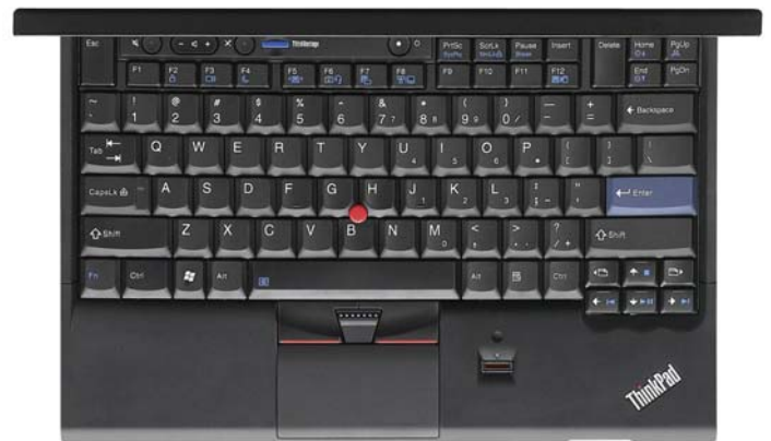
Lenovo ThinkPad X220