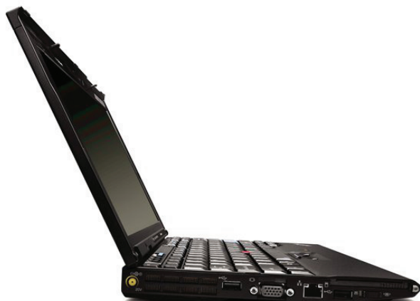
Lenovo ThinkPad X200s