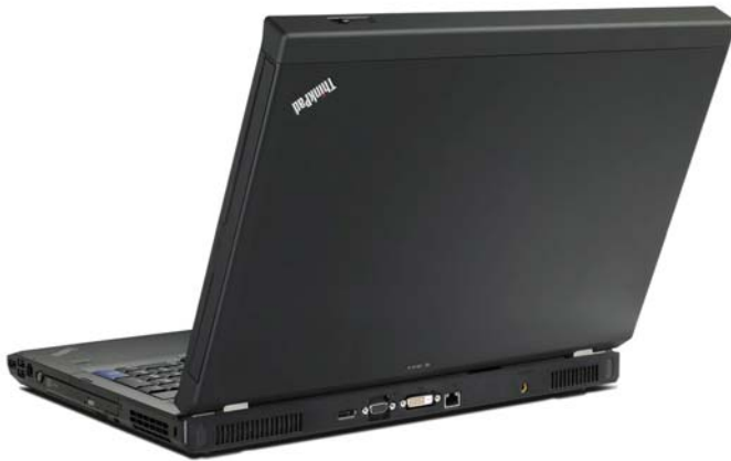
Lenovo® ThinkPad W701ds