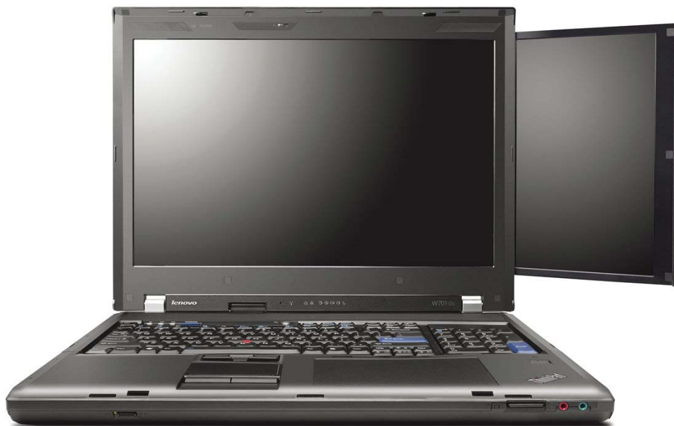
Lenovo ThinkPad W701ds