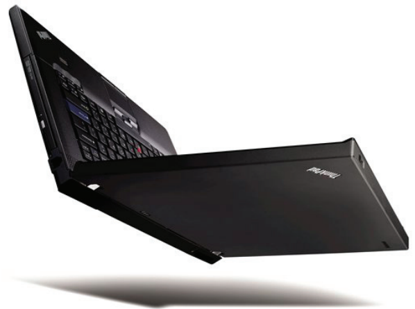
Lenovo ThinkPad W500