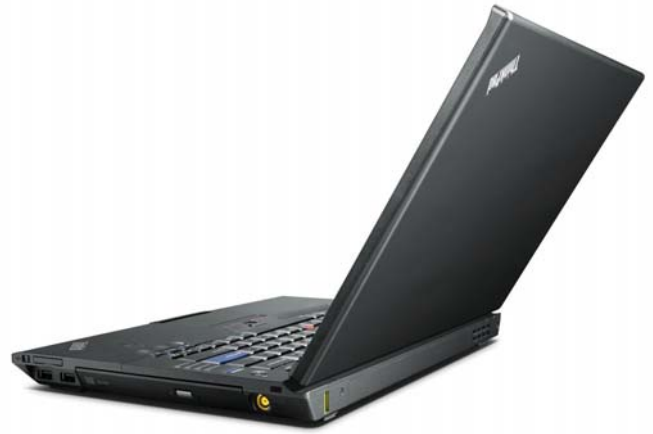
Lenovo ThinkPad L420