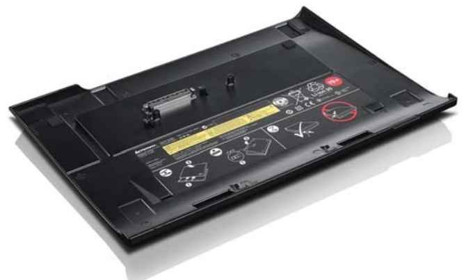
Lenovo ThinkPad Battery 19+ (6-cell, Slim External) 0A36280