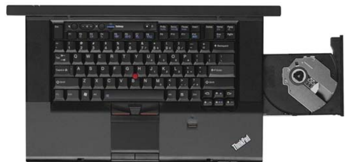
Lenovo ThinkPad T520