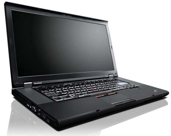
Lenovo ThinkPad W510