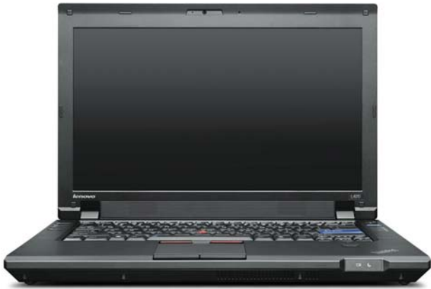
Lenovo® ThinkPad L420