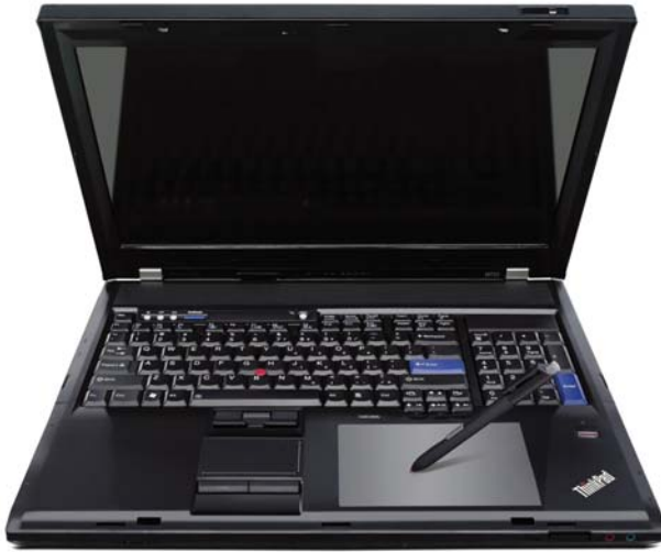
Lenovo® ThinkPad W701