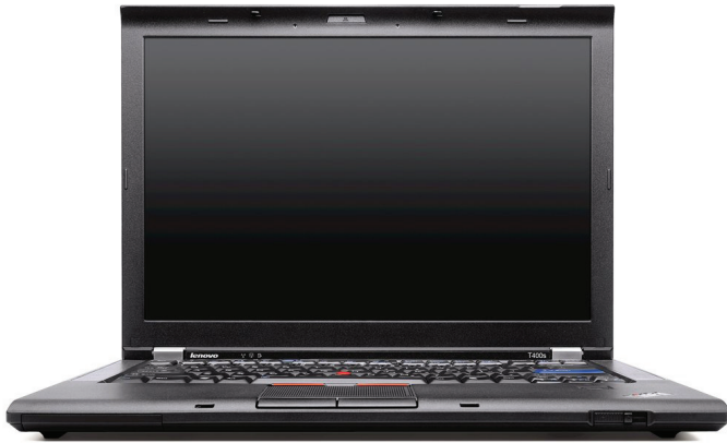
Lenovo® ThinkPad T400s