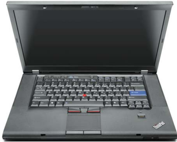
Lenovo® ThinkPad T520