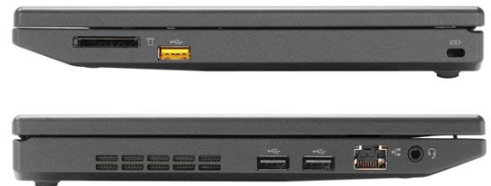
Lenovo ThinkPad X100e with 3-cell battery