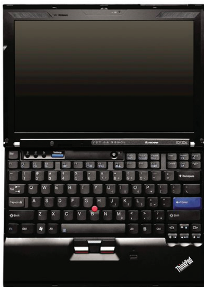
Lenovo ThinkPad X200s