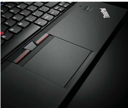
Lenovo ThinkPad X1