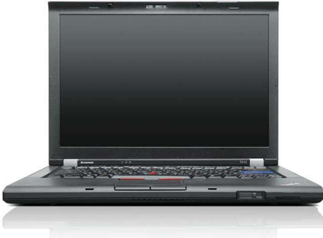
Lenovo® ThinkPad T410