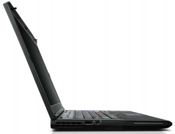
Lenovo ThinkPad T420s