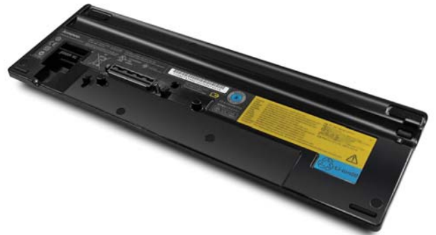
ThinkPad Battery 27+++ (9-cell, slice) 57Y4545