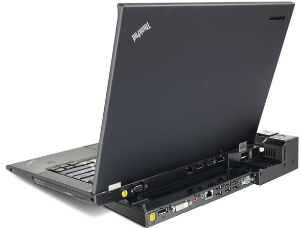
Lenovo ThinkPad T400s with ThinkPad Mini Dock Series 3 433710U