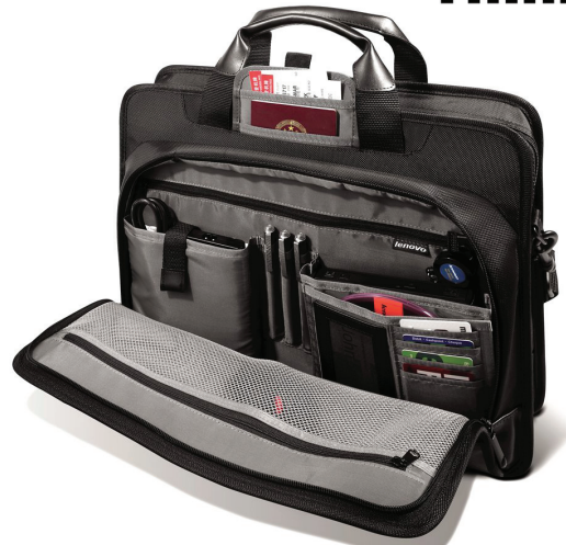
ThinkPad Business Topload Case 43R2476