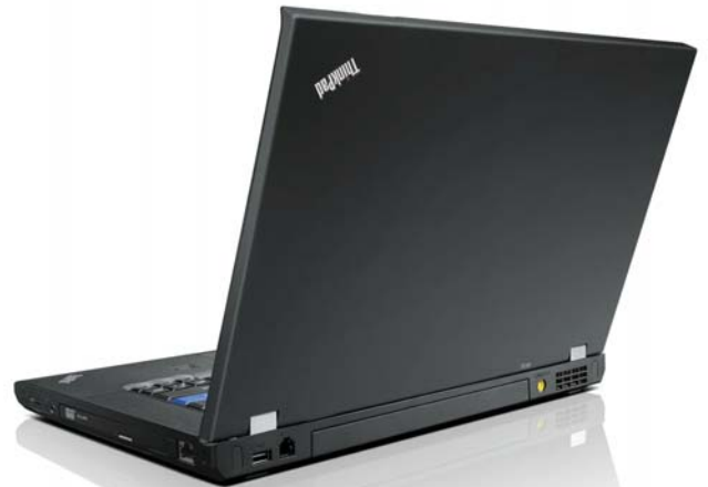
Lenovo ThinkPad W520