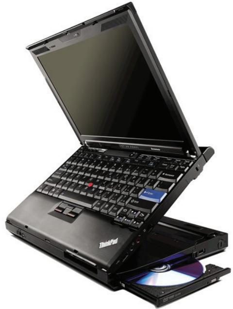
Lenovo ThinkPad X200 with ThinkPad X200 UltraBase 43R8781