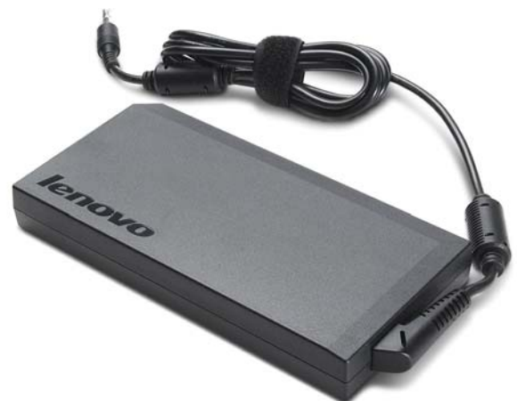
ThinkPad 230W AC Adapter 55Y9333