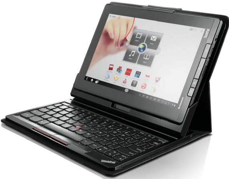
Lenovo® ThinkPad Tablet with ThinkPad Tablet Keyboard Folio Case 0A36370