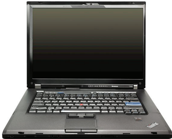
Lenovo® ThinkPad T500