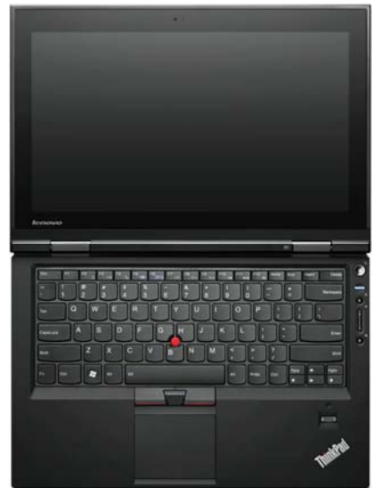
Lenovo ThinkPad X1