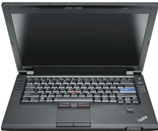
Lenovo ThinkPad L420