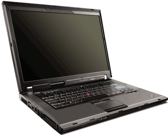
Lenovo® ThinkPad R500