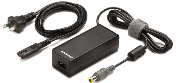
ThinkPad 65W AC Adapter 40Y7696