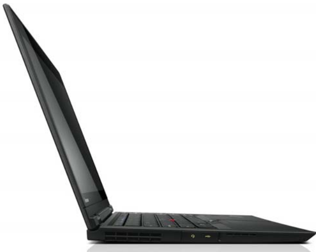
Lenovo ThinkPad X1