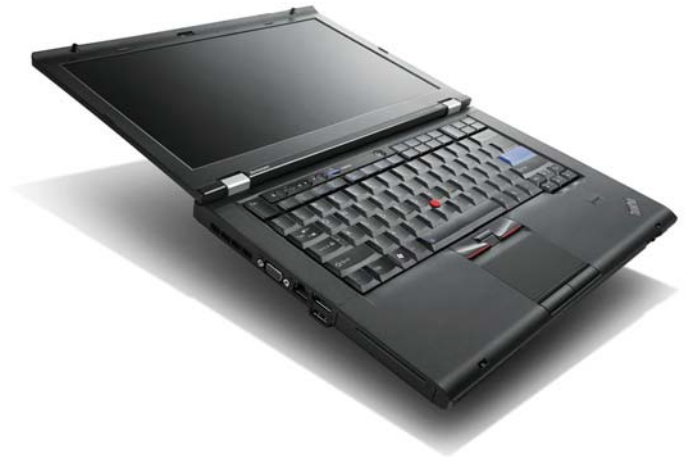
Lenovo ThinkPad T420