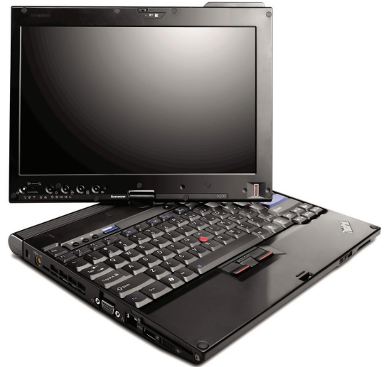
Lenovo ThinkPad X200 Tablet