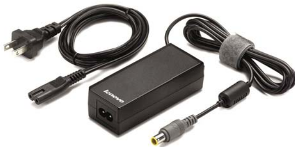
ThinkPad 65W AC Adapter 40Y7696