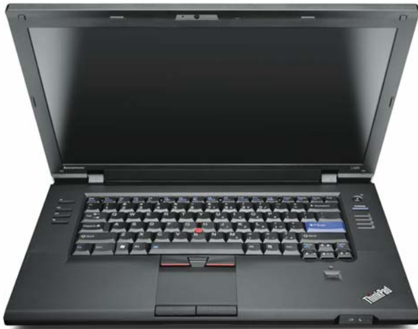
Lenovo® ThinkPad L520