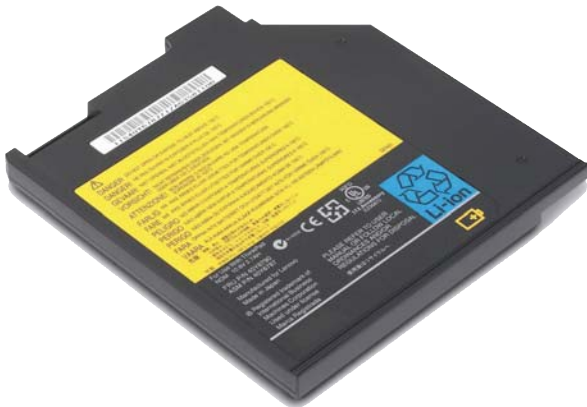
ThinkPad Battery 42 (3-cell, bay) 57Y4536