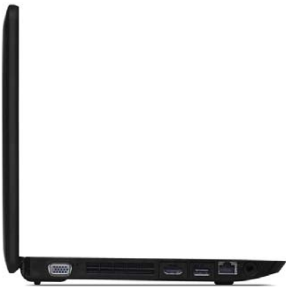
Lenovo ThinkPad X130e