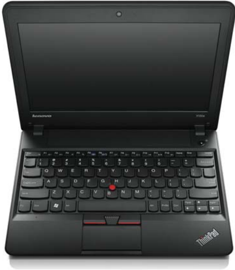
Lenovo® ThinkPad X130e