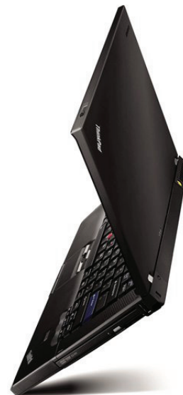
Lenovo ThinkPad T400