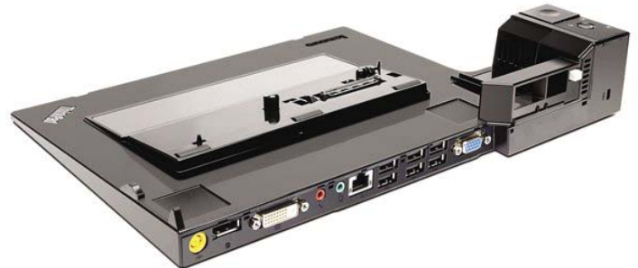
ThinkPad Mini Dock Series 3 - 90W 433710U