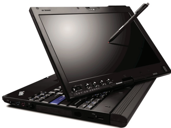
Lenovo ThinkPad X200 Tablet