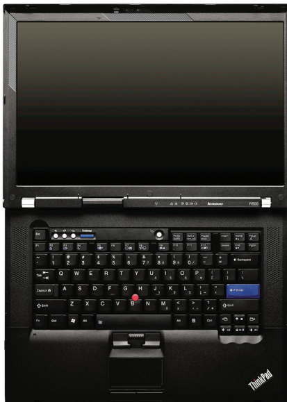
Lenovo ThinkPad R500