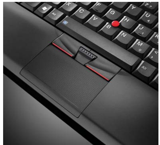
Lenovo ThinkPad X220