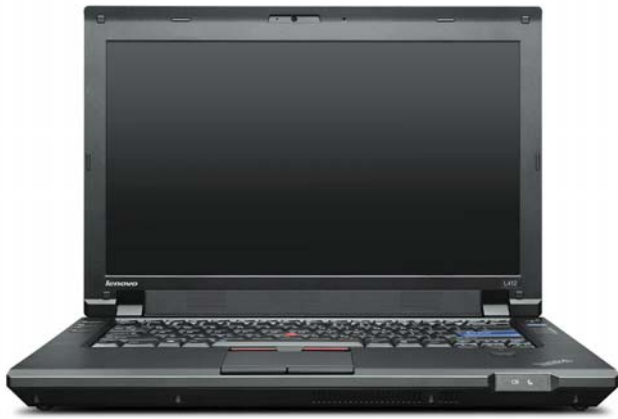
Lenovo® ThinkPad L412