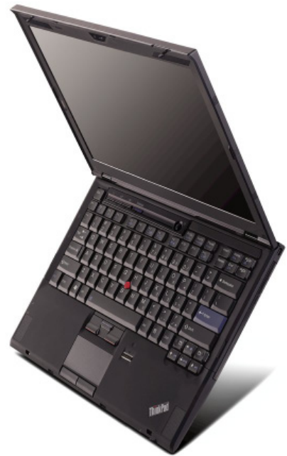
Lenovo ThinkPad X301