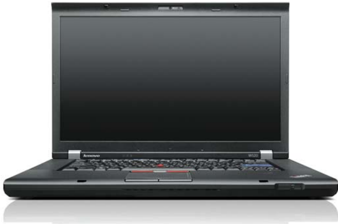
Lenovo® ThinkPad W520