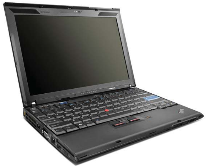
Lenovo ThinkPad X201 (TrackPoint model)