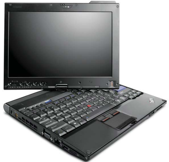
Lenovo ThinkPad X201 Tablet