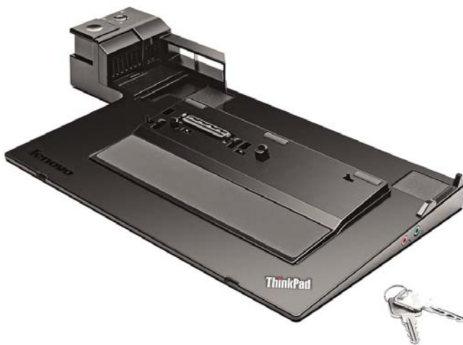
ThinkPad Mini Dock Plus Series 3 - 135W 433820U