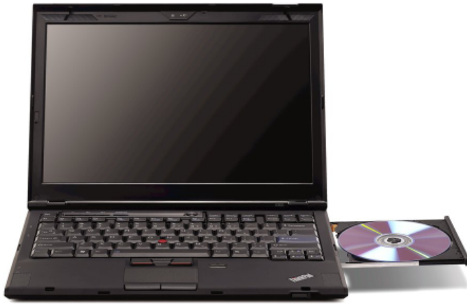
Lenovo® ThinkPad X301