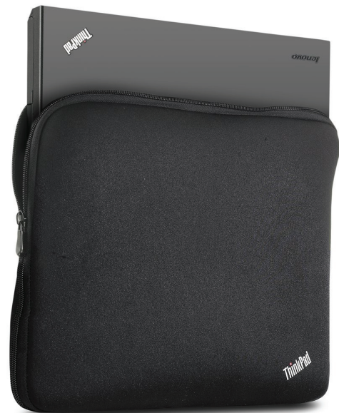
ThinkPad 12W Case Sleeve 51J0476