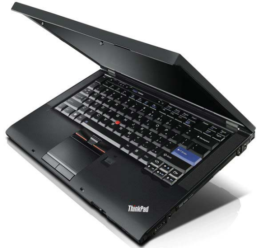
Lenovo ThinkPad T410