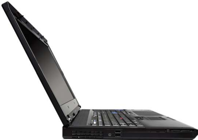
Lenovo ThinkPad W701