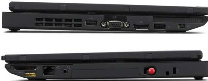
Lenovo ThinkPad X220 Tablet