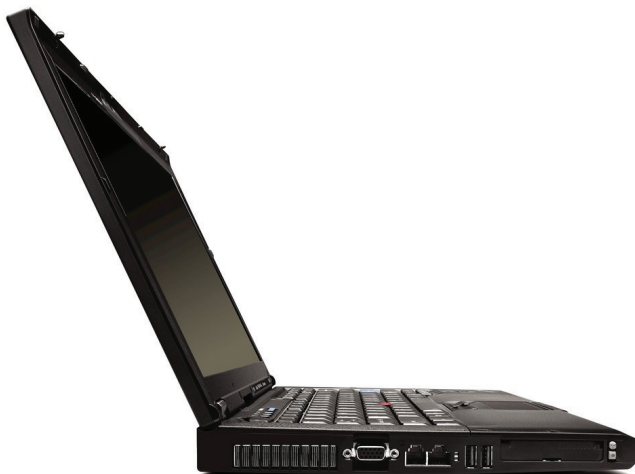
Lenovo ThinkPad R400