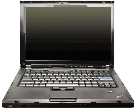
Lenovo® ThinkPad R400