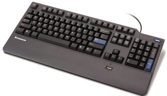
Lenovo USB Fingerprint Keyboard 73P4730