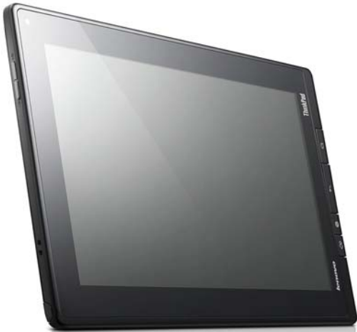
Lenovo® ThinkPad Tablet