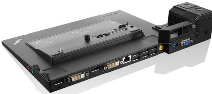
ThinkPad Mini Dock Plus Series 3 with USB 3.0 - 90W 433815U