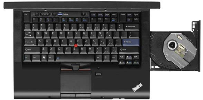
Lenovo ThinkPad T410