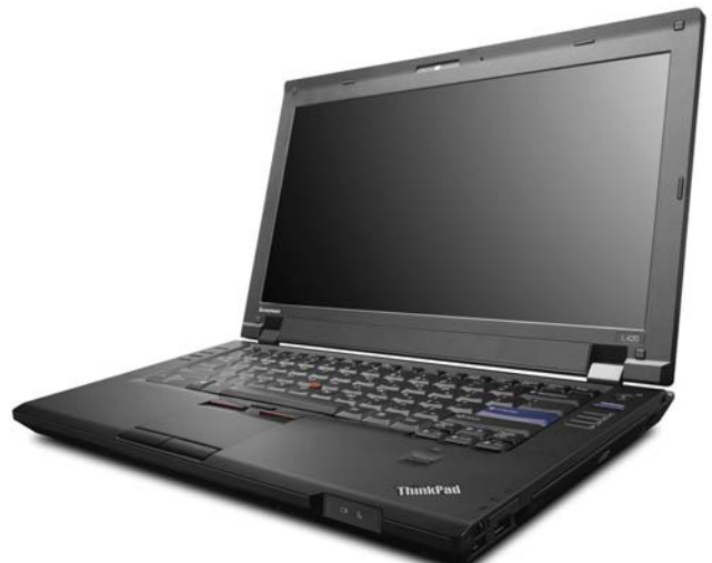
Lenovo ThinkPad L420