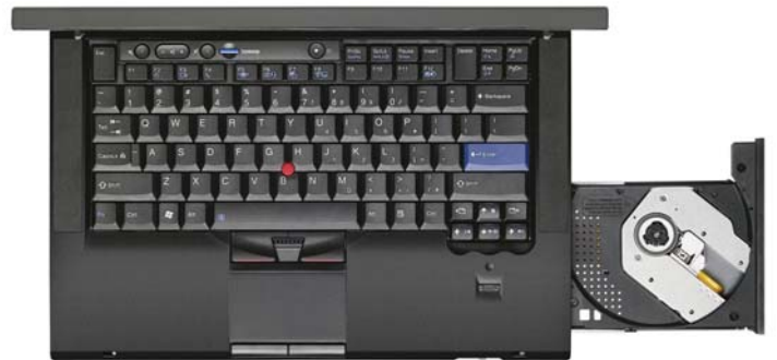
Lenovo ThinkPad T420