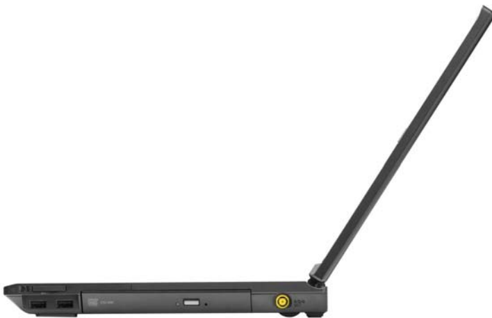
Lenovo ThinkPad L520