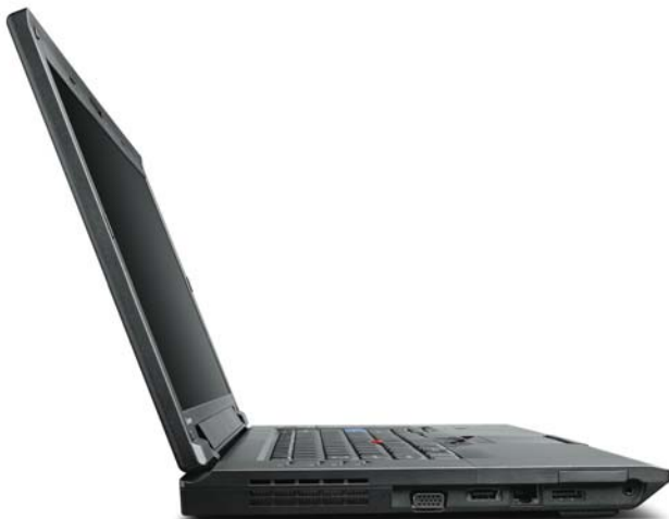
Lenovo ThinkPad L520