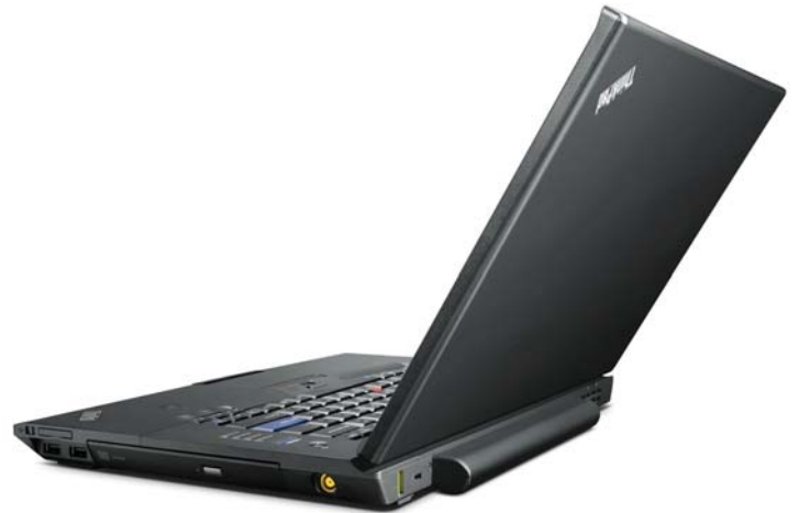
Lenovo ThinkPad L512 with ThinkPad Battery 55++ (9-cell) 57Y4186