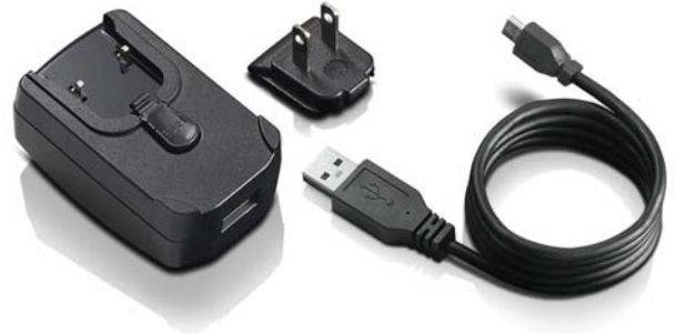
ThinkPad Tablet AC Charger 0A36248