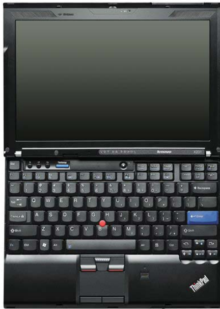
Lenovo ThinkPad X201 (UltraNav model)