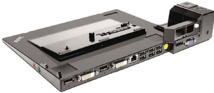
ThinkPad Mini Dock Plus Series 3 - 90W 433810U