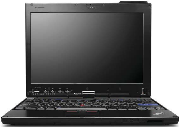
Lenovo® ThinkPad X201 Tablet