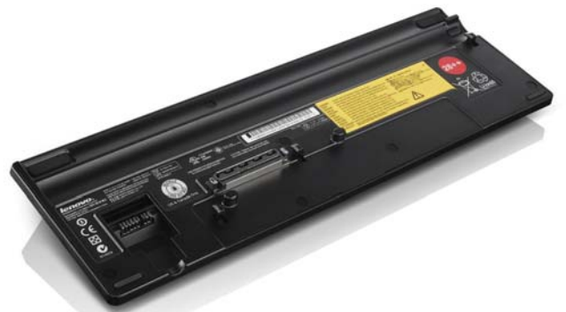
ThinkPad Battery 28++ (9-cell, slice) 0A36304