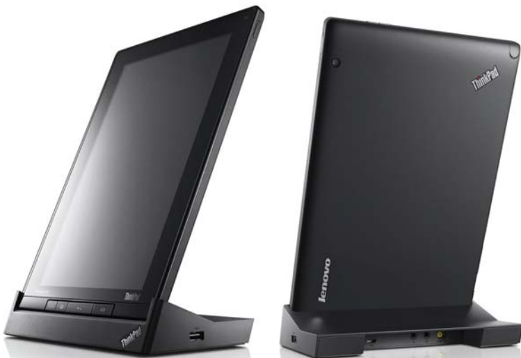
Lenovo ThinkPad Tablet with ThinkPad Tablet Dock 0A33953