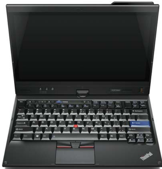
Lenovo® ThinkPad X220 Tablet