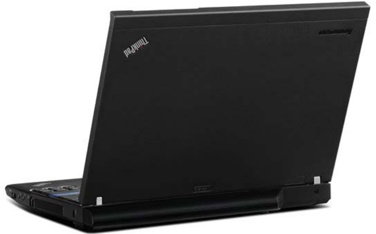
Lenovo ThinkPad X201 with ThinkPad Battery 47++ (9-cell) 43R9255