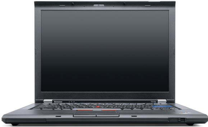
Lenovo® ThinkPad T410s