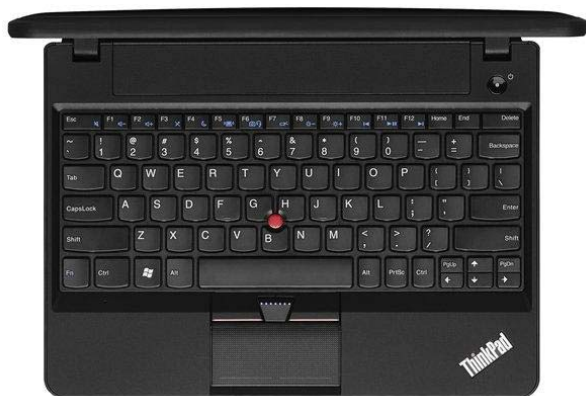
Lenovo ThinkPad X130e