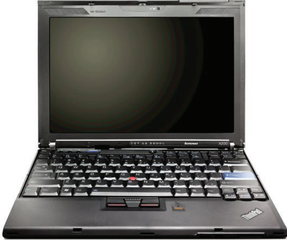
Lenovo® ThinkPad X200