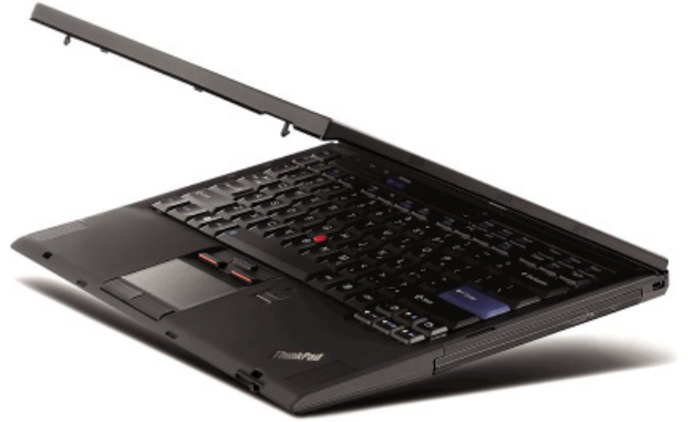
Lenovo ThinkPad X301