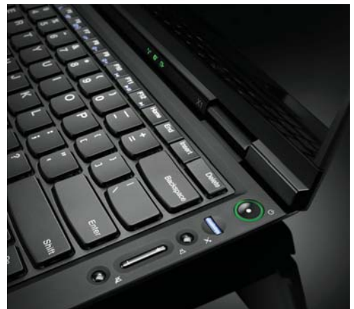
Lenovo ThinkPad X1