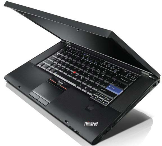
Lenovo ThinkPad T510