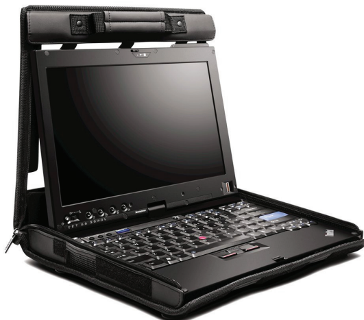
Lenovo ThinkPad X200 Tablet with ThinkPad X200 Tablet Sleeve 43R9115