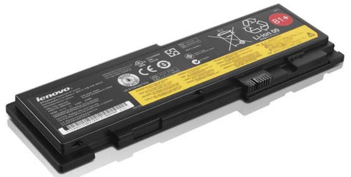
ThinkPad Battery 81+ (6-cell) 0A36309