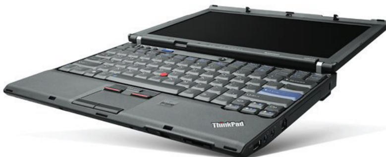
Lenovo ThinkPad X201s (UltraNav model)