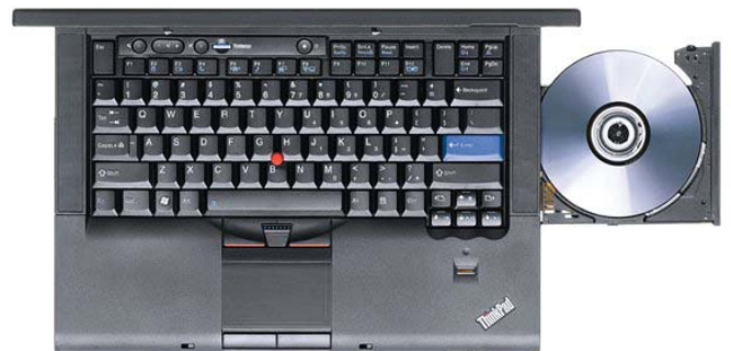
Lenovo ThinkPad T410s