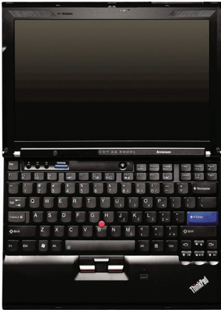
Lenovo ThinkPad X200