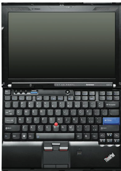
Lenovo ThinkPad X201s (UltraNav model)