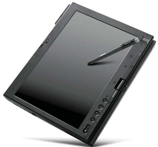
Lenovo ThinkPad X201 Tablet