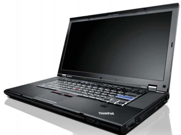
Lenovo ThinkPad W520