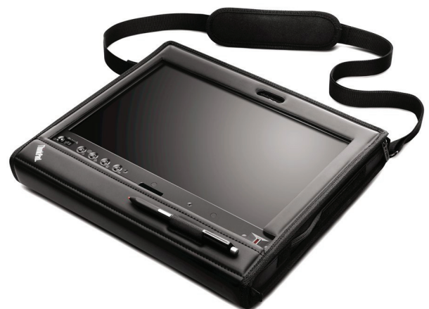
Lenovo ThinkPad X200 Tablet with ThinkPad X200 Tablet Sleeve 43R9115