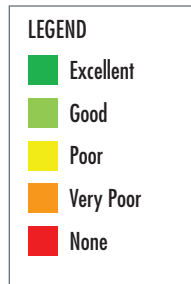
Figure 1: Sample Signal Strength Measurements of a Floor, at 2.4 GHz