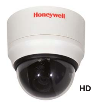
H3W1F1X shown with mounting ring for surface mount