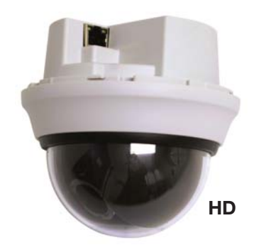
H3W1F1X shown without mounting ring for flush mount