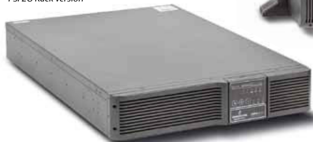
PSI 2U Rack version