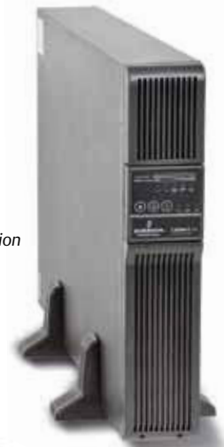
PSI 2U Tower version