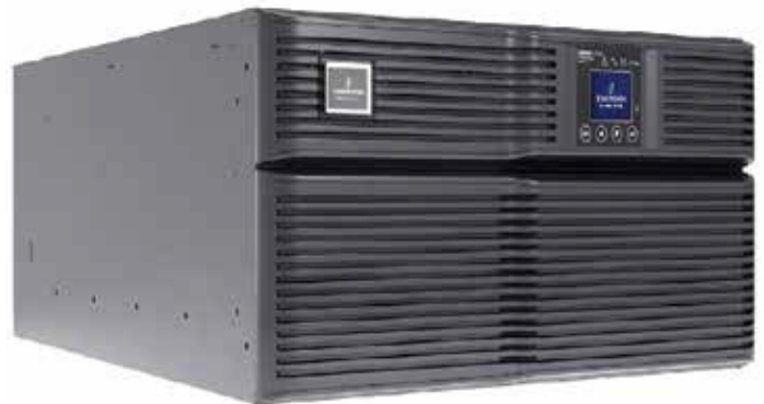
Liebert® GXT4™ 5 - 10 kVA