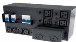
Front view Power Distribution (PD2-CE10HDWRMBS)