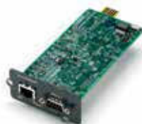
Liebert® IntelliSlot® Communication Card