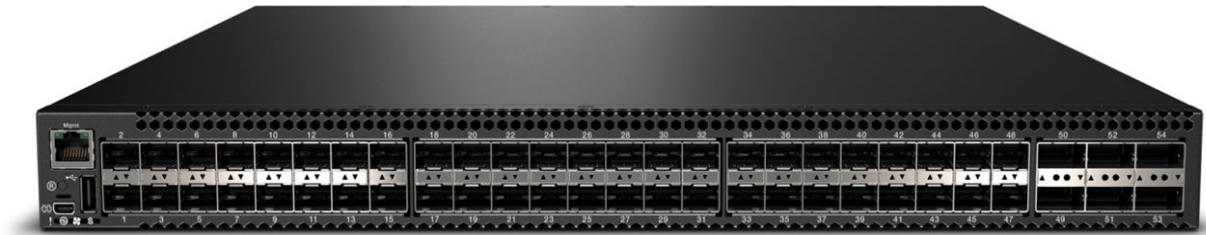
Figure 1. Lenovo RackSwitch G8272

The RackSwitch G8272 is shown in the following figure.