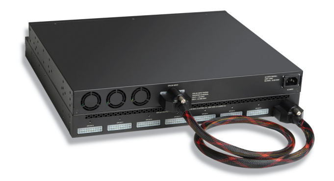
Figure 4: Rear view of the Brocade ICX-EPS 4000 connectivity.