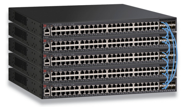
Figure 1: Up to 12 Brocade ICX 7250 Switches can be stacked together using up to four full-duplex SFP+ 10 Gbps ports for a fully redundant backplane with 480 Gbps of aggregated stacking bandwidth.

entire campus network. These powerful deployments deliver equivalent or better functionality than large, rigid modular chassis systems, but with significantly lower costs and smaller carbon footprints.