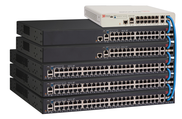
Figure 3: Up to eight Ruckus ICX 7150 switches can be stacked together into a single logical switch using standard SFP+ 10 Gbps ports and copper cables or optics.