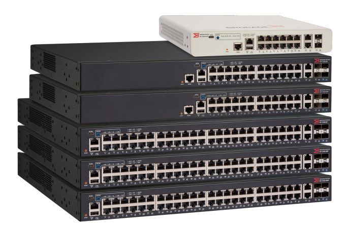
Figure 1: Ruckus ICX 7150 Switch models.

2×10/100/1000 Mbps uplink RJ-45 ports 4×1/10 GbE uplink/stacking SFP/SFP+ ports