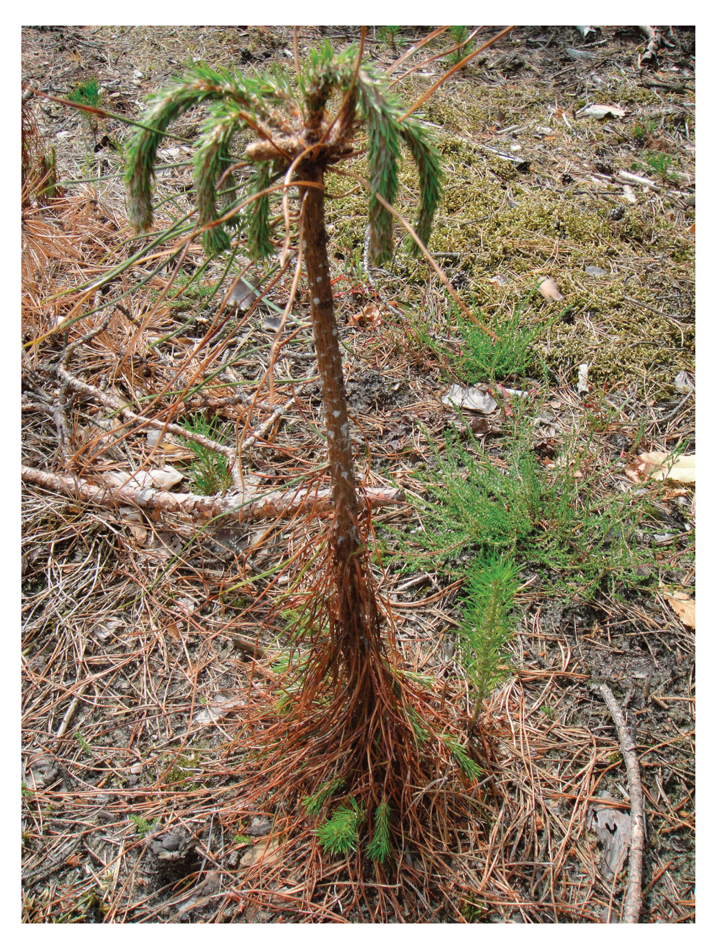
Photo 2. Pinus sylvestris seedling with the characteristic symptoms of the colonization by Pissodes castaneus: leaks of resin on a stem, hanging top shoots.