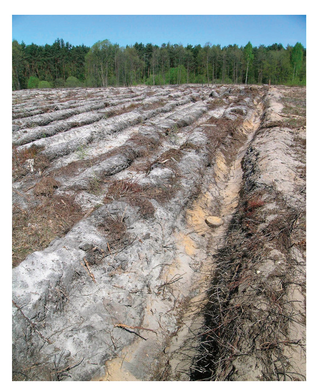
Photo 6. Plantation surrounded by groove with slice of pine wood to collect pest beetles.

captured nontarget insects belonged to the family Carabidae, which entered the traps accidentally or on the search for shelter. Beetles from the families Dermestidae, Geotrupidae, and Silphidae that feed on dead insects were probably attracted by the smell of decomposing insects inside the traps. Removal of stumps from the clear-cuts can reduce populations of