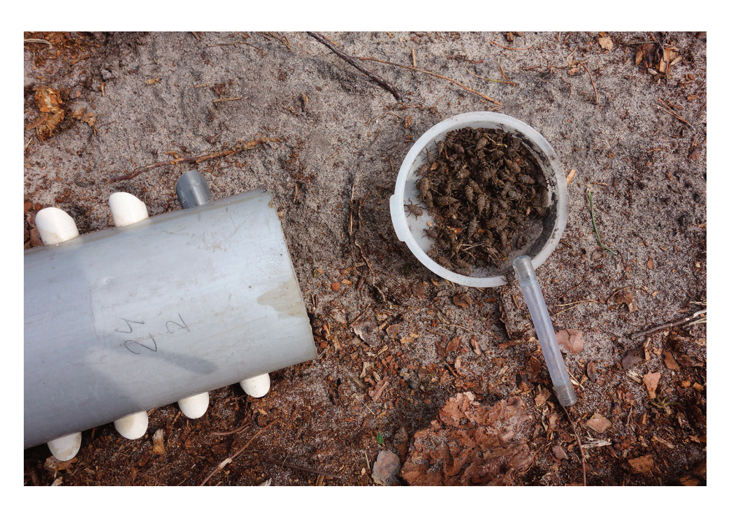
Photo 5. Hylobius abietis beetles collected by IBL-4 trap, visible dispenser in the form of tube filled with synthetic attractant.