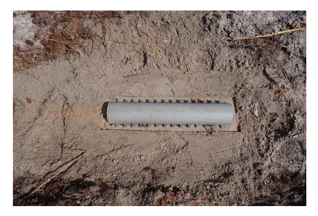
Photo 4. IBL-4 trap used for collection of Hylobius abietis beetles.

of the threat depends on the age of the trees and is critical for 3–10-year-old forests, when the number of eggs reaches, respectively, 50–1,500 per tree. Evaluation of threats by Tortricidea spp. is based on the estimation of the number of pine buds or higher shoots damaged by larvae. It is generally carried out from May 15 to June 15 and consists of the observations of 30 trees growing on the edge and 30 trees growing in the center of the forest. Critical damage is defined as damage of at least 30% of buds or shoots. A complementary method of Rh. buoliana observation involves the counting of butterflies attracted by pheromone traps installed before the start of swarming in the second half of June ( Table 2 ).