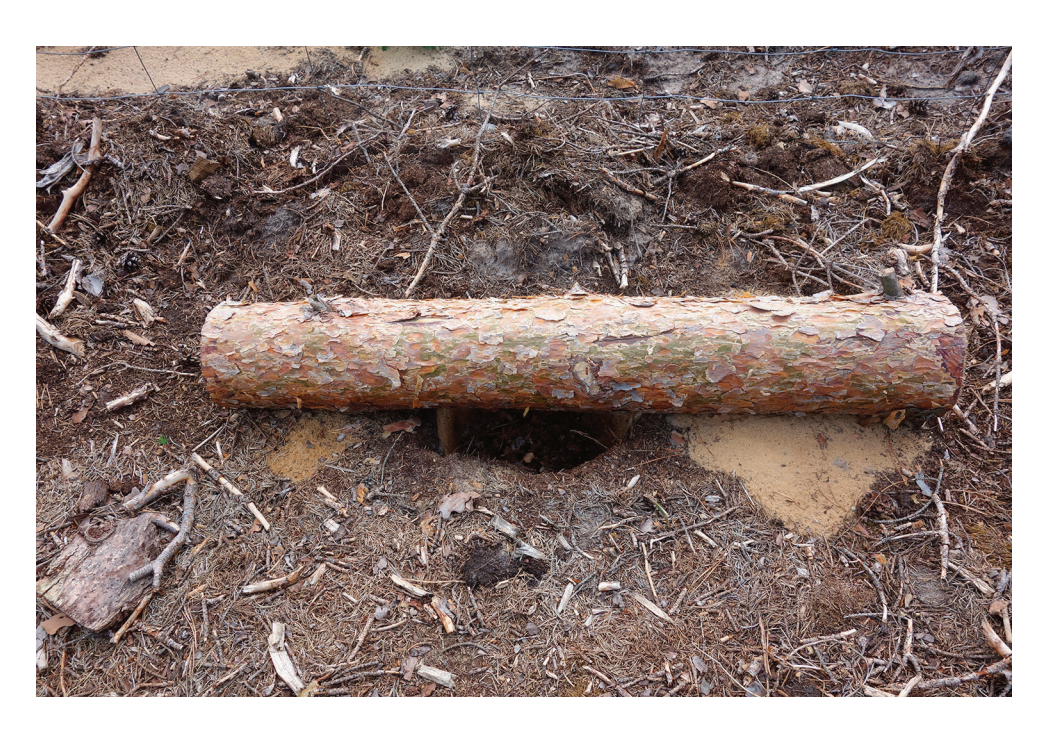
Photo 3. Pinus sylvestris billet used for protection of reforestations; under the trap there is a hole to collect Hylobius abietis beetles.

Evaluation of the number of P. castaneus and the level of damage to P. sylvestris plantations and thickets is performed on the basis of the number of trees colonized by the pest on areas of its occurrence in the previous years and in young forests weakened by biotic (fungi, insects, deer) and abiotic (drought, hail, fire) factors. The observations are performed every two to three weeks from mid-May to the end of September.