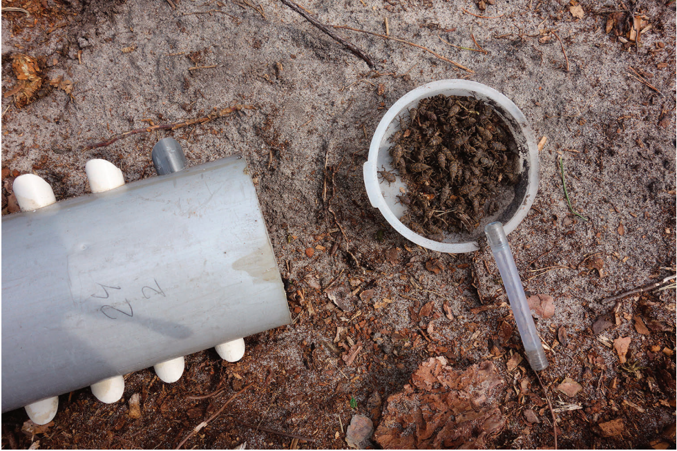
Photo 5. Hylobius abietis beetles collected by IBL-4 trap, visible dispenser in the form of tube filled with synthetic attractant.