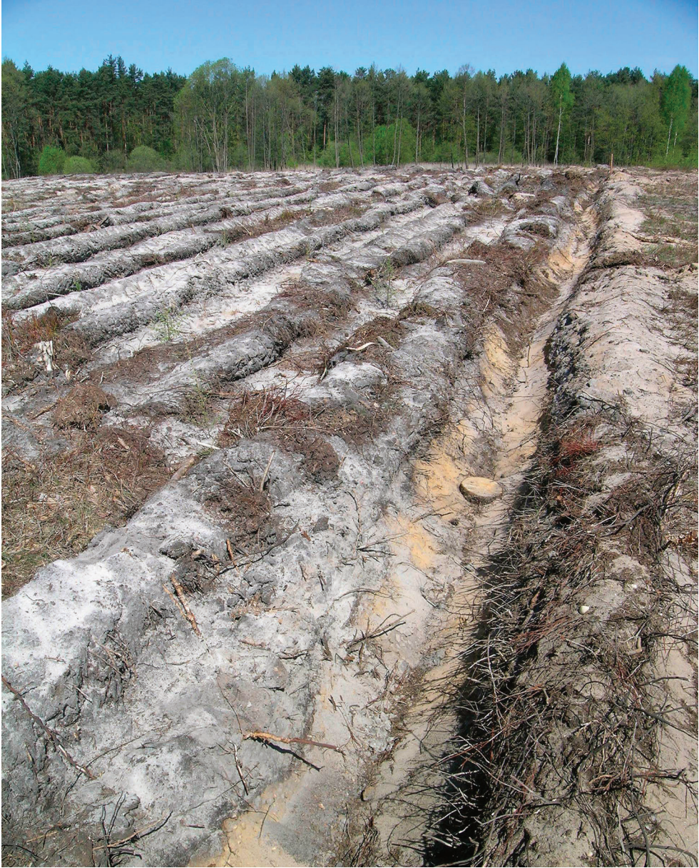
Photo 6. Plantation surrounded by groove with slice of pine wood to collect pest beetles.

captured nontarget insects belonged to the family Carabidae, which entered the traps accidentally or on the search for shelter. Beetles from the families Dermestidae, Geotrupidae, and Silphidae that feed on dead insects were probably attracted by the smell of decomposing insects inside the traps. Removal of stumps from the clear-cuts can reduce populations of