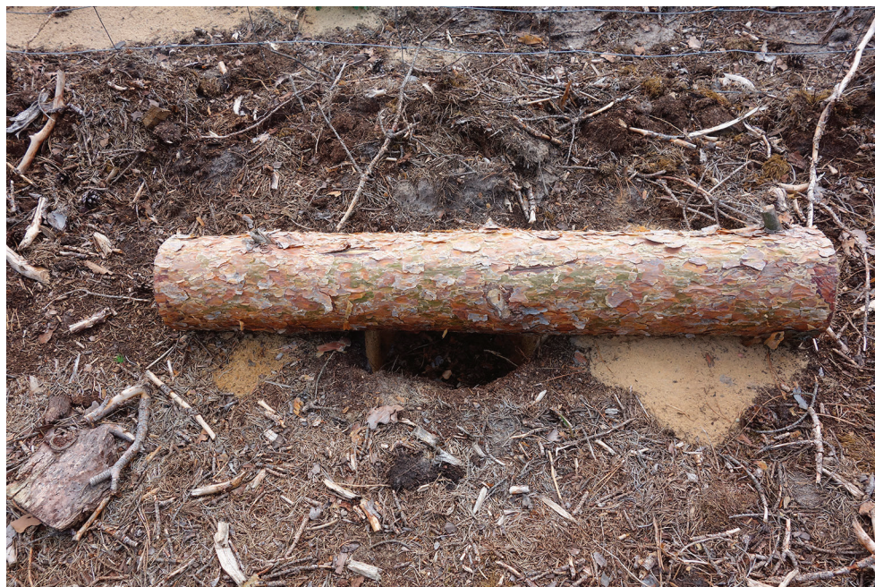
Photo 3. Pinus sylvestris billet used for protection of reforestations; under the trap there is a hole to collect Hylobius abietis beetles.

Evaluation of the number of P. castaneus and the level of damage to P. sylvestris plantations and thickets is performed on the basis of the number of trees colonized by the pest on areas of its occurrence in the previous years and in young forests weakened by biotic (fungi, insects, deer) and abiotic (drought, hail, fire) factors. The observations are performed every two to three weeks from mid-May to the end of September.