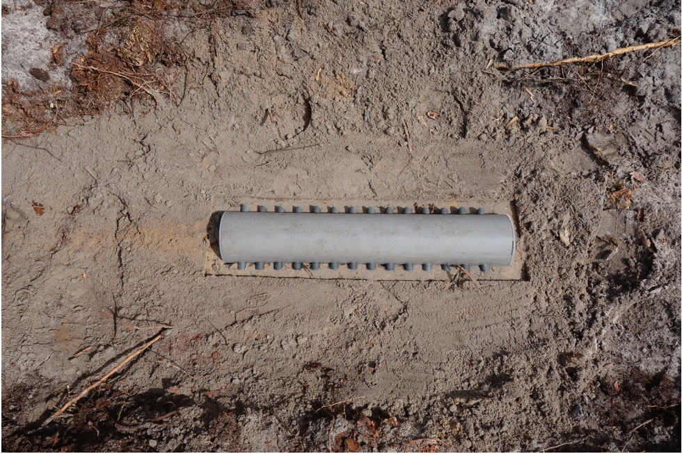
Photo 4. IBL-4 trap used for collection of Hylobius abietis beetles.

of the threat depends on the age of the trees and is critical for 3–10-year-old forests, when the number of eggs reaches, respectively, 50–1,500 per tree. Evaluation of threats by Tortricidea spp. is based on the estimation of the number of pine buds or higher shoots damaged by larvae. It is generally carried out from May 15 to June 15 and consists of the observations of 30 trees growing on the edge and 30 trees growing in the center of the forest. Critical damage is defined as damage of at least 30% of buds or shoots. A complementary method of Rh. buoliana observation involves the counting of butterflies attracted by pheromone traps installed before the start of swarming in the second half of June ( Table 2 ).