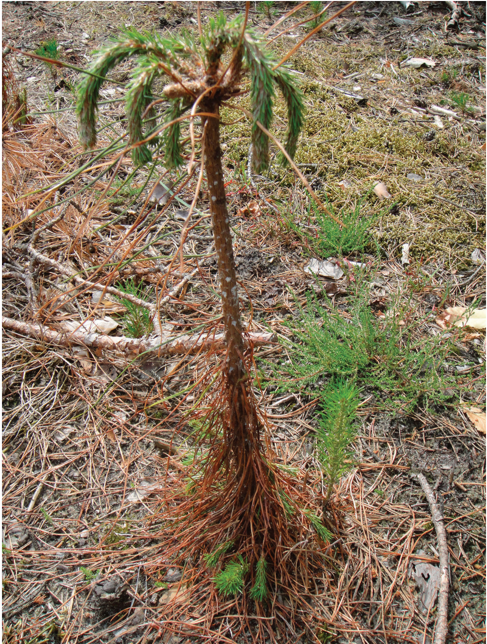
Photo 2. Pinus sylvestris seedling with the characteristic symptoms of the colonization by Pissodes castaneus : leaks of resin on a stem, hanging top shoots.