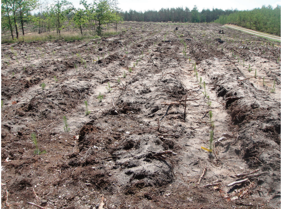
Photo 1. Typical Pinus sylvestris plantation in Poland.

Forests can be susceptible to insect attacks at all stages, and forest plantations newly established on clear-cuts left after harvesting of old stands facilitate the concentration of insects associated with specific stand ages ( Photo 1 ). In Poland, weevils (Coleoptera: Curculionidae) represent the most important group of pest insects of 1–5-year-old forest plantations established on clear-cuts [7–9]. The aim of this paper is to present the most important insect species damaging forest plantations and their management, including methods to estimate and reduce their numbers.