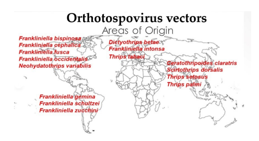
Figure 2. Geographical origins of Orthotospovirus vector species.

Before considering the pest status among the 1800 known species in this subfamily it is important to emphasise that less than 1% of these species are recorded as vectors of the serious crop diseases known as Orthotospoviruses [36]. With the exception of Neohydatothrips variabilis in the Sericothripinae, the other 14 species recorded as vectors of this group of plant viruses are all members of the Thripinae, and these species are members of five different genera (Figure 2). Eight vector species are members of the genus Frankliniella : three are members of the genus Thrips ; the remaining three are each placed in different unrelated genera. This suggests that the association between thrips and the various Orthotospovirus species has arisen independently several times and on different continents. Zhang et al. [36], in recognizing 30 species of Orthotospovirus stated that 17 of these are reported from China (including undescribed species). However, no known vector species is endemic to China, although Thrips palmi is possibly native in the tropical southwest of that country. In contrast, eight of the 15 thrips vector species are originally from the American continent, with five from North America, and three from South America (Figure 2).