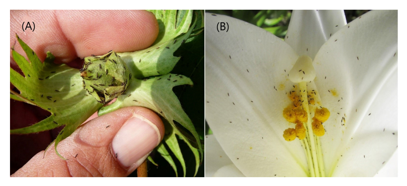
Figure 1. Aggregations of adult thrips. ( A ) Black Plague Thrips ( Haplothrips froggatti ) on cotton bud. ( B ) Thrips parvispinus on garden Lily flower.

The published literature about thrips commonly involves an assumption that any thrips found on a cultivated plant will be a pest. This assumption can occur even in the absence of any evidence of damage, let alone crop loss or economic impact. One example, also mentioned below, is the Black Plague thrips in Australia (Figure 1A) that disperses from its grass host plants as these dry in summer; vast numbers then land on irrigated crops where they do not breed. Mass flights also occur in Thrips australis , a species that breeds primarily in the flowers of Eucalyptus trees that commonly have mass-flowering periods. All of the flowers on a single tree thus die within a short period, and the adult thrips then disperse in very large numbers, seeking shelter in the flowers of many different surrounding plants but without breeding in them. This phenomenon of massed flights of adults occurs in other thrips species but again, it is not necessarily associated with any damage to the plants (Figure 1B).