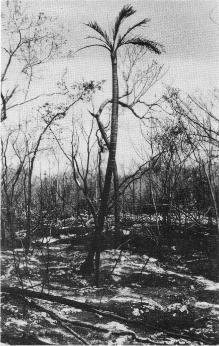
3. Pseudophoenix in the same locality as Fig. 2 after burning by man.