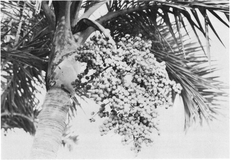
6. Close-up of the curved fruiting inflorescence.

Exostema caribaeum (Jacq.) R. & S. Gymnopodium floribundum Rolfe. Helicteres baruensis Jacq. Mimosa bahamensis Benth. Piscidia communis (Blake) Johnst. Pithecellobium guadalupense (Pers.) Chapm. Pithecellobium platylobum (Spreng.) Urban Randia aculeata L Thevetia thevetioides (H.B.K.) Schum. Torrubia linaribracteata (Heimerl.) Stand.