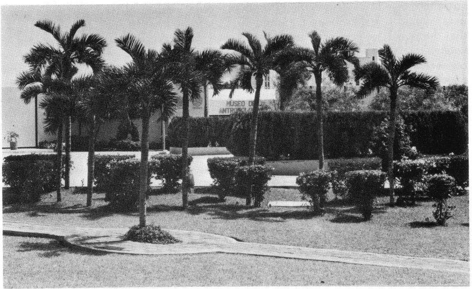
8. Pseudophoenix sargentii in cultivation at Cancun.

currents from Hispaniola to those places where the palm grows at present.