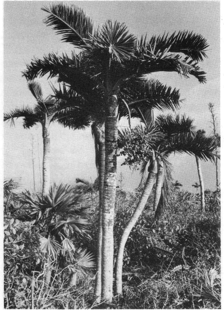
5. Pseudophoenix associated with Thrinax radiata , Metopium brownei and Agave angustifolia in El Cuyo region.

Coccoloba spicata Lundell Exostema mexicanum Gray Hippocratea excelsa H.B.K. Luehea speciosa Willd. Manilkara zapota (L) Royen Pimenta dioica (L) Merril Piscidia communis (Blake) Johnst. Pouteria campechiana (Kunth) Baehni Protium copal Engl. Sickingia salvadorensis Standl. Talisia olivaeformis (H.B.K.) Radlk. Zanthoxylum microcarpum Griseb.