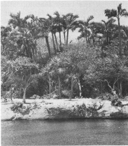
4. Pseudophoenix in Xel-ha; note Thrinax radiata at left and Coccothrinax readii at right.