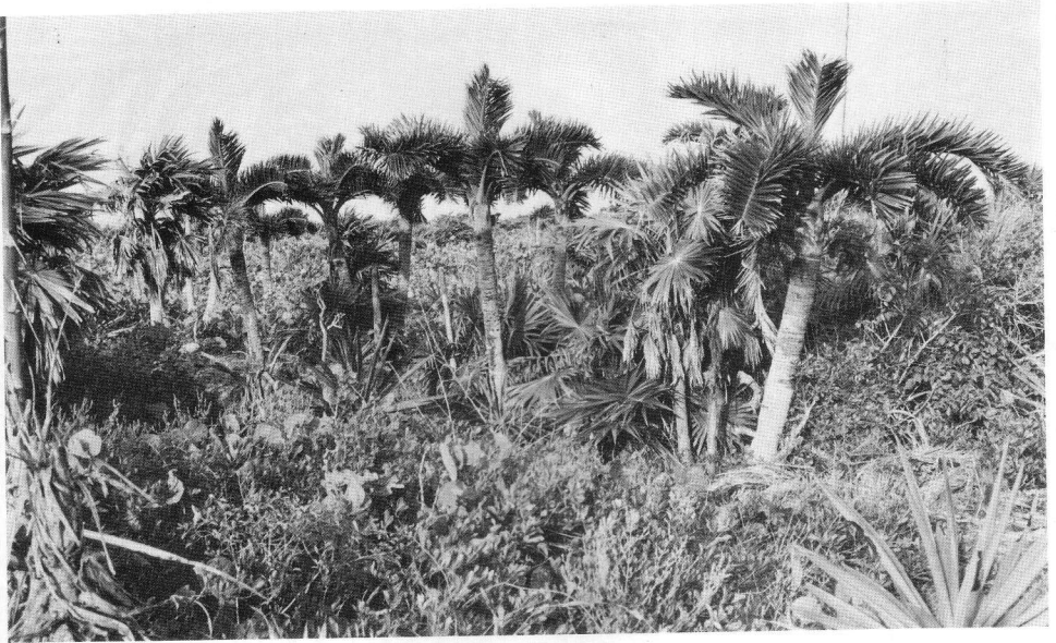
7. Kuká growing on sandy dunes near Rio Lagartos; other associated plants are: Thrinax radiata , Coccoloba wifera , Metopium brownei and Agave angustifolia .

mon to find flowering and fruiting individuals not more than 1 m tall. Another interesting aspect of this palm population is the great regeneration, evidenced by abundant young plants around mature individuals. (Figs. 5, 6, 7). Pseudophoenix sargentii is one of the most important species growing in these sandy dunes; other associated species are: