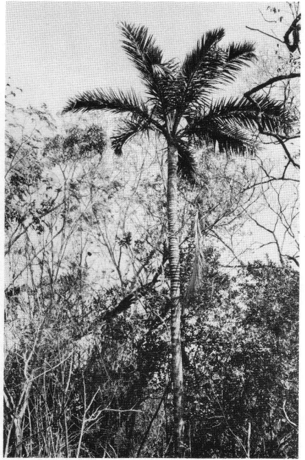
2. Pseudophoenix growing 30 km inland in a disturbed Median Forest near Bacalar Lagoon.

In its southern growing range, this species occurs more than 30 km inland, the farthest inland record known in its range. In this region Pseudophoenix grows in a transitional zone between Median and Low Forest; the species is represented by scanty but vigorous individuals up to 8 m tall. The climate in this region (according to data from the nearest meteorological