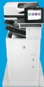
500-sheet feeder and cabinet