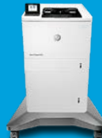
2,500-sheet HCI and stand