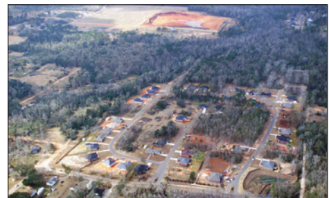
Champion Hills is one of the many subdivisions in rural Mobile County served by Orenco's effluent sewers and treatment systems.

Since 2003, South Alabama Utilities (SAU) in Mobile County, Alabama, has become the subject of nationwide classes, presentations, and tours because of its ambitious and innovative solution for serving nearly 4,000 new customers in 47 new subdivisions in western Mobile County (as well as a number of new schools and commercial properties). How? By installing more than 60 miles (96.5 km) of interconnected Orenco Sewers that are followed by 141 AdvanTex AX100s located at 13 different treatment sites. All told, SAU has the capacity to treat nearly half a million gpd (1.9 million L/d) of effluent, at better than 10 mg/L BOD/TSS.