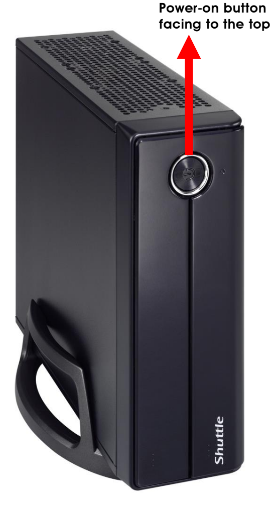
Shuttle 3L Slim-PC with PS01