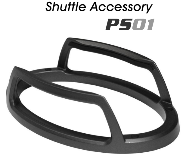
Vertical Stand PS01