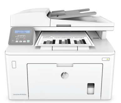
HP LaserJet Ultra MFP M230sdn

Take advantage of ultra-low printing costs with an efficient HP LaserJet Ultra MFP and enough toner to print up to 15,000 pages. Produce consistent, professional two-sided documents at print costs attractive for the price conscious customers.