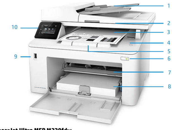
HP LaserJet Ultra MFP M230fdw