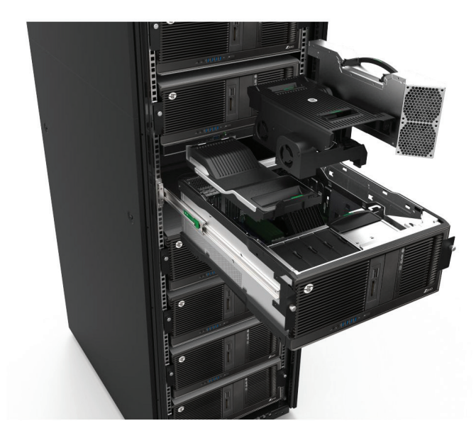
Figure 3. A rack-mounted HP Z840 installed with a HP Z6/Z8 Rack Mount Kit (B8S55AA) showing access to interior workstation components

The HP Z6/Z8 Rack Mount Kit rails install into HP racks without using tools, making setup convenient and efficient. The inner slide and mounting flanges attach to the computer chassis using a set of screws for added strength and stability. The top mounting holes are concealed underneath the top plastic trim, which must be removed along with the rear handle to attach the inner slide and mounting flanges.