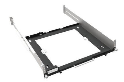
Figure 1. The HP Z2/Z4 Rack Mount Kit (W6D62AA) assembled

NOTE : The HP Z240 is not compatible with the previous HP Z2/Z4 Rack Mount Kit (WH340AA). To allow customers to rack the HP Z240 with the previous HP Z2/Z4 Rack Mount Kit (WH340AA), the HP Z240 Rail Rack Adapter Bracket (W6D63AA) is required.