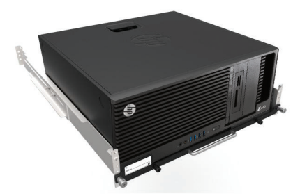
Figure 2. The HP Z440 installed in a Z2/Z4 Rack Mount Kit (W6D62AA)