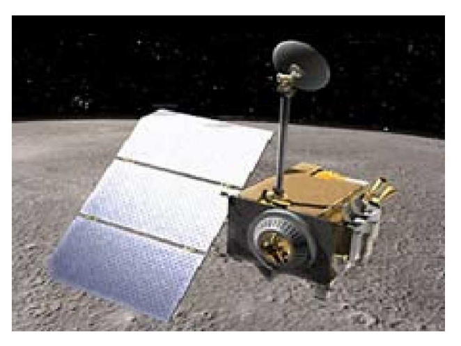
Lunar Reconnaissance Orbiter (LRO), Built at GSFC, Launched with LCROSS, June 18,2009