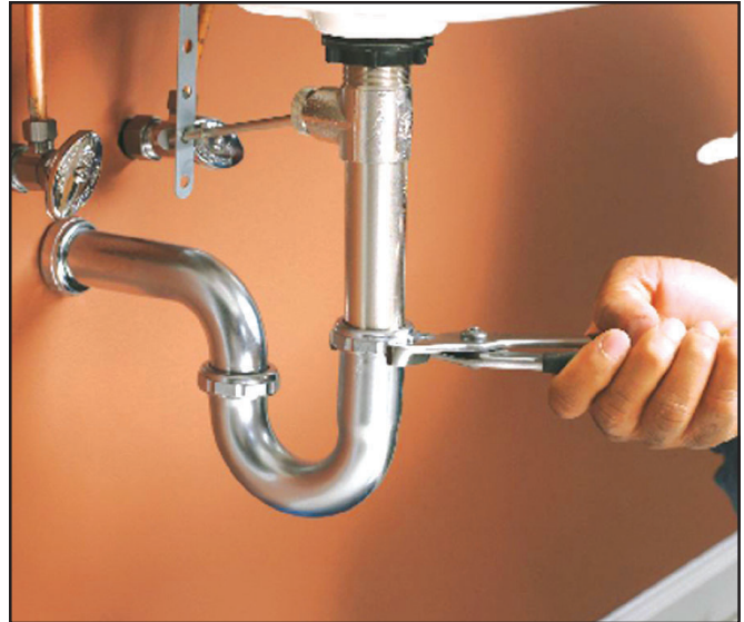
Vocational Certificate Course in Plumbing