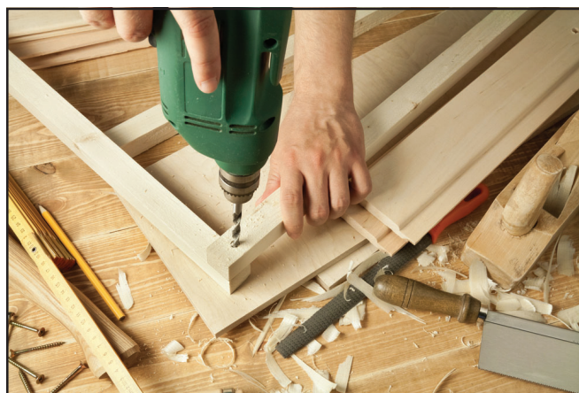
Students of NIOS in a Vocational (Carpentry) class