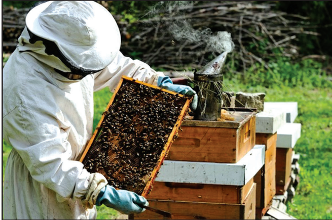
Vocational Certificate Course in Bee Keeping

NIOS also offers vocational education courses at school level keeping in view the needs of target groups. Presently 101 courses are on offer in the broad areas of Agriculture and Animal Husbandry, Business & Commerce, Computer & Information Technology, Engineering & Technology, Health & Paramedical, Home Science & Hospitality Management, Teacher Training etc. Many of the Vocational Courses are in collaboration with the industry.