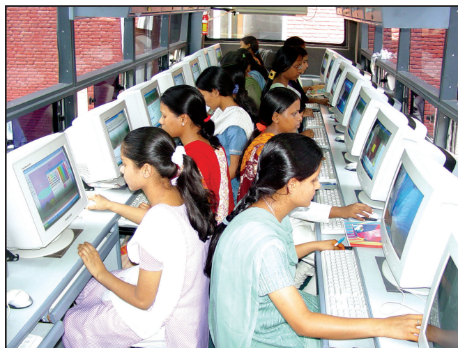
A training programme in progress

This course is equivalent to 10 th standard of the formal schooling system. One can join this course irrespective of any formal pre-qualification. Successful completion of minimum of five subjects is necessary for obtaining a certificate. Wide range of subjects are available to choose from a basket of courses. The course may be completed in a minimum period of one year to a maximum period of 5 years.