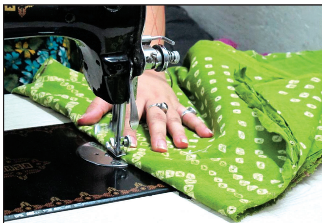
Students of NIOS in a Vocational (Cutting & Tailoring) class