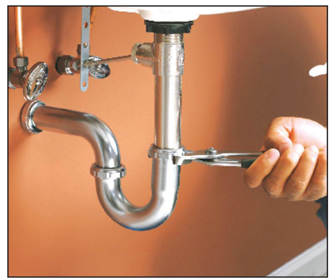
Vocational Certificate Course in Plumbing 1.3.5 Life Enrichment Courses

NIOS offers some subjects as Life Enrichment Courses viz., Paripurna Mahila (Women Empowerment), Yog, and Hindustani Music etc. These courses are meant for self development and enrichment of knowledge. No examination is conducted for these courses. Some of these courses are also available as Certificate Courses for which the examination is conducted.