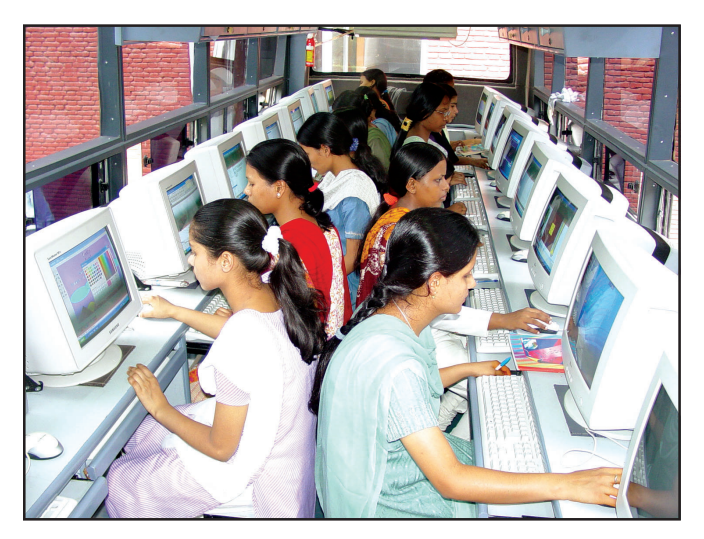
A training programme in progress

This course is equivalent to 10<sup>th</sup> standard of the formal schooling system. One can join this course irrespective of any formal pre-qualification. Successful completion of minimum of five subjects is necessary for obtaining a certificate. Wide range of subjects are available to choose from a basket of courses. The course may be completed in a minimum period of one year to a maximum period of 5 years.