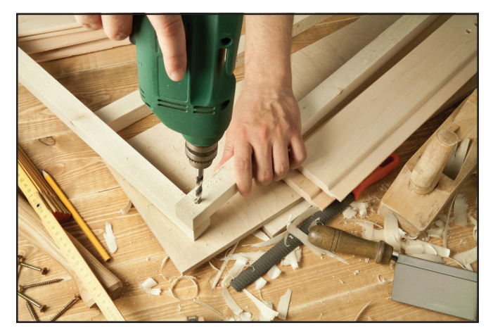
Students of NIOS in a Vocational (Carpentry) class