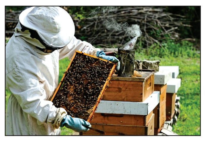
Vocational Certificate Course in Bee Keeping

NIOS also offers vocational education courses at school level keeping in view the needs of target groups. Presently 101 courses are on offer in the broad areas of Agriculture and Animal Husbandry, Business & Commerce, Computer & Information Technology, Engineering & Technology, Health & Paramedical, Home Science & Hospitality Management, Teacher Training etc. Many of the Vocational Courses are in collaboration with the industry.