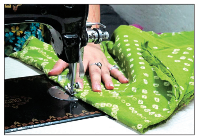
Students of NIOS in a Vocational (Cutting & Tailoring) class