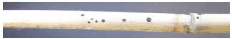
Figure 10. Black spot on stem of native common reed.