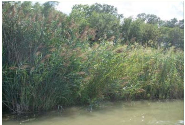
Figure 9. Non-native invasive (left) compared to native (right) common reed.