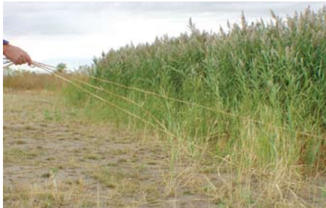
Figure 4. Stolon of non-native common reed.