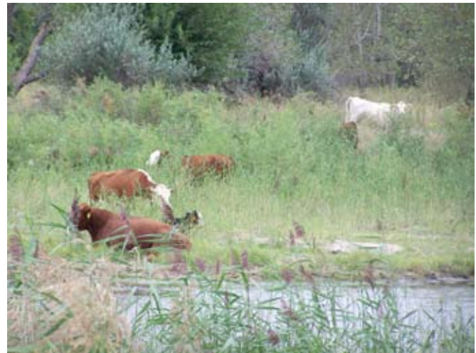
Figure 13. Cattle grazing on non-native common reed.

Grazing. Intensive grazing for a long time removes aboveground young buds and shoots, reducing size and biomass of stands (Figure 13). Grazing does not control the rhizomes and when grazing is stopped, primary shoots that are