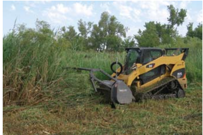
Figure 12. Mowing operation.

growth than the original stands, and will almost always develop fully within the same season. Thus, mowing is most effective in August and September.