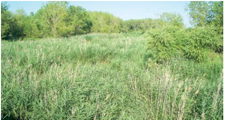
Figure 1. Non-native common reed infestation along Platte River in Nebraska.

Non-native common reed negatively impacts the native wetland habitats, resulting in reduced productivity of native plants and loss of biodiversity. Loss of