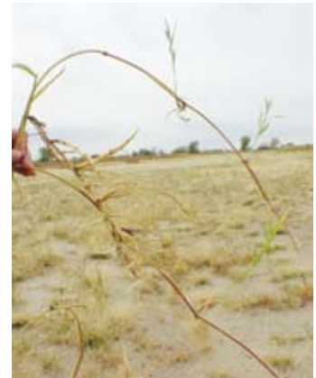
Figure 5. Single stem producing rhizome (white color) and stolon (green color).

Although the predominant means of spreading is through rhizomes and stolons, seed dispersal also occurs. Along rivers and shorelines, fragments of both vegetative parts (rhizomes, stolons) and seeds ( Figure 8 ) can be washed down-