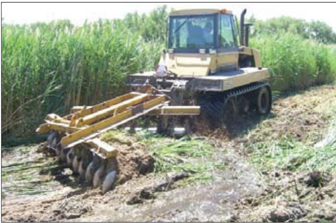
Figure 11. Disking operation.