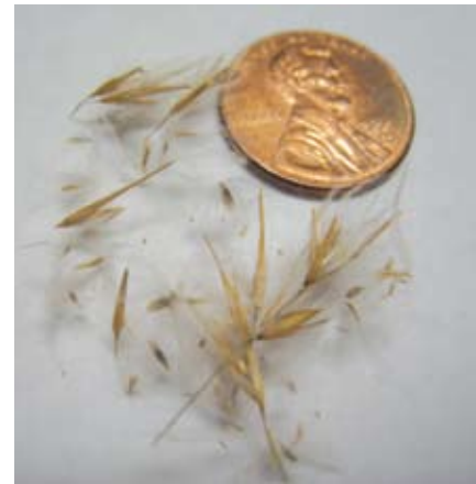
Figure 8. Non-native common reed seeds.