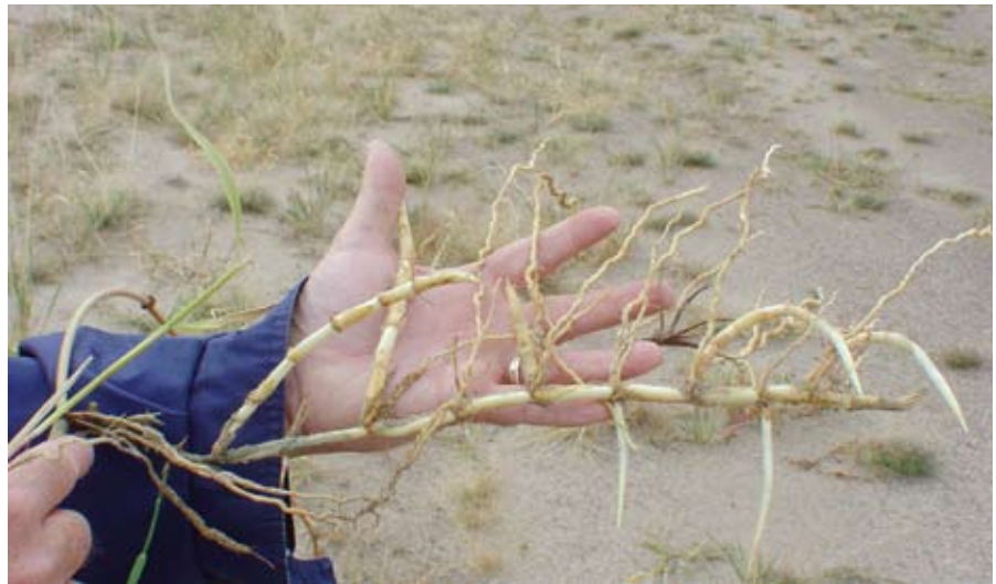
Figure 3. Rhizome of non-native common reed.

B iology of native and non-native common reed is almost identical. Therefore, further description will be made only for the non-native common reed. Non-native common reed is a perennial grass that produces a vigorous system of roots, including rhizomes (below ground, Figure 3 ) and stolons (above ground, Figure 4 ), which all form dense stands of monotypic communities ( Figure 1 ). Vegetative structures are the driving force for quick land invasion with annual lateral spread of the rhizomes ranging from 1 to 10 feet ( Figure 3 ), and stolons growing up to 80 feet long ( Figure 4 ). Roots can penetrate soils 3 to 9 feet deep and be very difficult to remove. Many times a single node can sprout and produce rhizomes that spread below the ground and stolons that spread above the ground ( Figure 5 ). This growth pattern can produce up to 200 stems per square yard that can reach up to 12 feet in height ( Figure 6 ) with a large fluffy seed head (inflorescence) ( Figure 7 ). The upright, aerial stems are derived from rhizome buds which are formed during the previous year's growth. At the end of each growing season, all the aerial stems die and growth in the following year continues from pre-existing rhizome buds ( Figures 3 and 5 ). Flowering occurs from July to September.