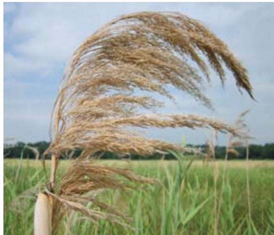
Figure 7. Inflorescence of non-native common reed.