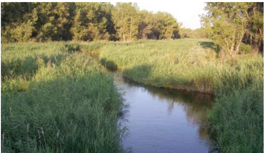
Figure 2. Narrow water channel due to infestation.

native habitat and wildlife interferes with various levels of the ecosystem and influences many recreational activities, creating a negative effect on the social and economic well being of local communities. With the loss of recreational land for fishing, hunting and boating, the local communities also lose revenue from tourism. The non-native common reed has few natural enemies on our continent and quickly forms a monoculture along lakes and waterways. Native riparian plants such as cattails are quickly displaced by non-native common reed, which then displaces native grasses and forbs.