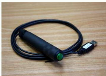
Patient Response Unit