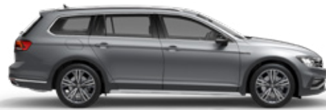
Pyrite Silver Metallic