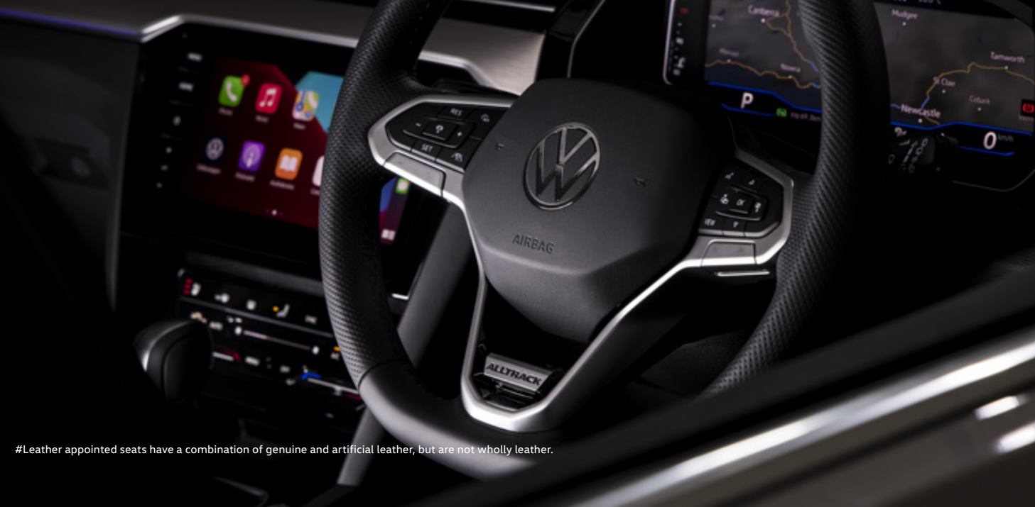
#Leather appointed seats have a combination of genuine and artificial leather, but are not wholly leather.

R-Line styling cues in the optional R-Line package (Elegance variant only) bring an undeniably sporty edge to the Passat’s cabin. Features such as R-Line scuff plates in door apertures, R-Line decorative inserts in brushed silver, brushed stainless steel pedals and an alluring R-Line multi-function sports steering with wheel paddles, will make you the envy of your friends.