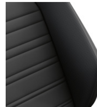
Passat R-Line Black Nappa (Optional in R-Line package) Leather appointed #

# Leather appointed seats have a combination of genuine and artificial leather, but are not wholly leather.