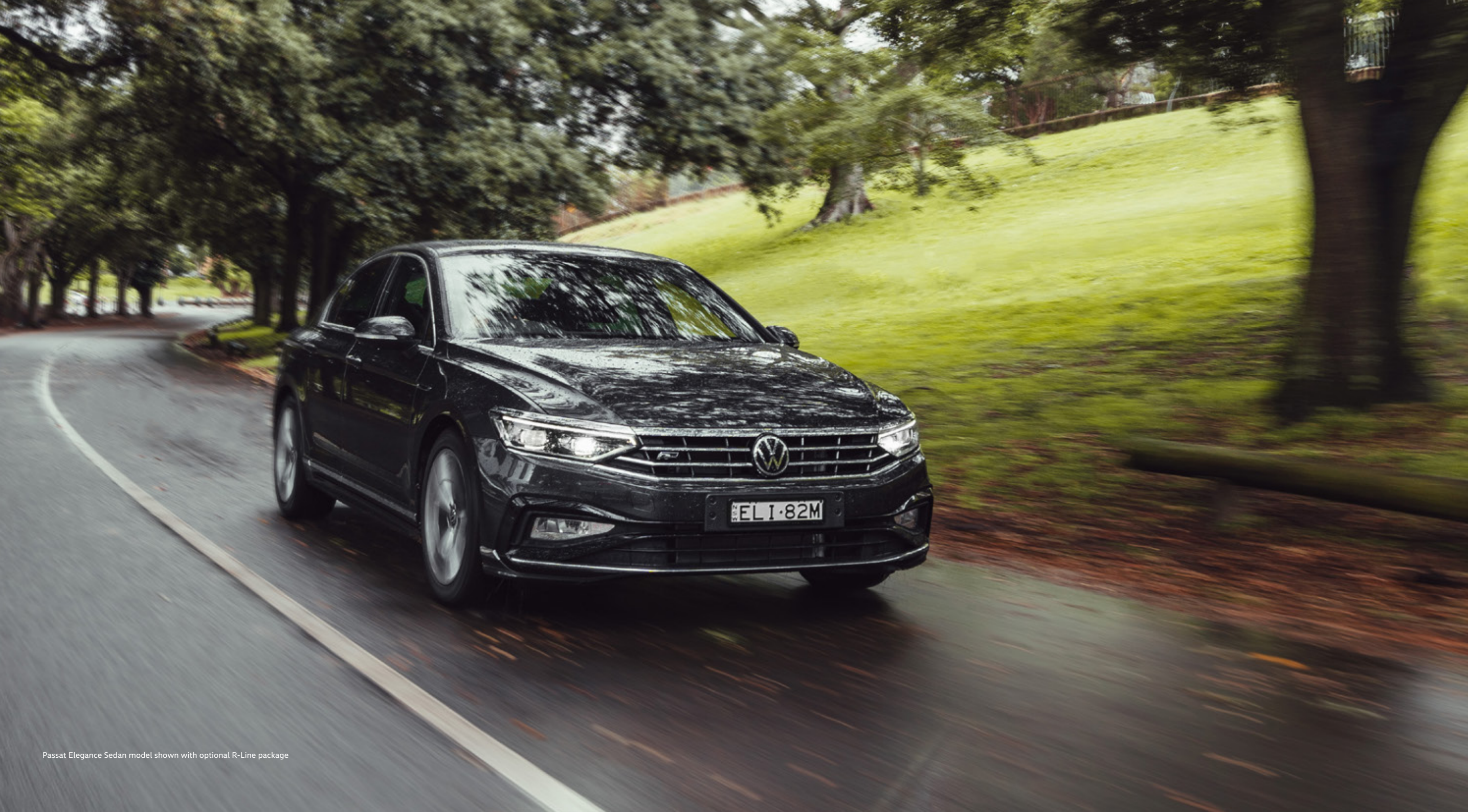
Passat Elegance Sedan model shown with optional R-Line package