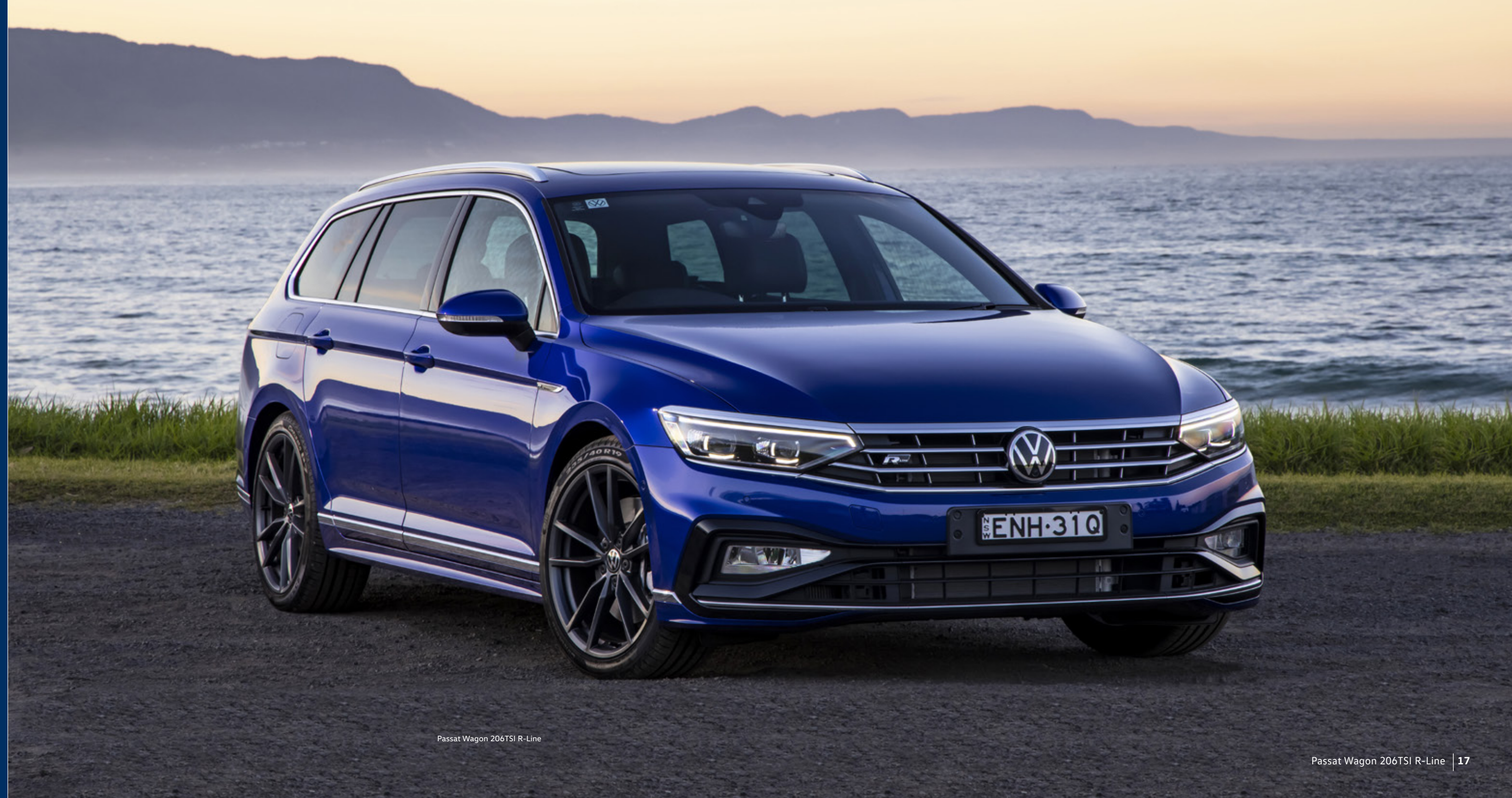
Passat Wagon 206TSI R-Line

Proving that the Passat Wagon 206TSI R-Line never forsakes comfort for pure driving performance are additional conveniences designed to pamper and surprise. Heated and electric front seats with driver massage are the epitome of comfort, while easy entry and memory function makes it easy to find a supported seating position. For the perfect mood-setter, the Passat Wagon 206TSI R-Line also allows you to choose from among 30 ambient interior light colours.