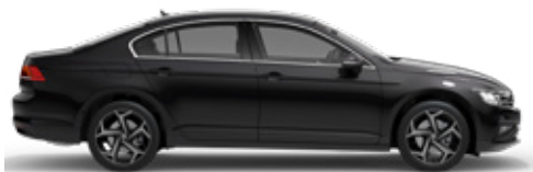
Manganese Grey Metallic