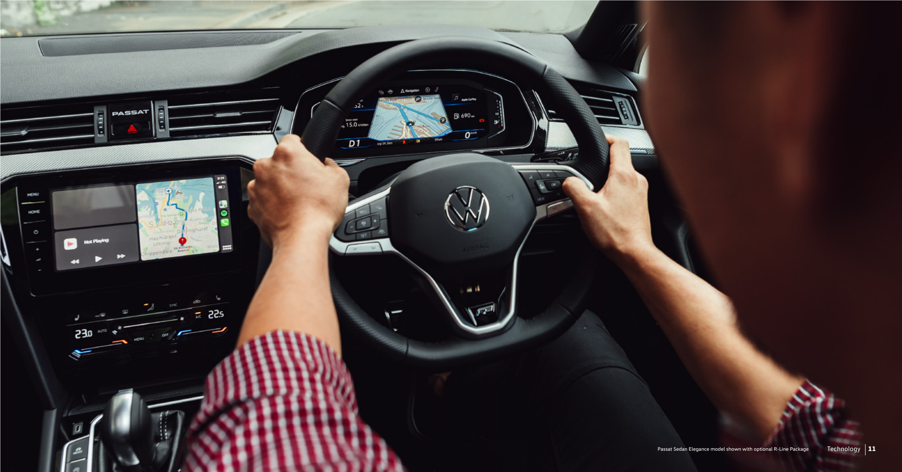
Passat Sedan Elegance model shown with optional R-Line Package

*Safety technologies are designed to assist the driver, but should not be used as a substitute for safe driving practices. ~App-Connect featuring wireless Apple CarPlay® and wireless Android Auto™ is compatible with the latest versions of iOS and Android, active data service required, optional connection cable (sold separately).