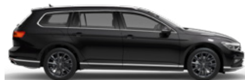
Manganese Grey Metallic