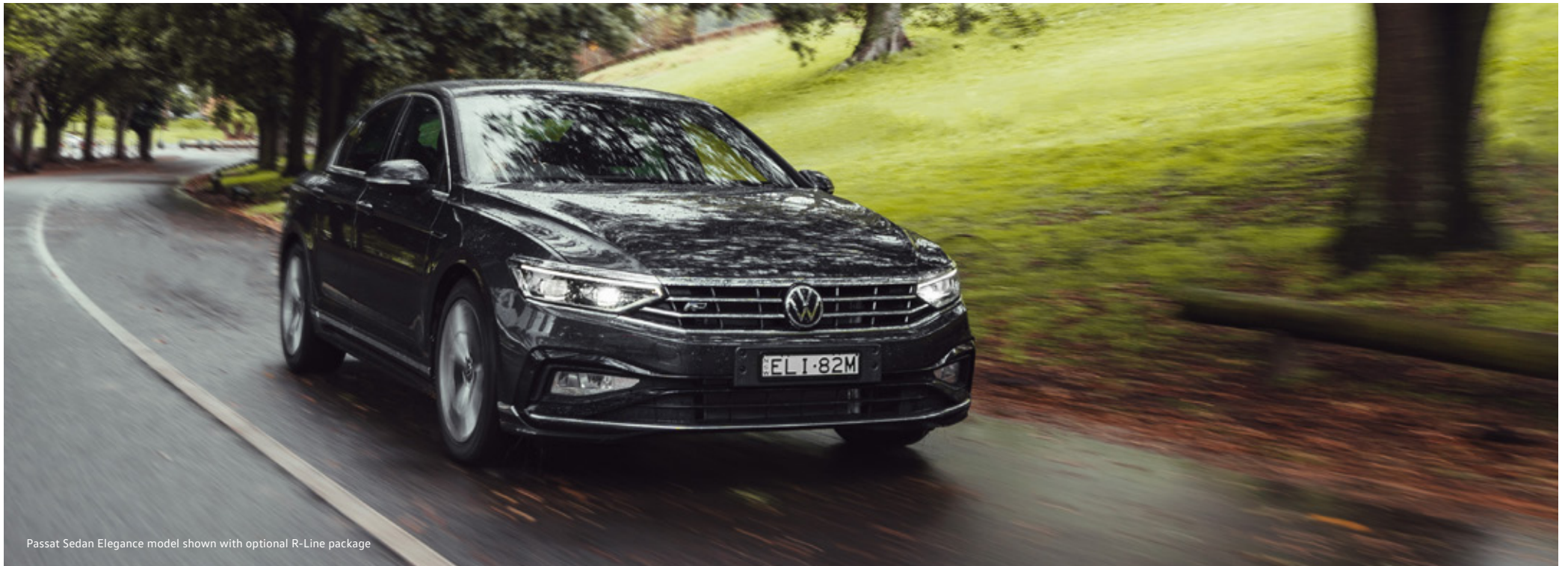
Passat Sedan Elegance model shown with optional R-Line package