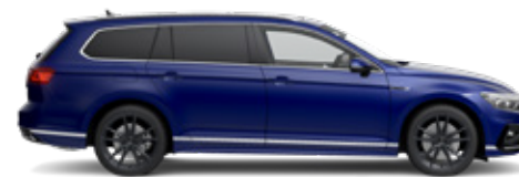
Lapiz Blue Metallic*