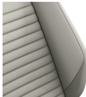
Passat Elegance - Mistral Nappa (Optional) Leather appointed #