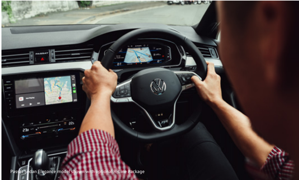
Passat Sedan Elegance model shown with optional R-Line Package