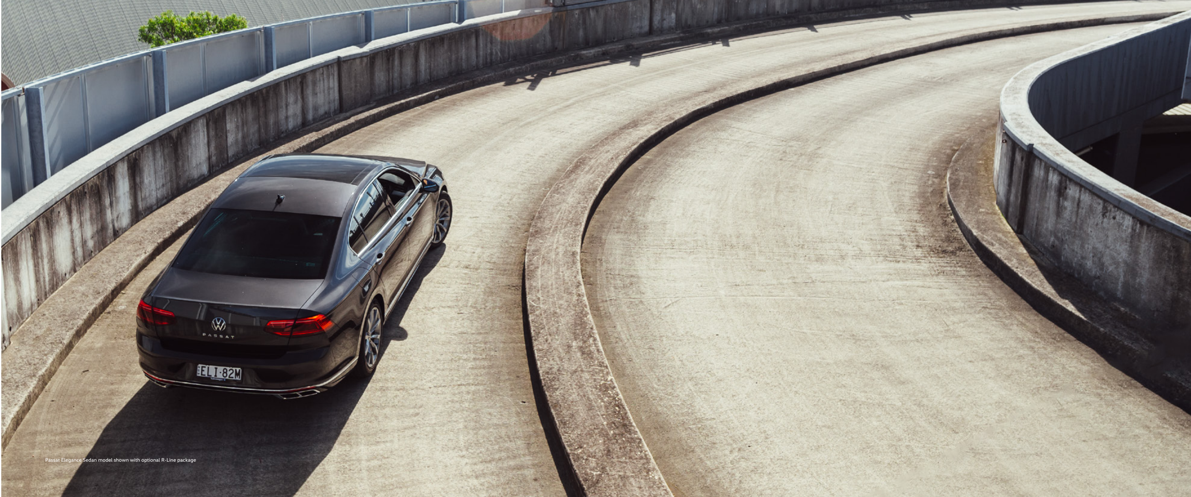
Passat Elegance Sedan model shown with optional R-Line package