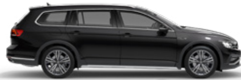
Manganese Grey Metallic