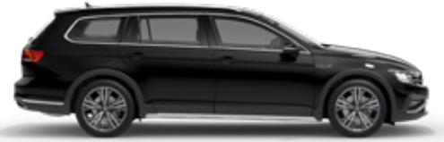
Deep Black Pearl Effect