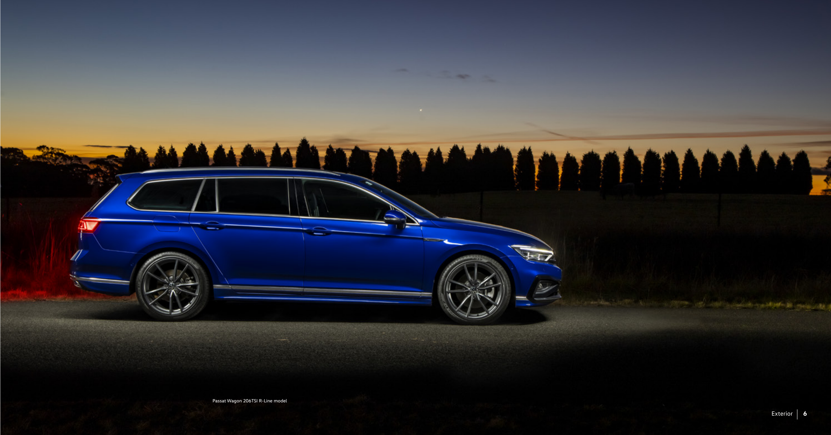
Passat Wagon 206TSI R-Line model