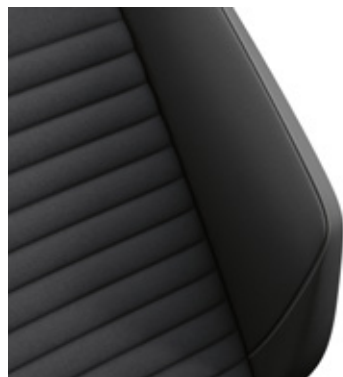
Passat Elegance - Titan Black Nappa Leather appointed #