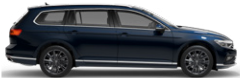
Aquamarine Blue Metallic