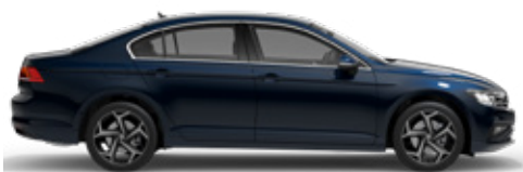
Aquamarine Blue Metallic