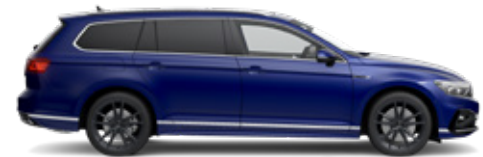
Lapiz Blue Metallic*