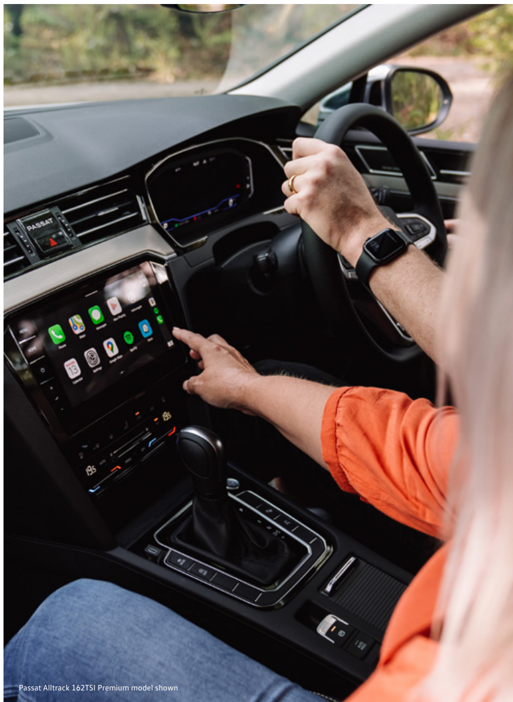
Passat Alltrack 162TSI Premium model shown