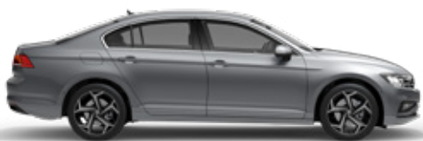
Pyrite Silver Metallic