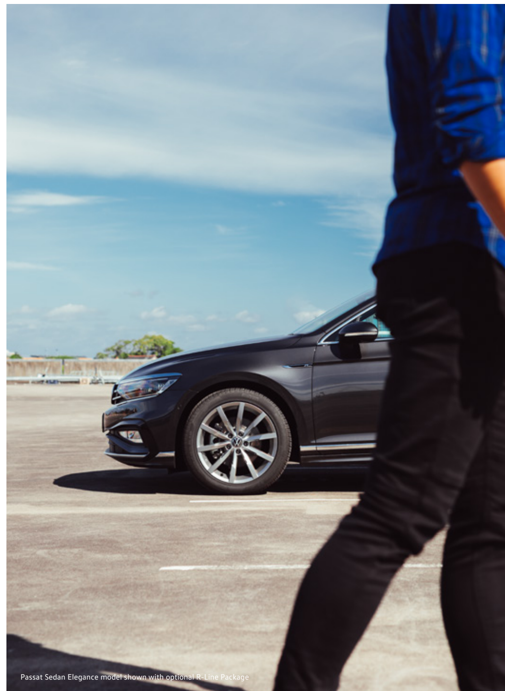
Passat Sedan Elegance model shown with optional R-Line Package