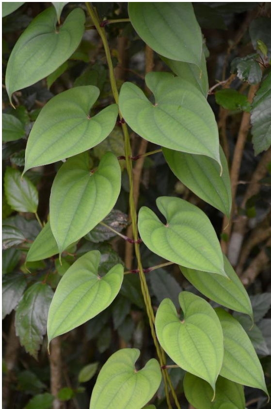
Dioscorea alata Chodat

A primarily tropical family extending to warm temperate regions with 3 genera and about 800 species of twining, rhizomatous vines or lianas, most of which belong to the genus Dioscorea . Dioscoreaceae is represented in the New World only by Dioscorea with a total of about 400 species, 371 of which are found in the Neotropics. For the most part, they are found in moist, wet or seasonal lowland forest.