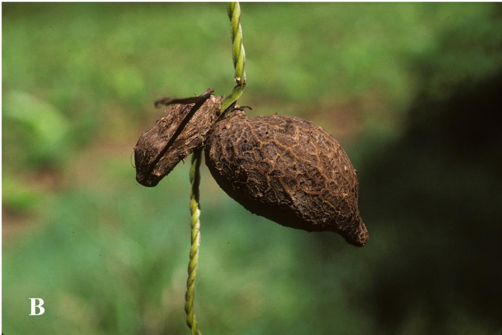
Figure 2. A. Woody tuberous base of Dioscorea mexicana . B. Aerial starchy bulbil of Dioscorea alata .