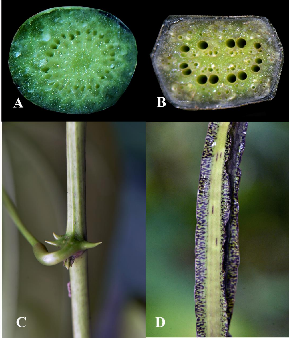
Figure 1. A & B. Cross sections of stems in 2 species of Dioscorea , showing collateral vascular bundles some of which have xylem with wide vessels. C. Petiole with geniculate base and stipular thorns of Dioscorea sp. D. Square, 4-winged stem of Dioscorea sp.