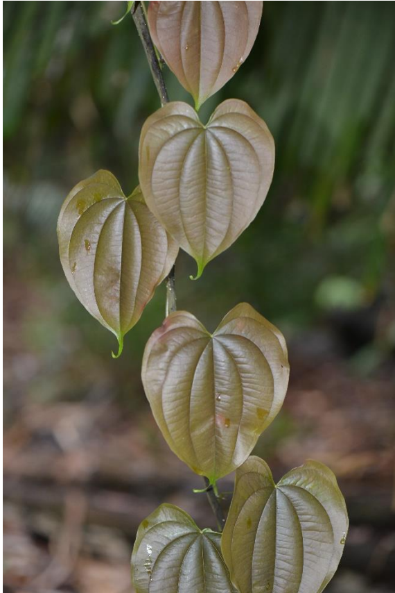
Dioscorea sp., photo by P. Acevedo.

Dioecious, twining vines, herbaceous or slightly woody. Stems cylindrical, angular or winged, sometimes provided with thorns; cross sections in sub-woody species with visible wide vessel element lumens. Leaves alternate or opposite, simple or palmately lobed, with 3-7(-14) main arcuate, parallel veins, the margins entire; petioles usually long, pulvinate on both ends, sometimes geniculate; stipules often an auricular prolongation of the petiolar sheath or sometimes spiny; axillary bulbils often present, fleshy, of various shapes, size and textures. Inflorescences axillary, spikes, racemes, racemiform or paniculate thyrses, pendulous or ascendant produced in axillary spikes, racemes, or panicles. Flowers unisexual, actinomorphic, 6-merous; perianth minute; staminate flowers with 6 stamens