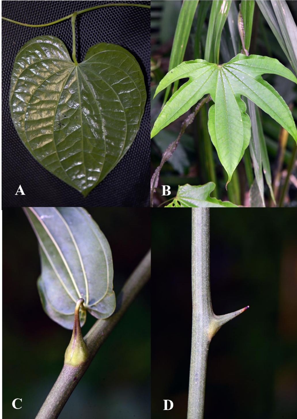
Figure 3. Leaf features in Dioscorea . A. Cordate blade with 9 main, arcuate veins of Dioscorea sp. B. Palmately lobed blade with 9 main, arcuate veins of Dioscorea sp. C & D. Dioscorea sp. with persistent indurate (spine-like) petiole, before and after shedding of blade.