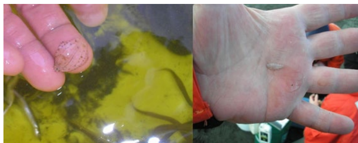
Figure 7. Young of Year (Larval) marine flat fish captured in near shore surveys in Resurrection Bay, circa 2015. Displayed on scientists' hands for context.

Field surveys in Alaska confirm that nearshore areas are important nurseries for early life stages of FMP species and their prey. A majority of species caught in nearshore surveys are in larval, juvenile and subadult life stages. Walleye pollock, pink salmon, and chum salmon are among the most common FMP species observed in surveys supporting the Nearshore Fish Atlas of Alaska