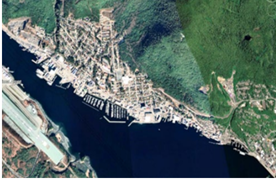
Figure 8. Satellite image of shoreline coastal development, generated using Google Earth Pro.

installation or removal. Concrete and steel, on the other hand, are relatively inert and do not leach contaminants into the water.