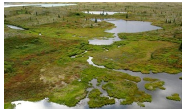
Figure 2. Wetland, pond, stream complex; headwaters upstream of the confluence of the North and South fork Kotuli’s, circa 2010.

Headwater streams provide habitat complexity, increased prey availability, and refuge from predation (Meyer et al. 2007, Whigham et al. 2012). In Alaska, headwater streams are abundant and can be an important spawning and rearing habitat for juvenile salmonids (Woody and O’Neal 2010, Copeland et al. 2014). Food webs in headwater reaches are reliant on terrestrial subsidies from invertebrates, riparian areas, and instream nutrients (Piccolo and Wipfli 2002, Wipfli and Gregovich 2002, Walker et al. 2012).