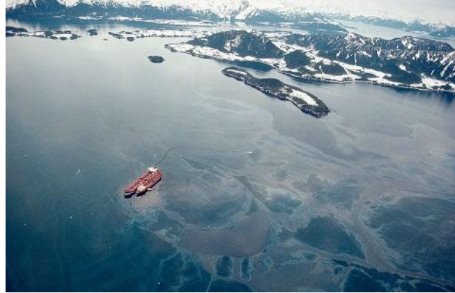
Figure 9. Aerial photograph of the Motor Vessel Exxon Valdez, circa March 1989.

One such gas leak occurred in Cook Inlet in 2021, when aging infrastructure from an oil platform's natural gas pipeline ruptured leaking between 5,947 to 9,203 m 3 (210,000 to 325,000 ft 3 ) of natural gas (98.67 percent methane and other hydrocarbons) per day. The leak was discovered on February 7, 2017, and before coming under control was believed to have released 235,030 m 3 (8.3 million ft 3 ) of natural gas 41 . Since then there were several other leaks of lesser volumes, all more readily put under control.