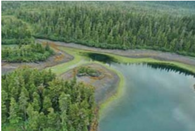
Figure 5. Eelgrass ( Zostera marina ) in Prince William Sound. Published in Coastal Impressions, A Photographic Journey along Alaska Gulf Coast; A.P.J., 2012.

The GOA stretches west from the Alaska Peninsula near Kodiak Island to the southern tip of Prince of Wales Island. Its northern boundary is the coast of Alaska and the southern extent is a line from the southern end of Kodiak Island to the Dixon Entrance. It includes Cook Inlet, Prince William Sound, the Copper River Delta and the 400-mile long Alexander Archipelago. In southeast Alaska, the Alexander Archipelago has over 2,900 estuaries encompassing a total surface area of 30,721 km 2 (11,861 mi 2 ) (Albert and Schoen 2007). At 1,181 hectare (2,900 acres), the Stikine River Delta is the largest of these estuaries. The GOA includes two large estuary systems: Cook Inlet, which is approximately 370 km 2 (230 mi 2 ) with the