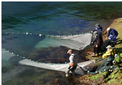
Figure 6. Scientists from Ted Stevens Marine Research Institute conducting nearshore Surveys.