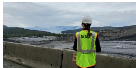
Figure 4. HCD Staff survey a mine tailings impoundment in coastal watershed 2021.

Abundant volumes of cold, well-oxygenated water are an essential habitat attribute supporting freshwater phase salmon populations. However, most mining operations need to remove water (ground and surface water) from the mine site and excavated pit, and manage water both upstream and downstream of the excavation. Water is essential to mineral processing as well as