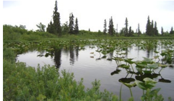
Figure 1. Denslow Lake, Chuitna watershed, circa 2002.

Snowmelt and rainfall saturate the Alaskan landscape, forming extensive freshwater wetland areas ranging from lowlands and depressions to hillsides and slopes (Hall et al. 1994). Alaska's wetlands occupy approximately 43 percent or 690,000 km 2 (266,410 mi 2 ) of the state's 1.7 million km 2 (663,267 mi 2 ) surface area (Dahl 1990). The majority of Alaska's wetlands are in the interior, Arctic, and western regions of the state. Only 42 percent of Alaska's wetlands are mapped (USFWS 2013).