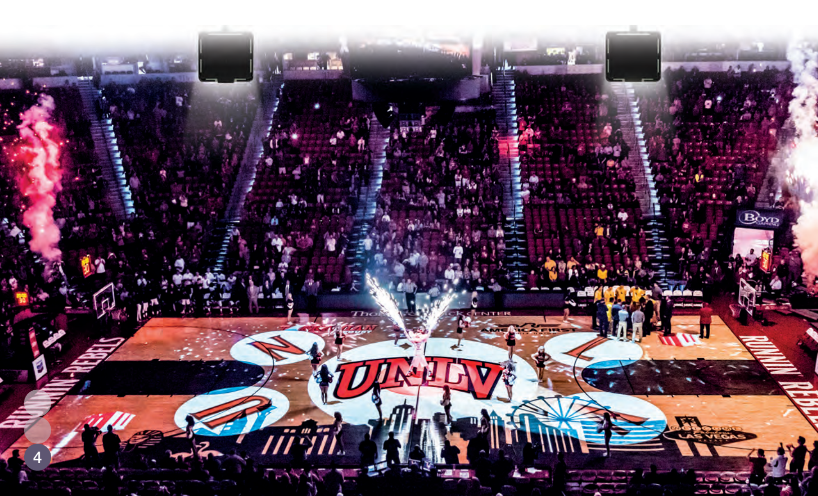
Image projected using Epson Pro L25000U WUXGA 3LCD laser projectors.

We understand that each classroom and campus facility presents a unique opportunity to impact and heighten the student experience. From high-brightness, large-venue products for well-lit spaces to interactive whiteboarding solutions that make collaborative, personalized learning a regular part of instruction, Epson is the world leader in projection technology.