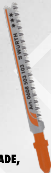
JIGSAW BLADE, PLASTIC Art. No. 0608 503 103