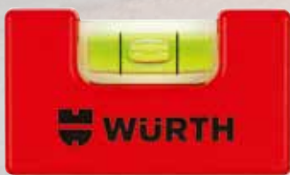
SMALL SPIRIT LEVEL WITH MAGNET