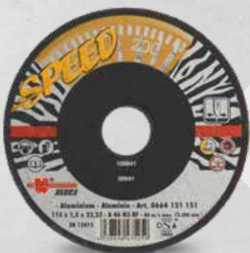
CUTTING DISC, LONG-LIFE & SPEED Art. No. 0664 631 248