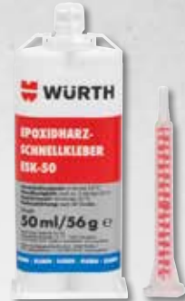
FAST-ACTING EPOXY RESIN ADHESIVE ESK-50