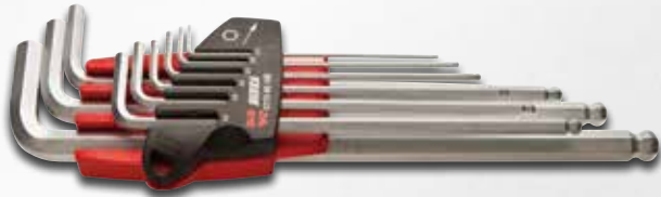
HEXAGON KEYS, METRIC - SET OF 9