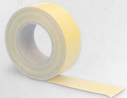
ASSEMBLY TAPE SPECIAL