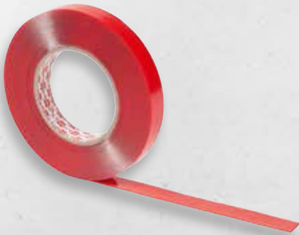
POWER MOUNTING TAPE