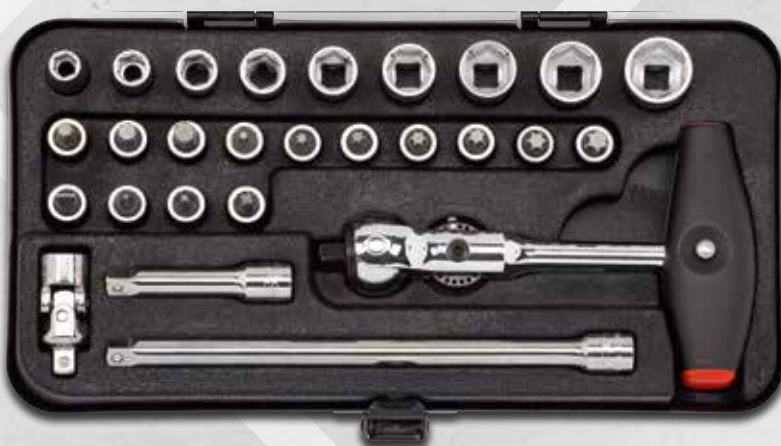
1/4" BALL-HEAD RATCHET SOCKET SET