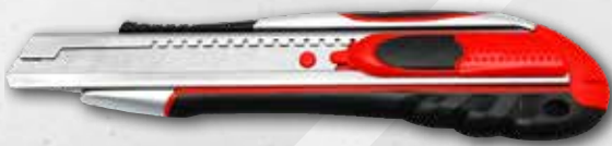
2C CUTTER KNIFE WITH SLIDE