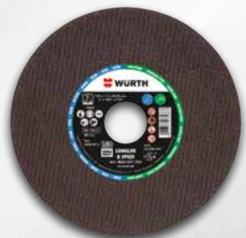
LONGLIFE & SPEED CUTTING DISCS Art. No. 0664 641...