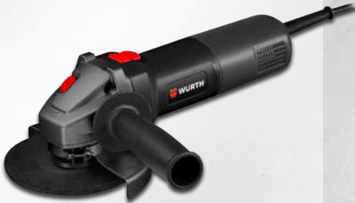
125MM (5'') ANGLE GRINDER - 750W Art. No. 0702 481 0