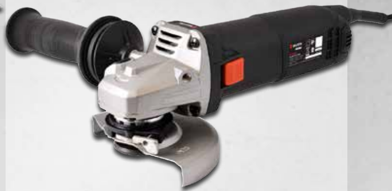
125MM (5'') ANGLE GRINDER - 1300W Art. No. 5717 017 090