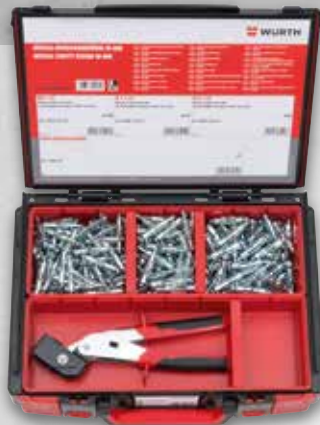
W-MH/L METAL HOLLOW-WALL ANCHORS