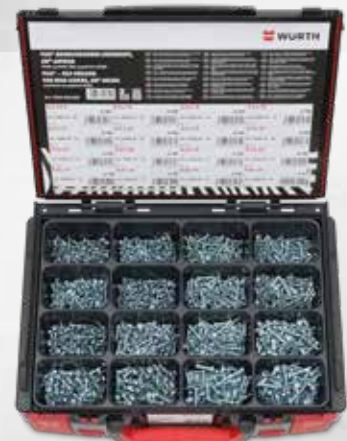
PIAS® DRILLING SCREWS, PAN HEAD ASSORTMENT