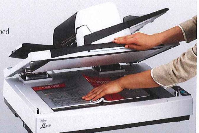
fi-6770 with flatbed

The integrated operating panel and LED give at-a-glance settings, operating status and other information. The fi-6670 and fi-6770 scanners can be operated through USB or SCSI interfaces, allowing for direct TWAIN and ISIS driver control.