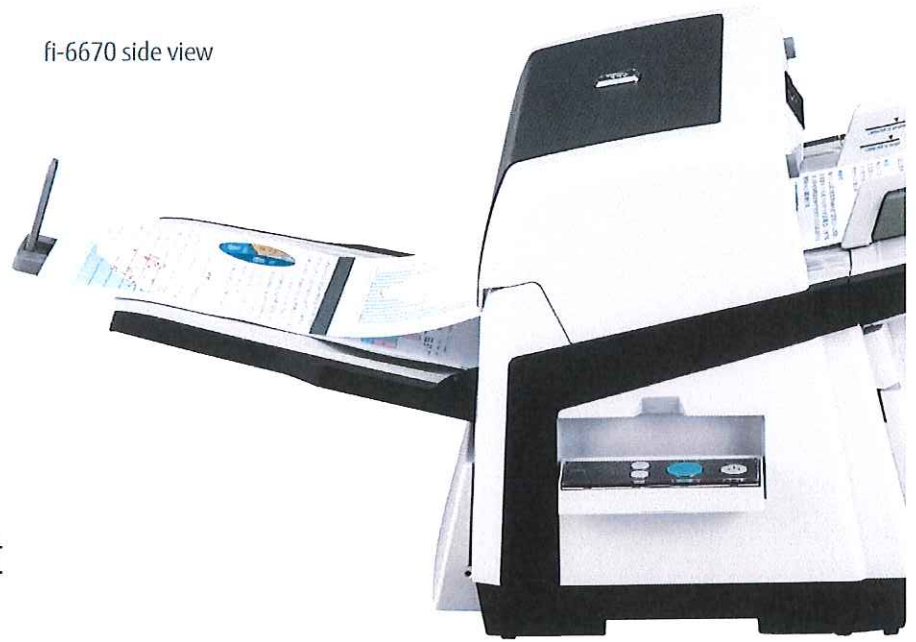
fi-6670 side view