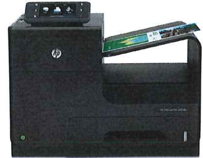
(HP Officejet Pro X551 dw color printer)

The next generation of printing is here. Looks and runs like a laser, but costs half as much per page. 2 Print up to twice the speed of laser 1 —using HP PageWide Technology. Help workgroups thrive with versatile functions and easy manageability tools.