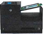
(HP Officejet Pro X451 dw color printer)