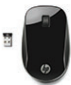
HP Z4000 Black Wireless Mouse H5N61AA