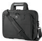
HP 14 in Value Topload Case L3T08AA